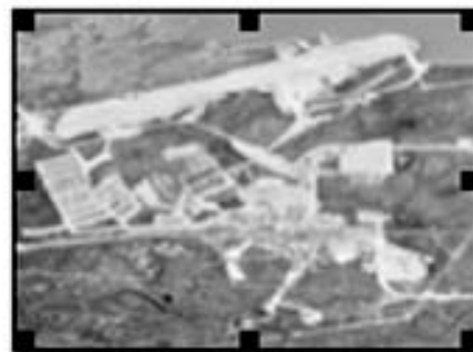
LEFT: GILLAM 1962