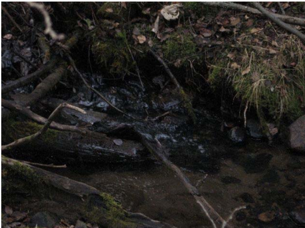
Photo 24. West Perimeter Ravine representative of HS6.