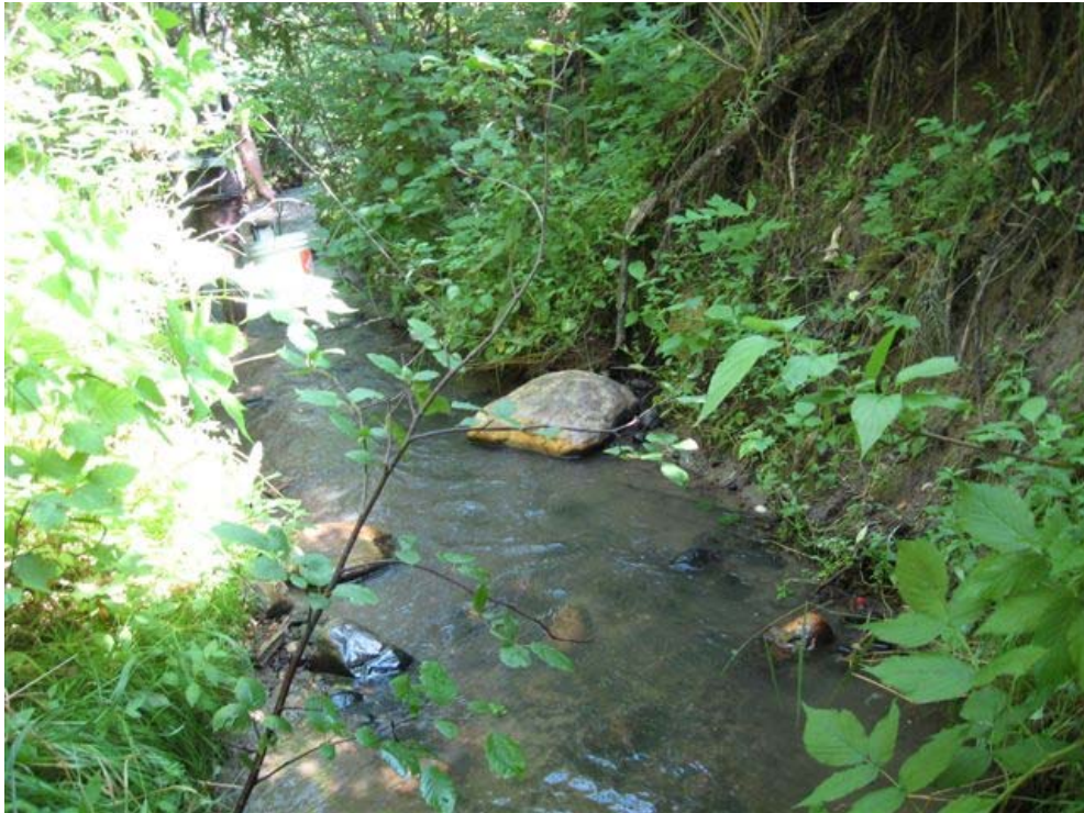
Photo 69. Duke Ravine representative of HS3.