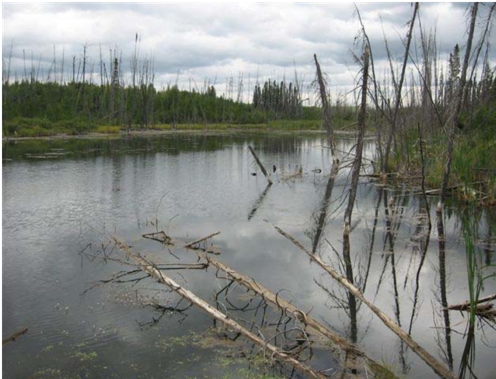
Photo 60. Upper Reaches of East Ravine representative of HS1.