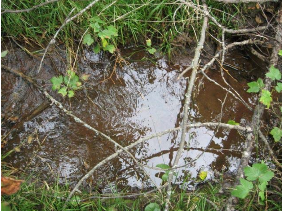
Photo 35. West Ravine within the Star Pit representative of HS7.