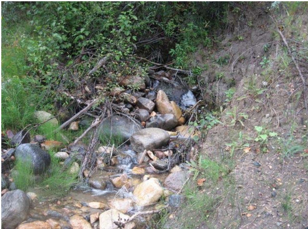
Photo 20. Mouth of West Perimeter Ravine.