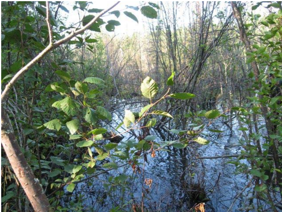
Photo 74. Duke Ravine within the PKCF representative of HS1.