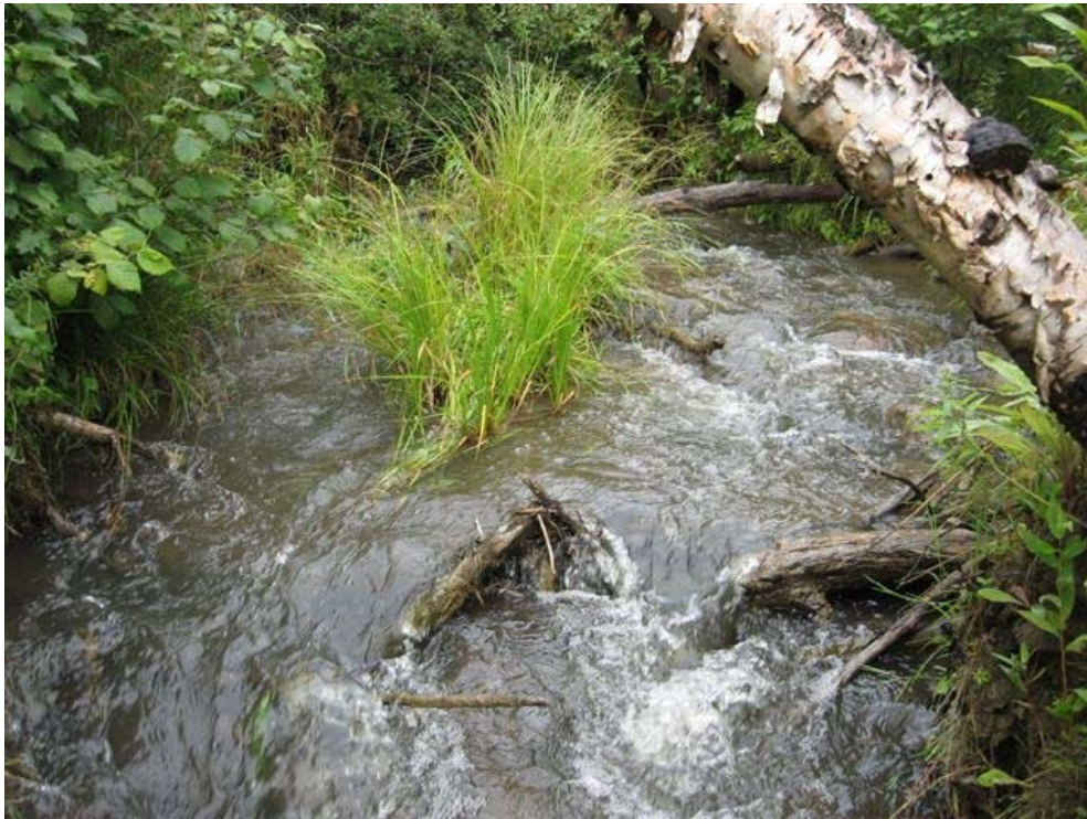
Photo 44. East Ravine representative of HS4.