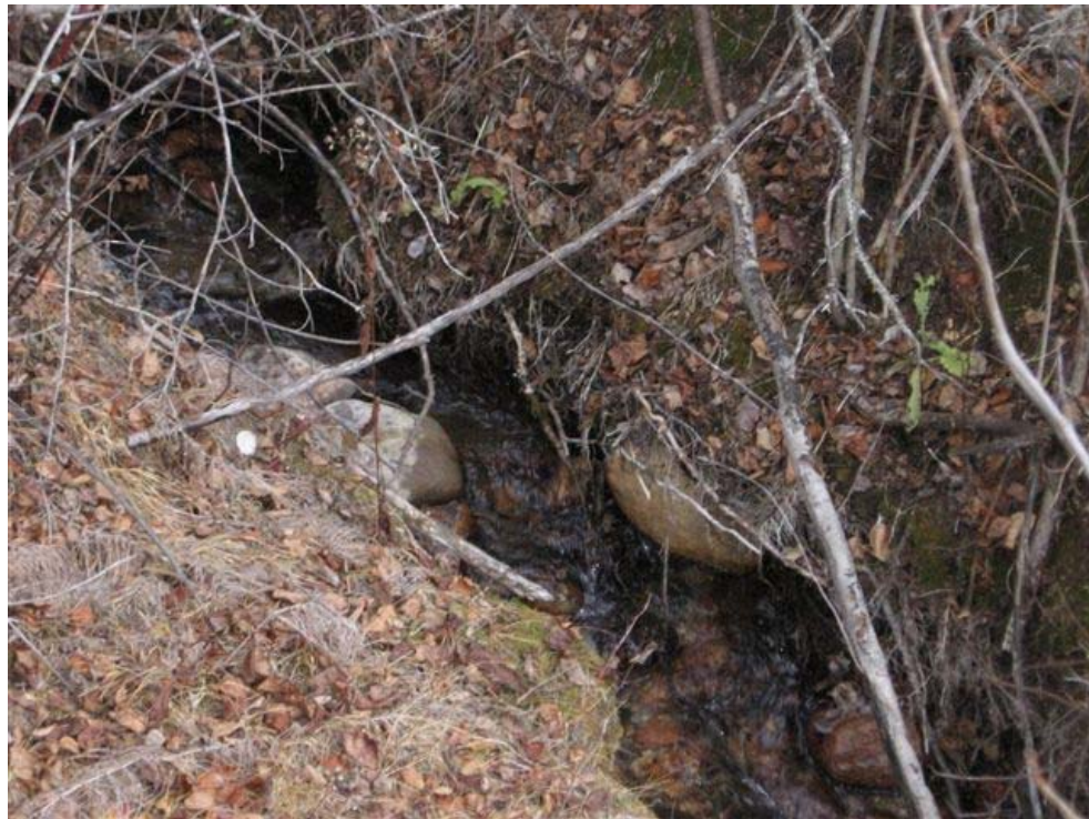
Photo 22. West Perimeter Ravine representative of HS2.