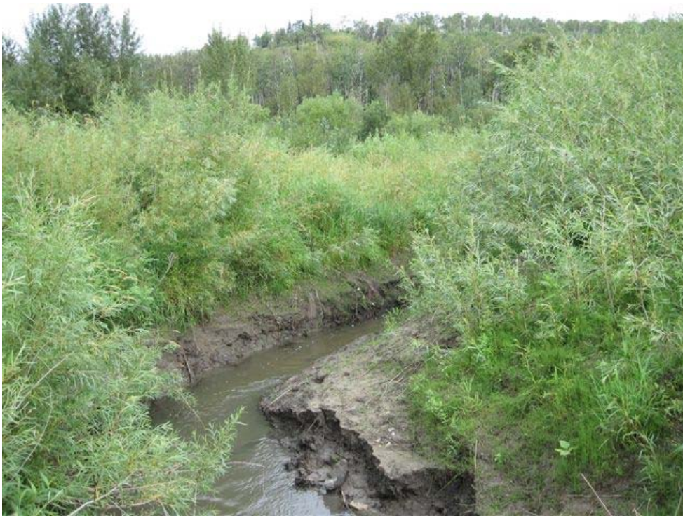
Photo 42. East Ravine representative of HS1.