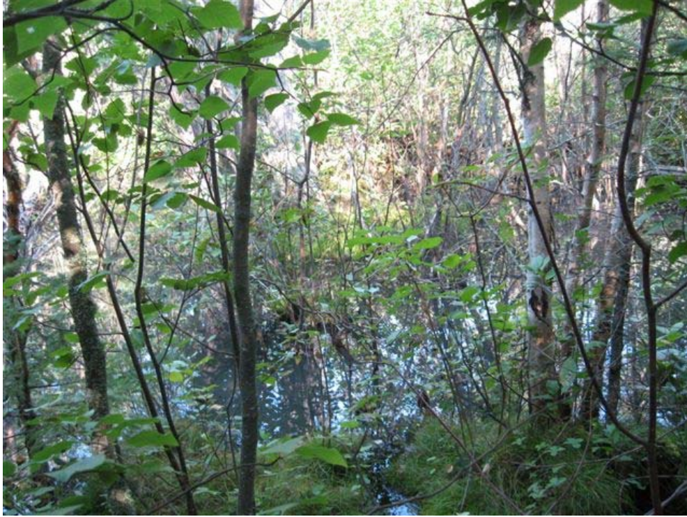
Photo 75. Duke Ravine within the PKCF representative of HS3.