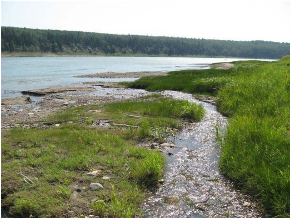
Photo 67. Mouth of Duke Ravine.