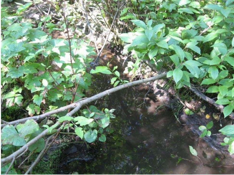
Photo 77. Duke Ravine within the PKCF representative of HS7.