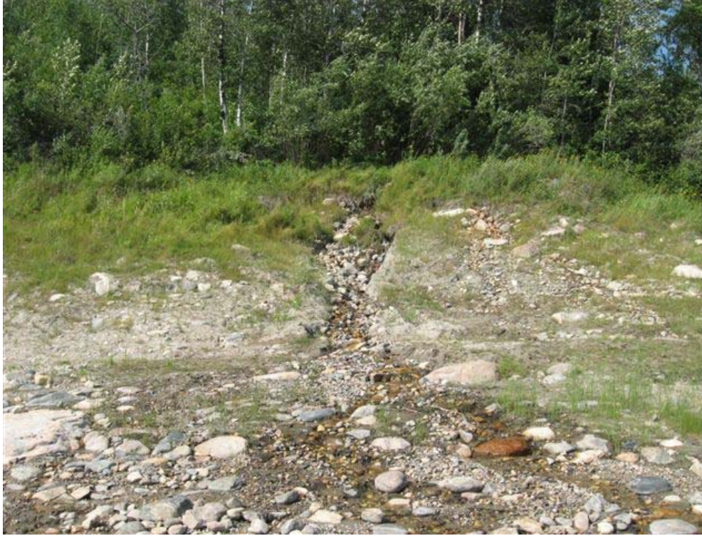
Photo 79. Mouth of FALC Ravine.