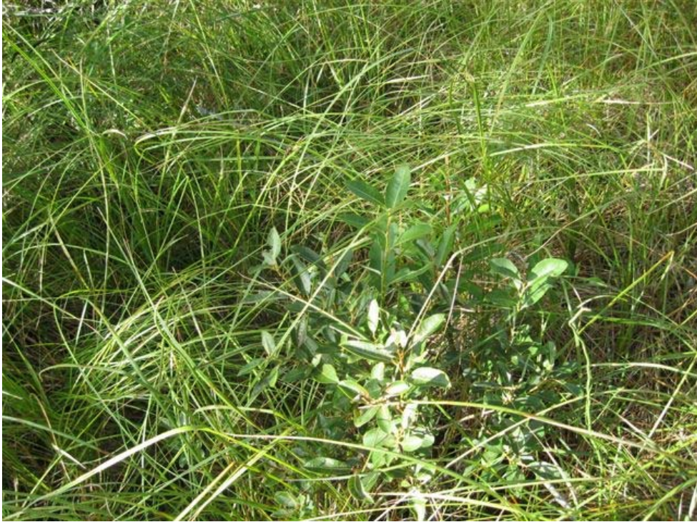
Photo 1. Wapiti Ravine within the Coarse PK Pile.