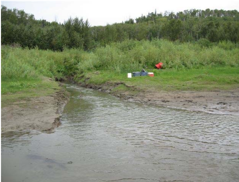
Photo 40. Mouth of East Ravine.