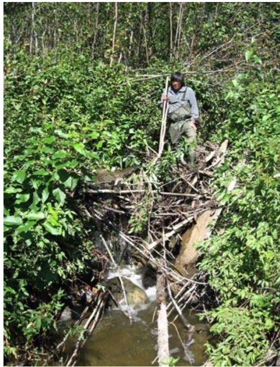
Photo 8. 101 Ravine representative of HS1.