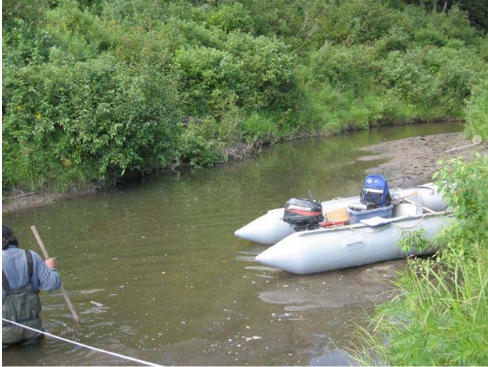
Photo 95. Mouth of English Creek.