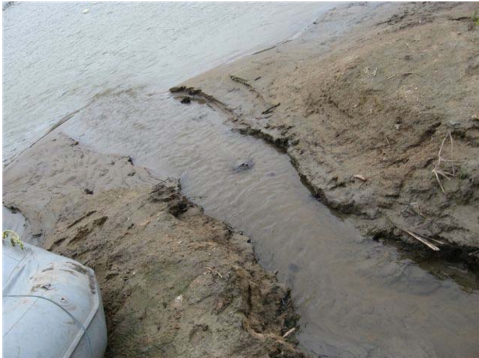
Photo 26. West Ravine representative of HS1.