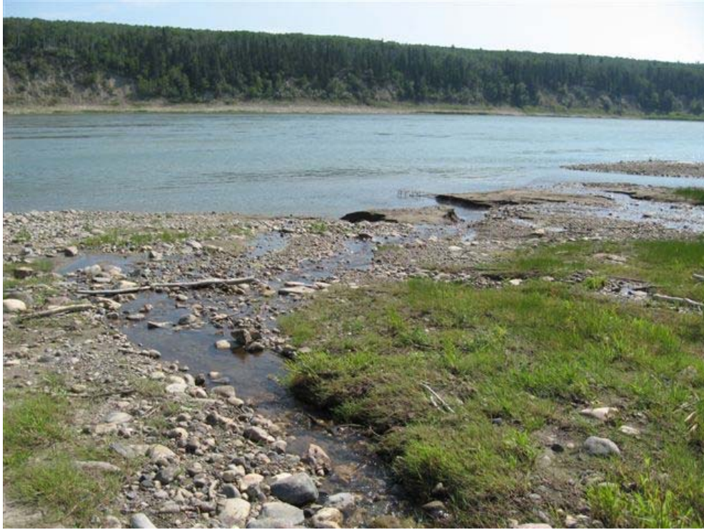
Photo 73. Duke Ravine representative of HS11.