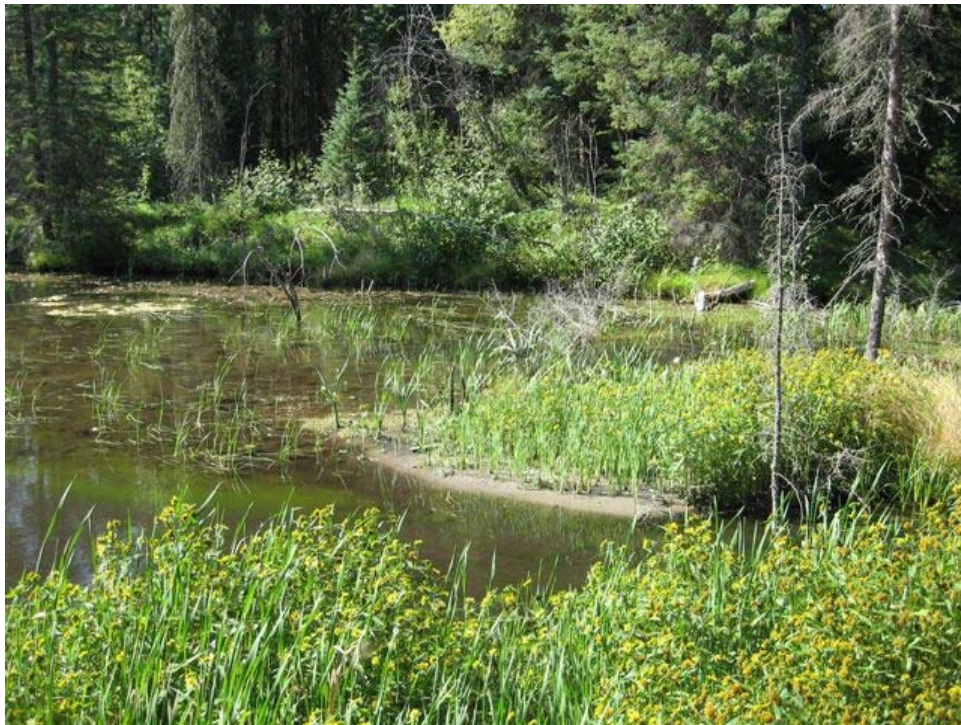
Photo 50. East Ravine within the Star Pit representative of HS2.