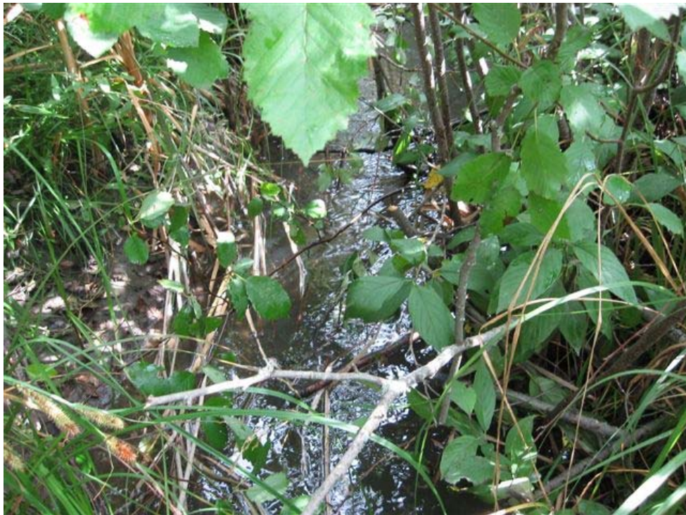
Photo 62. Upper Reaches of East Ravine representative of HS8.