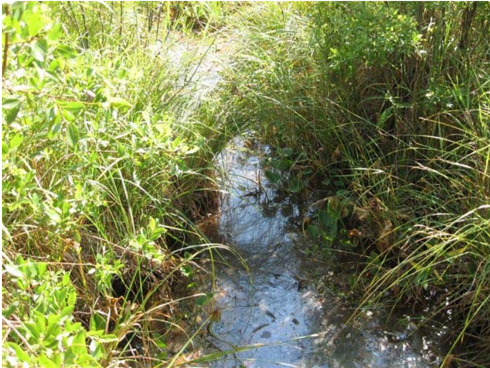
Photo 18. 101 Ravine within the Overburden Pile representative of HS13.