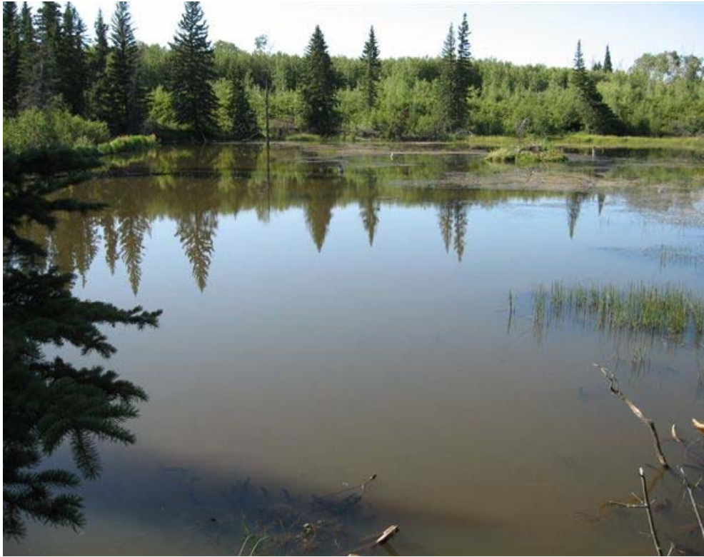
Photo 17. 101 Ravine within the Overburden Pile representative of HS9.