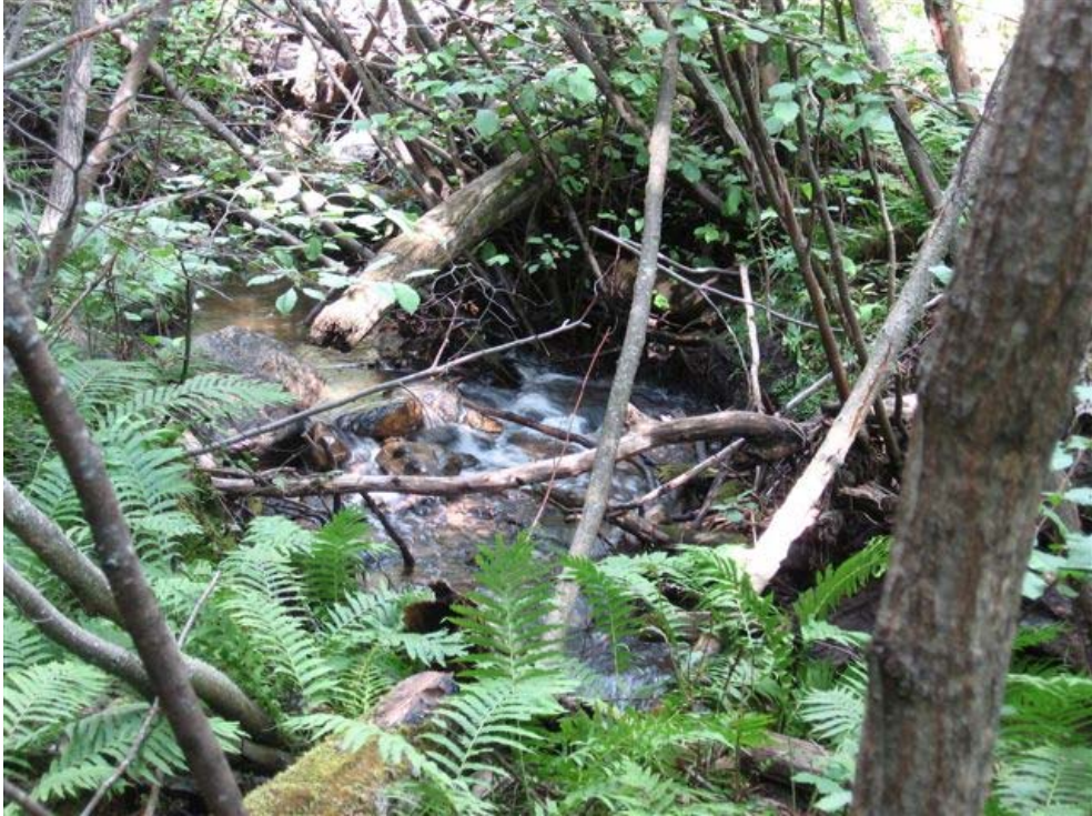
Photo 11. 101 Ravine representative of HS5.