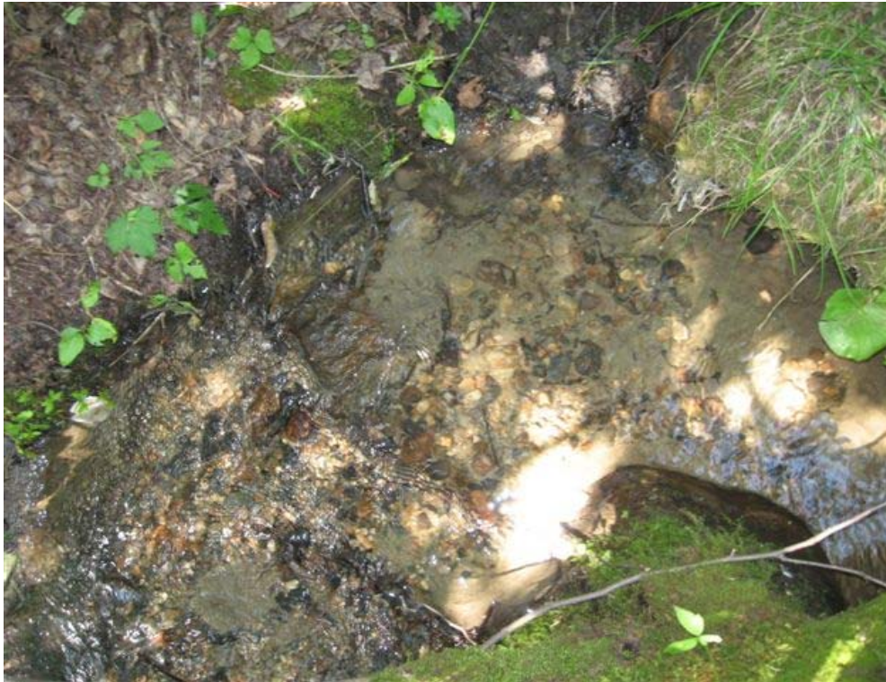
Photo 82. FALC Ravine representative of HS4.