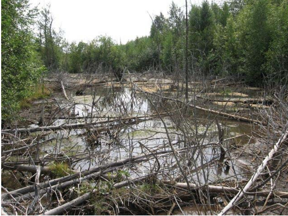
Photo 37. West Ravine within the Star Pit representative of HS10.