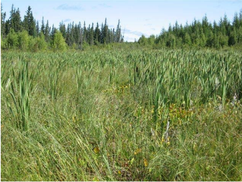
Photo 15. 101 Ravine within the Overburden Pile representative of HS5.