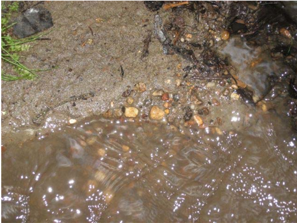
Photo 87. FALC Ravine representative of HS14.