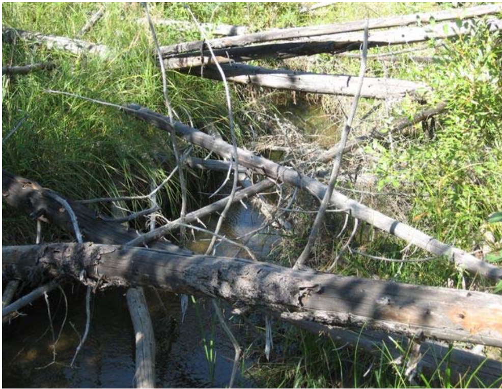
Photo 54. East Ravine within the Star Pit representative of HS11.