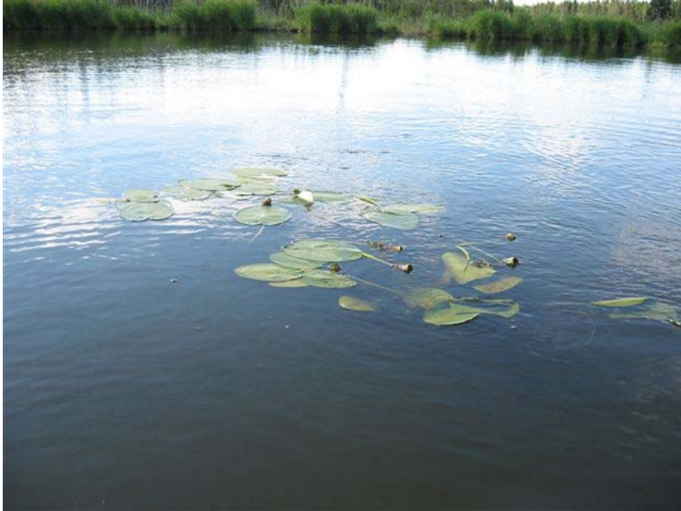
Photo 13. 101 Ravine within the Overburden Pile representative of HS1.