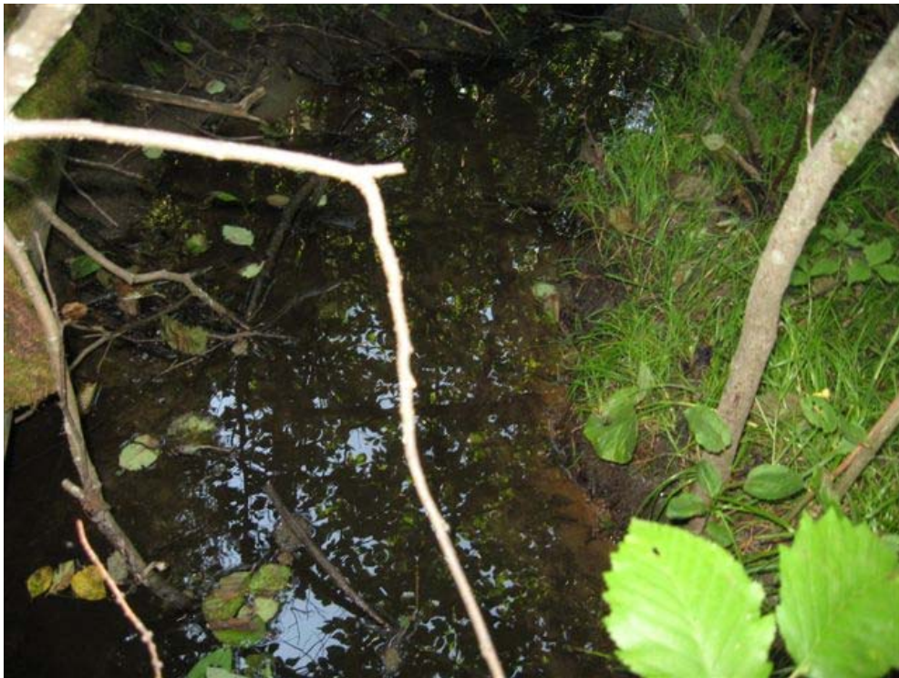
Photo 76. Duke Ravine within the PKCF representative of HS5.