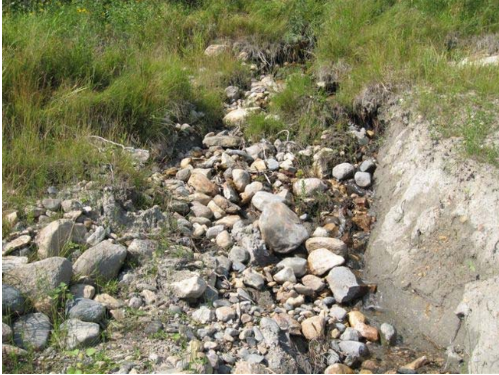
Photo 81. FALC Ravine representative of HS2.