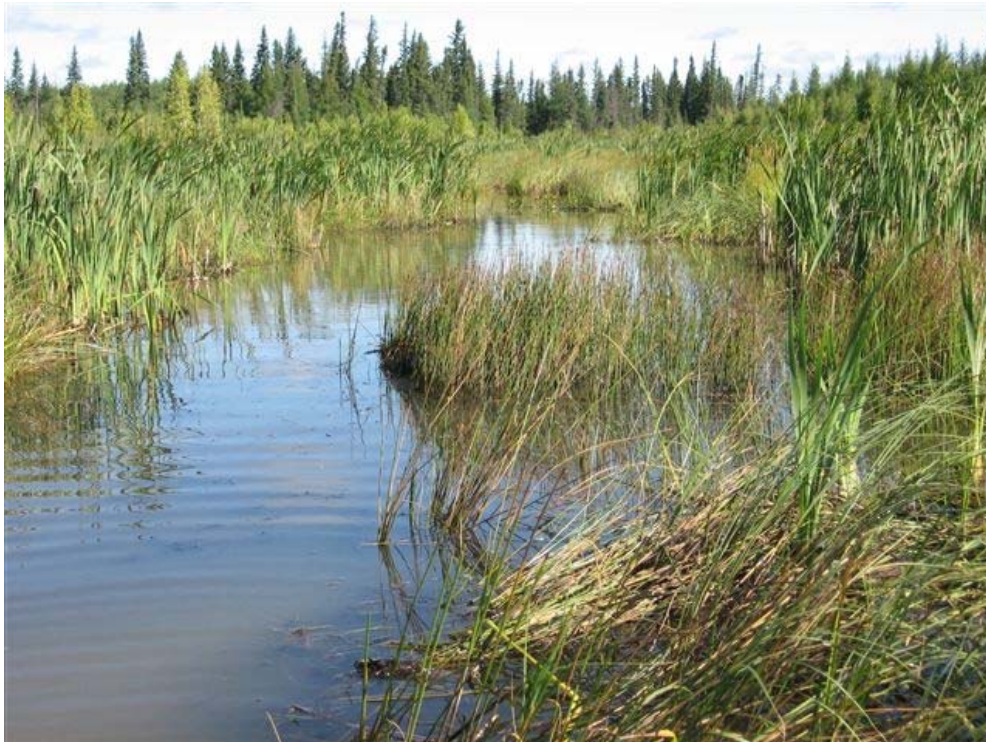
Photo 14. 101 Ravine within the Overburden Pile representative of HS4.