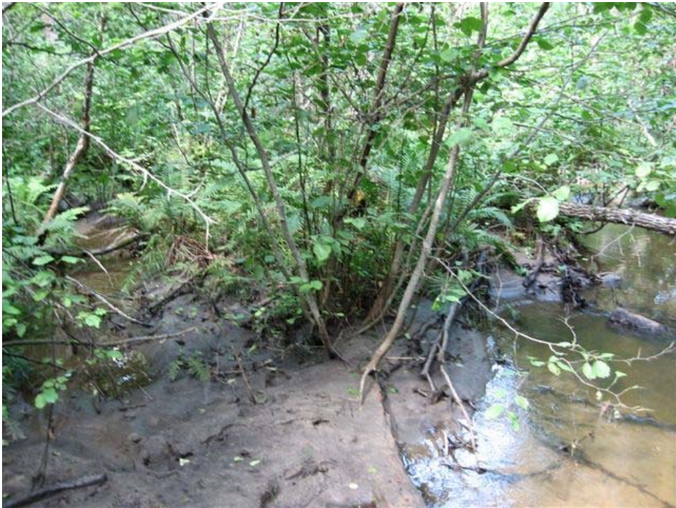
Photo 12. 101 Ravine representative of HS7.