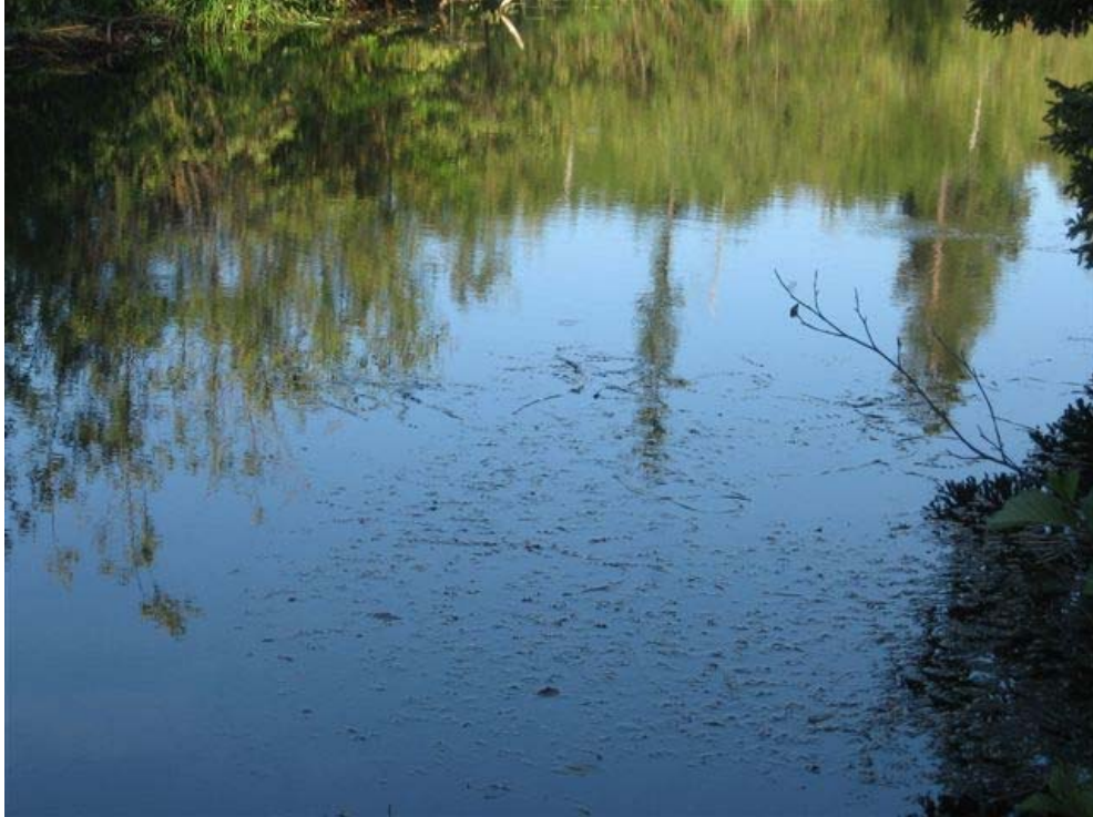
Photo 65. Upper Reaches of East Ravine representative of HS17.