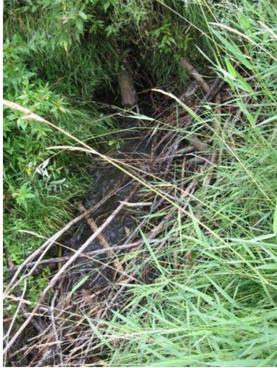
Photo 43. East Ravine representative of HS3.