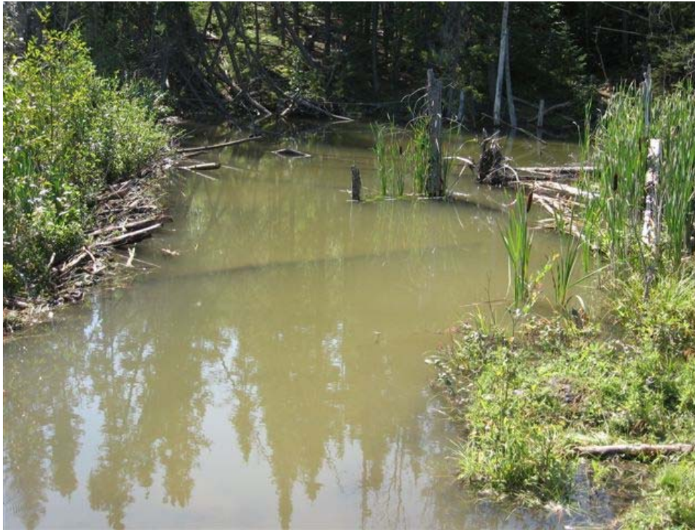
Photo 52. East Ravine within the Star Pit representative of HS5.