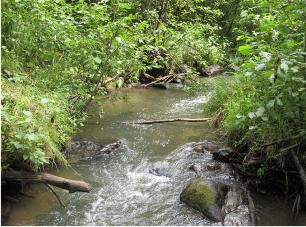
Photo 5. Caution Creek representative of HS5.