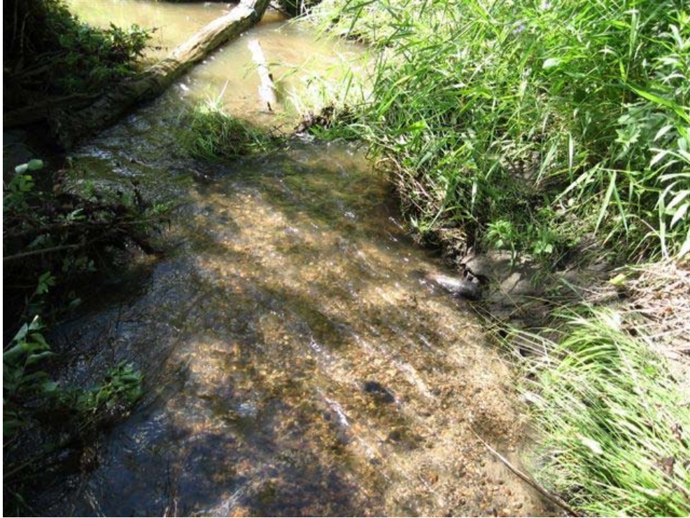
Photo 9. 101 Ravine representative of HS2.