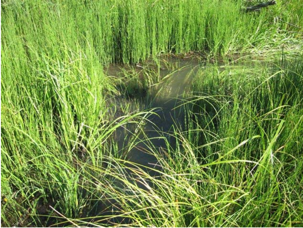
Photo 55. East Ravine within the Star Pit representative of HS14.