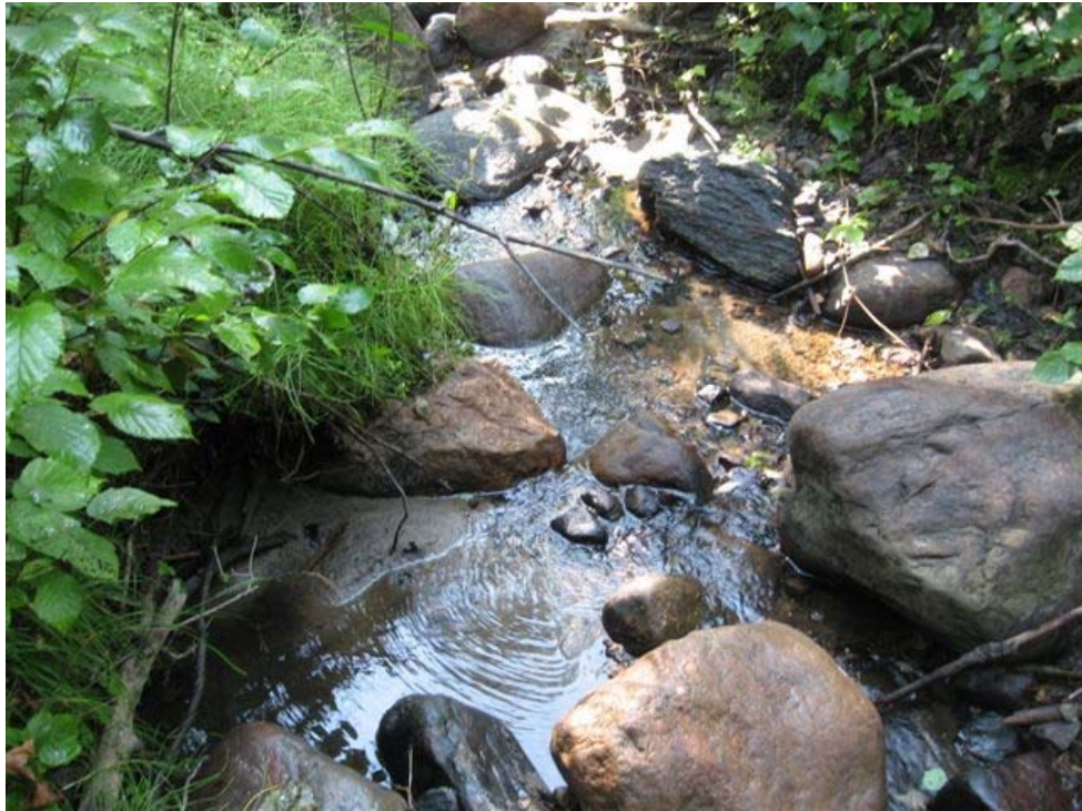
Photo 90. Wapiti Ravine representative of HS3.