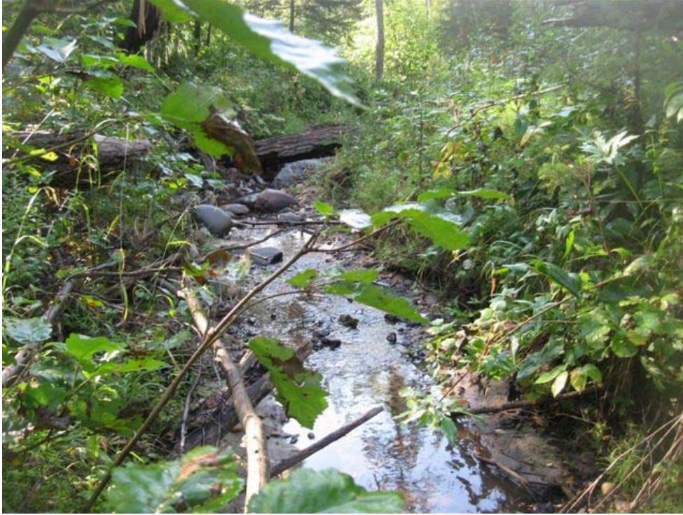
Photo 89. Wapiti Ravine representative of HS1.