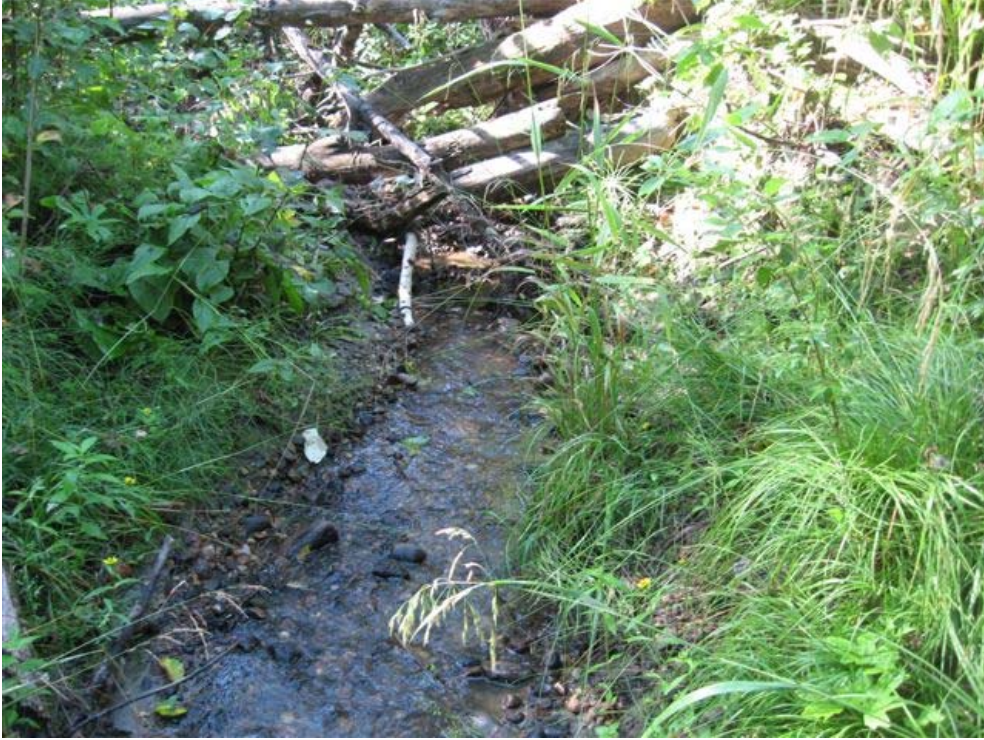
Photo 91. Wapiti Ravine representative of HS5.