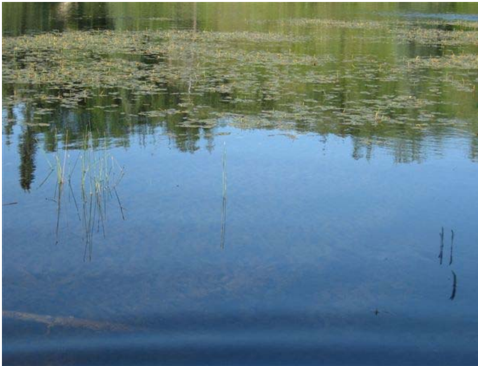
Photo 66. Upper Reaches of East Ravine representative of HS19.