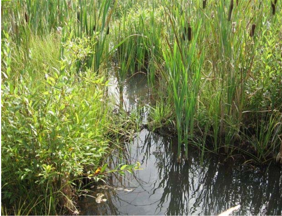
Photo 61. Upper Reaches of East Ravine representative of HS4.