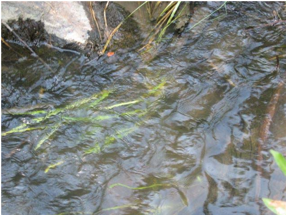
Photo 58. East Ravine within the Star Pit representative of HS21.