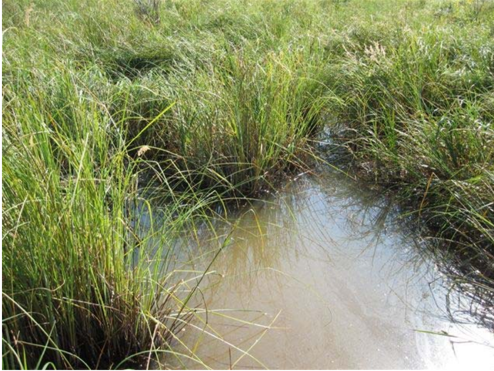
Photo 19. 101 Ravine within the Overburden Pile representative of HS15.