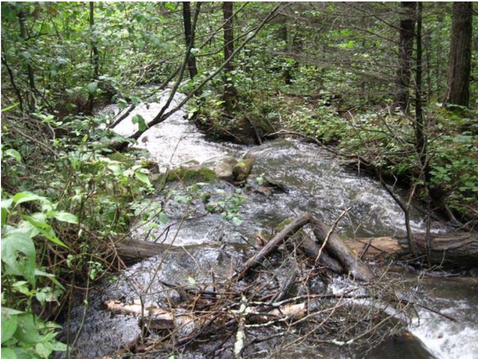
Photo 46. East Ravine representative of HS6.