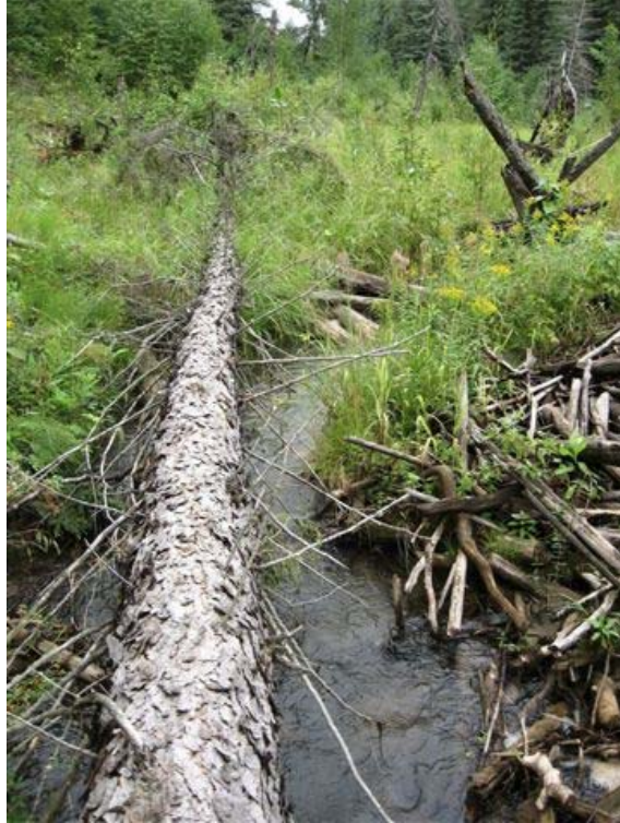
Photo 49. East Ravine representative of HS9.