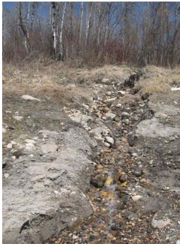
Photo 88. Mouth of Wapiti Ravine, May 2008.