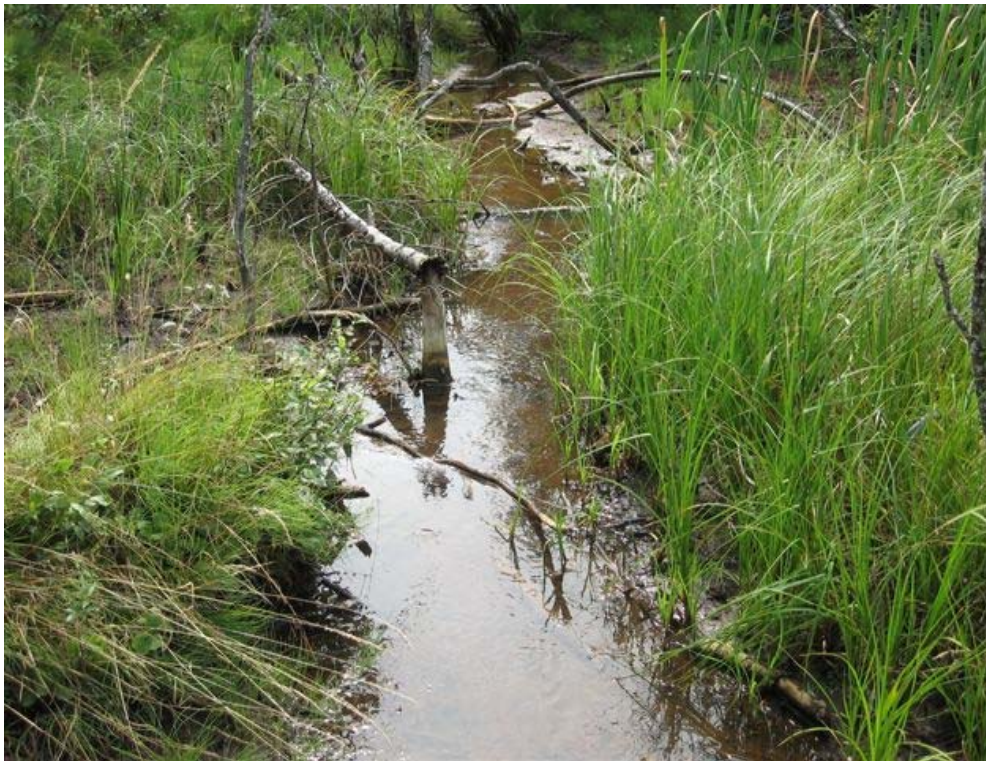
Photo 36. West Ravine within the Star Pit representative of HS9.