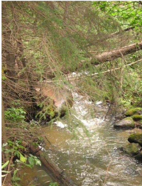
Photo 4. Caution Creek representative of HS3.