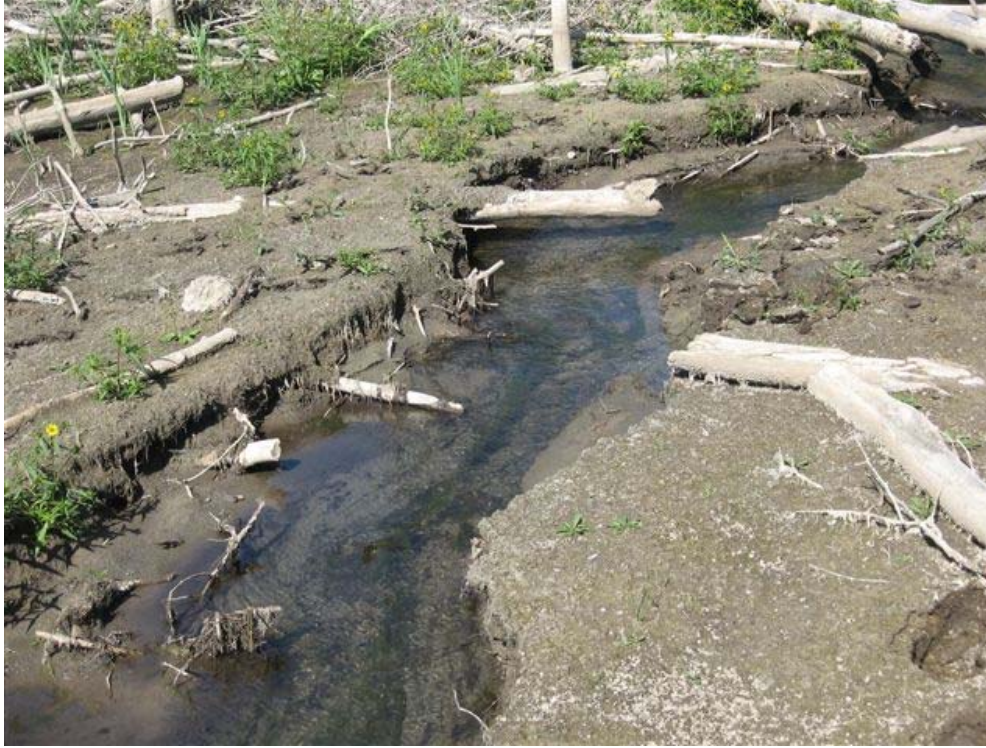
Photo 51. East Ravine within the Star Pit representative of HS3.