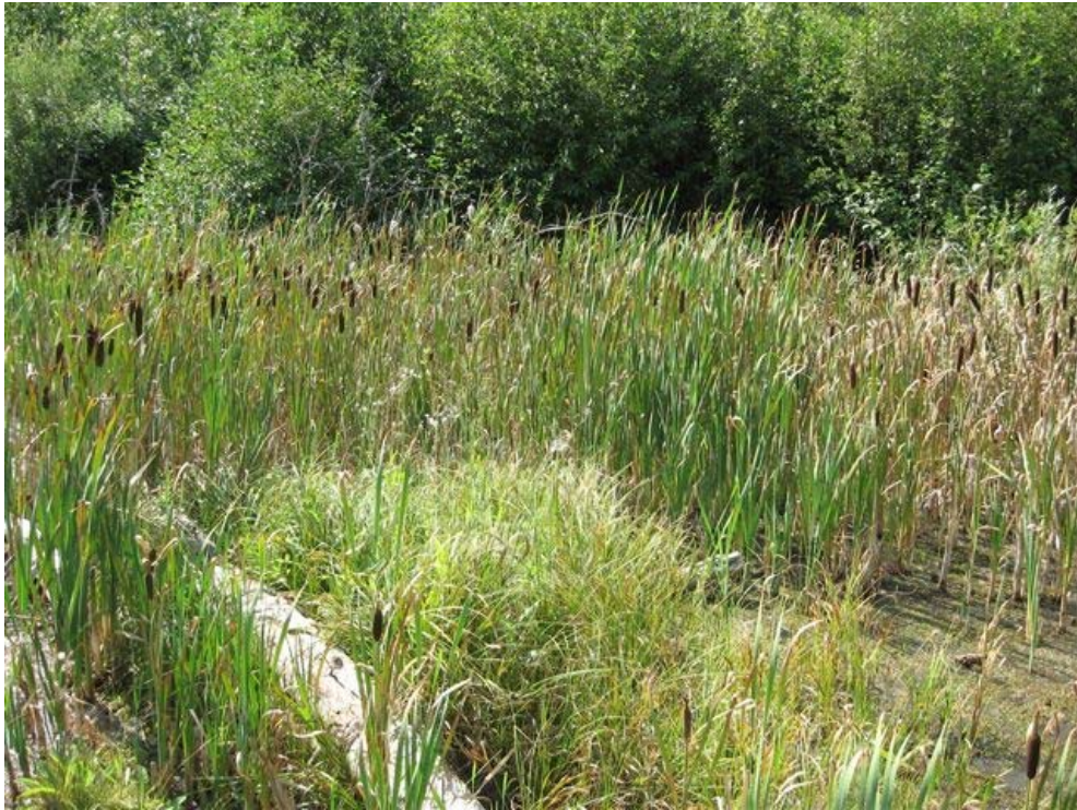
Photo 38. West Ravine within the Star Pit representative of HS12.