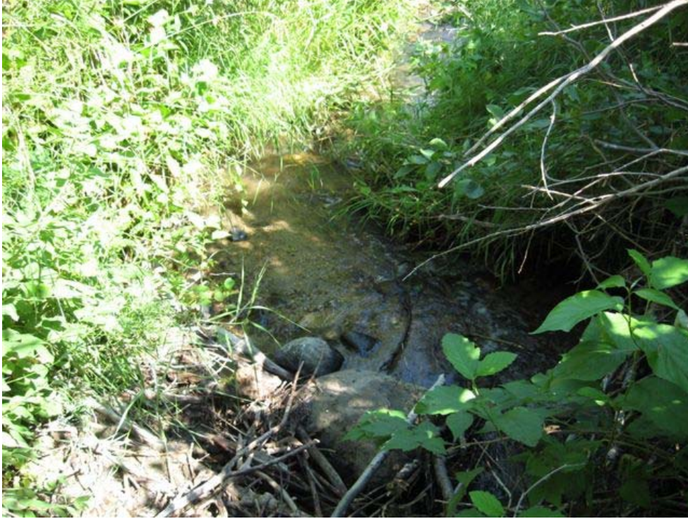
Photo 71. Duke Ravine representative of HS8.