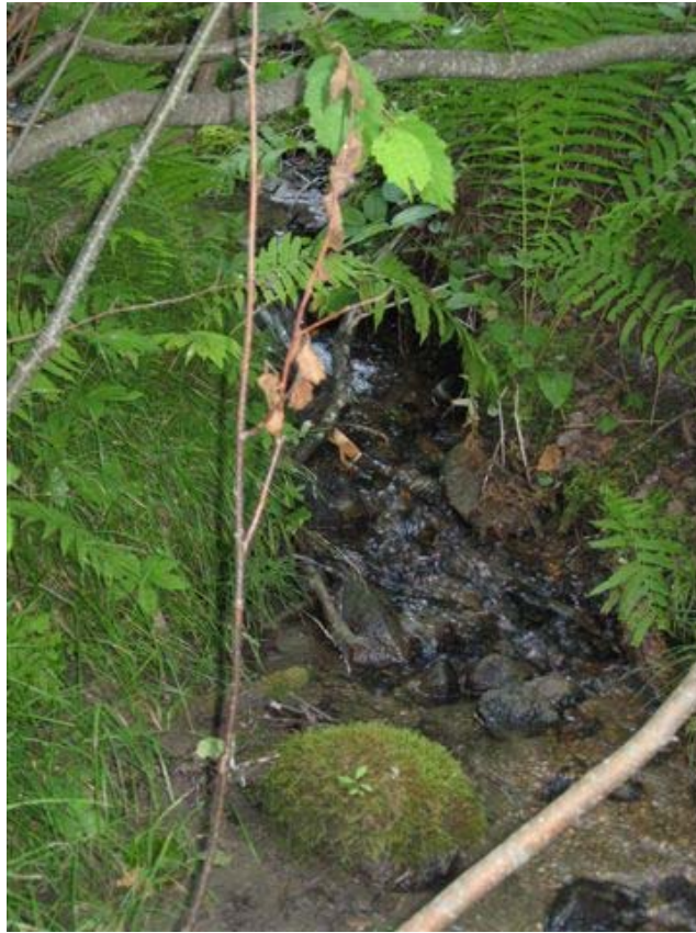
Photo 85. FALC Ravine representative of HS9.