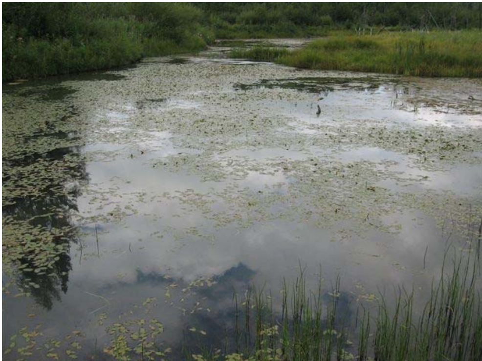
Photo 64. Upper Reaches of East Ravine representative of HS14.