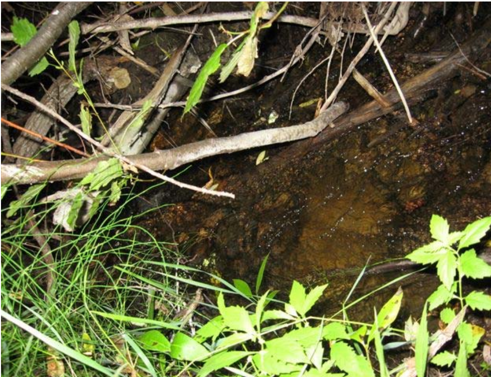
Photo 28. West Ravine representative of HS5.