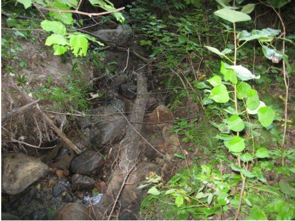
Photo 93. Wapiti Ravine representative of HS9.