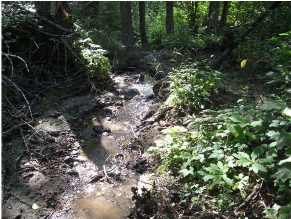
Photo 92. Wapiti Ravine representative of HS7.