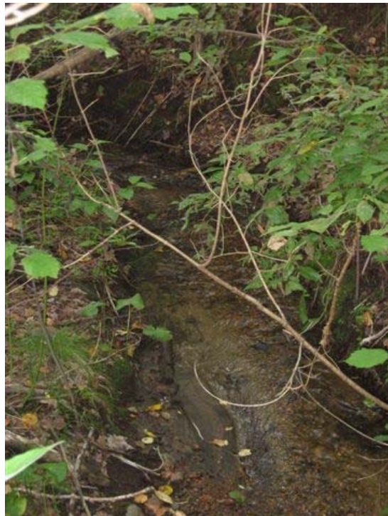
Photo 32. West Ravine representative of HS9.