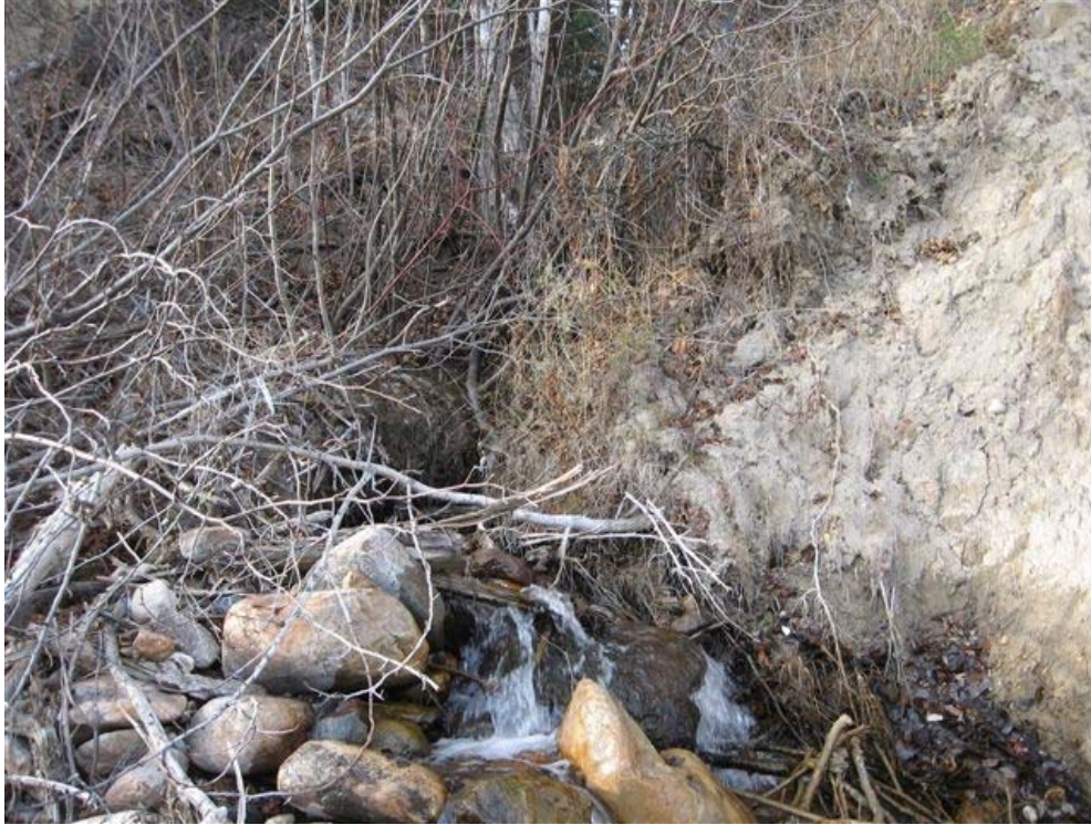
Photo 21. West Perimeter Ravine representative of HS1.