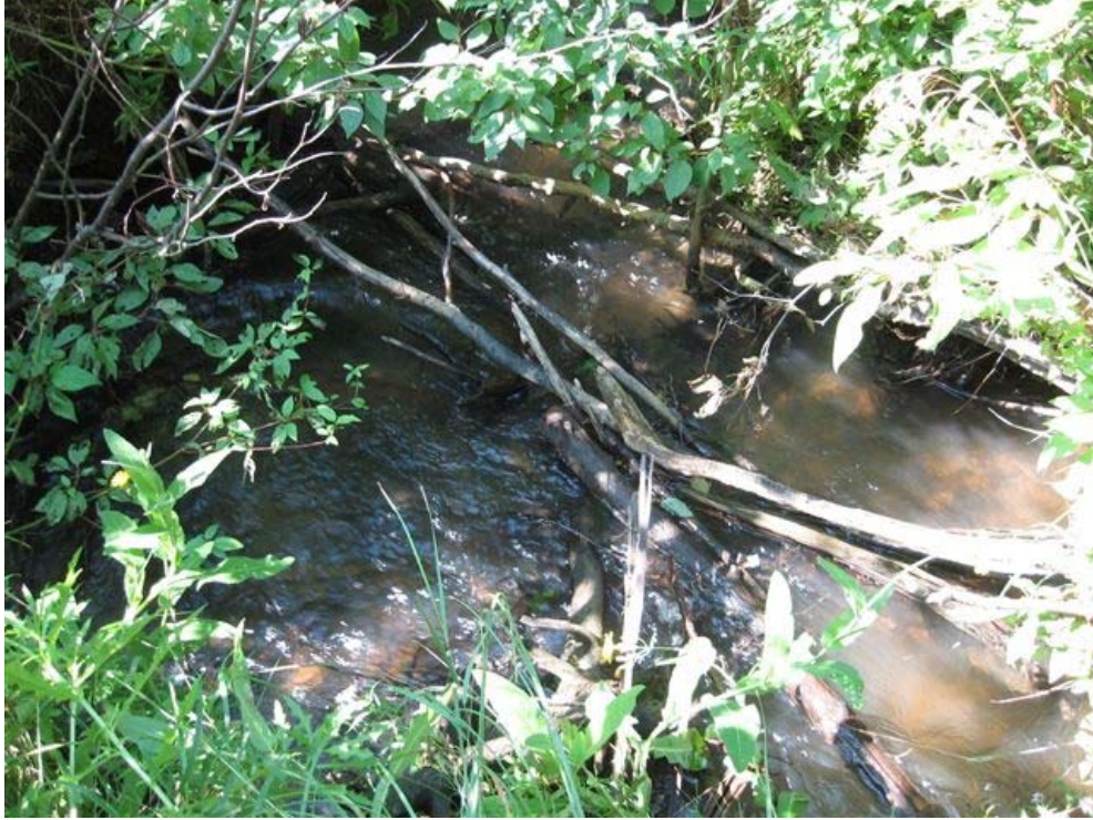
Photo 57. East Ravine within the Star Pit representative of HS19.