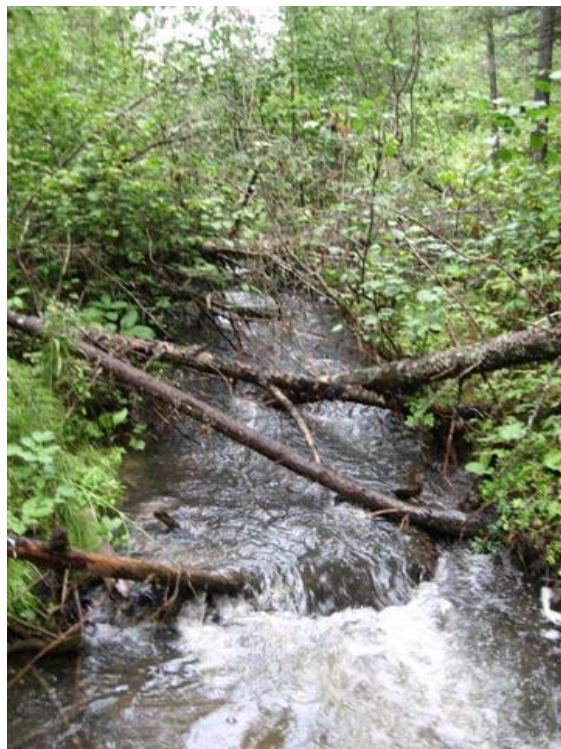
Photo 48. East Ravine representative of HS8.