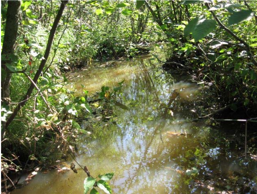
Photo 16. 101 Ravine within the Overburden Pile representative of HS7.