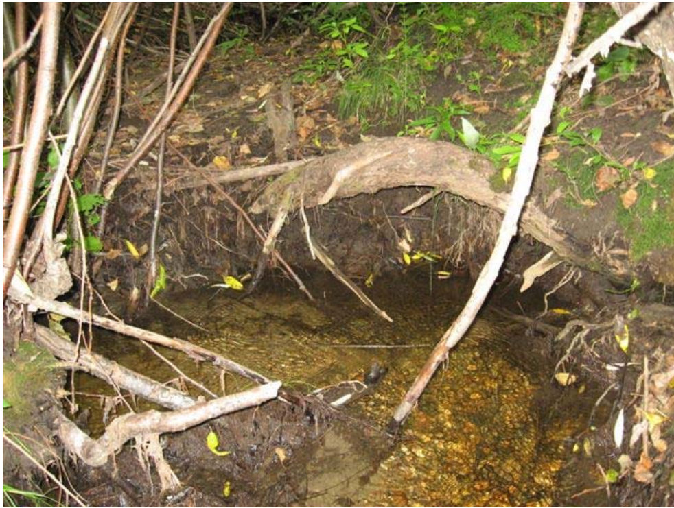
Photo 30. West Ravine representative of HS7.