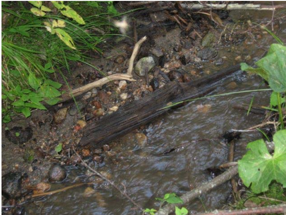
Photo 86. FALC Ravine representative of HS11.