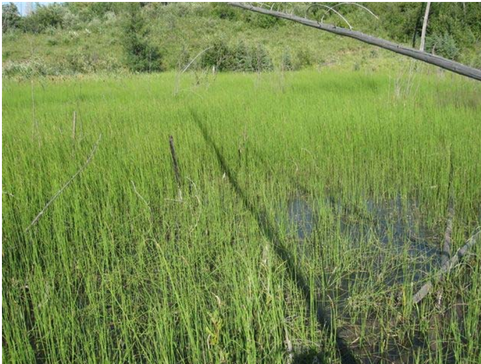
Photo 56. East Ravine within the Star Pit representative of HS17.