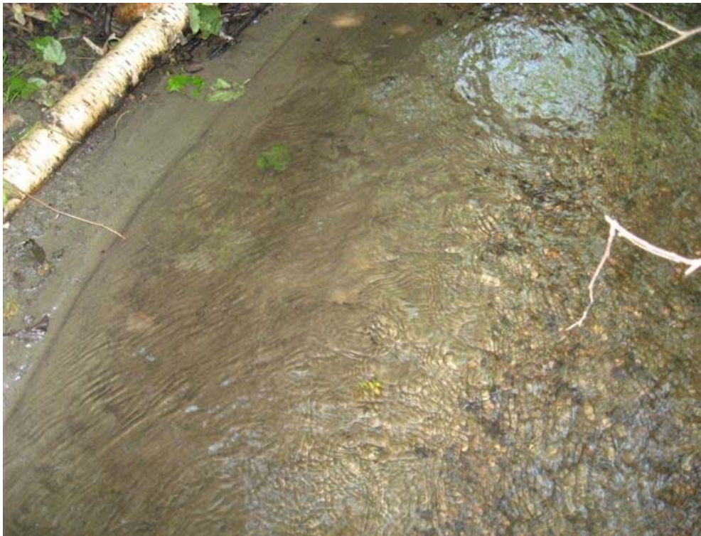
Photo 70. Duke Ravine representative of HS6.