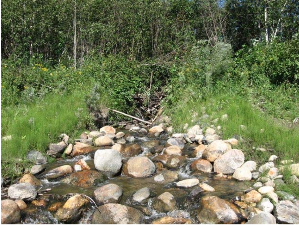
Photo 7. Mouth of 101 Ravine.