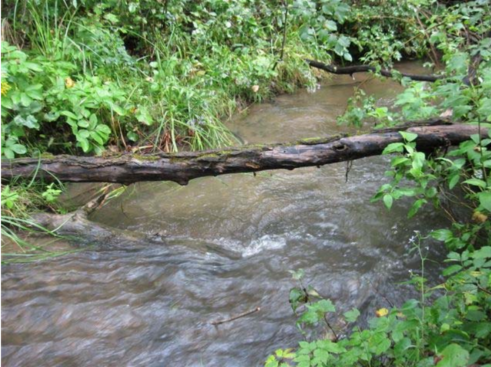
Photo 45. East Ravine representative of HS5.