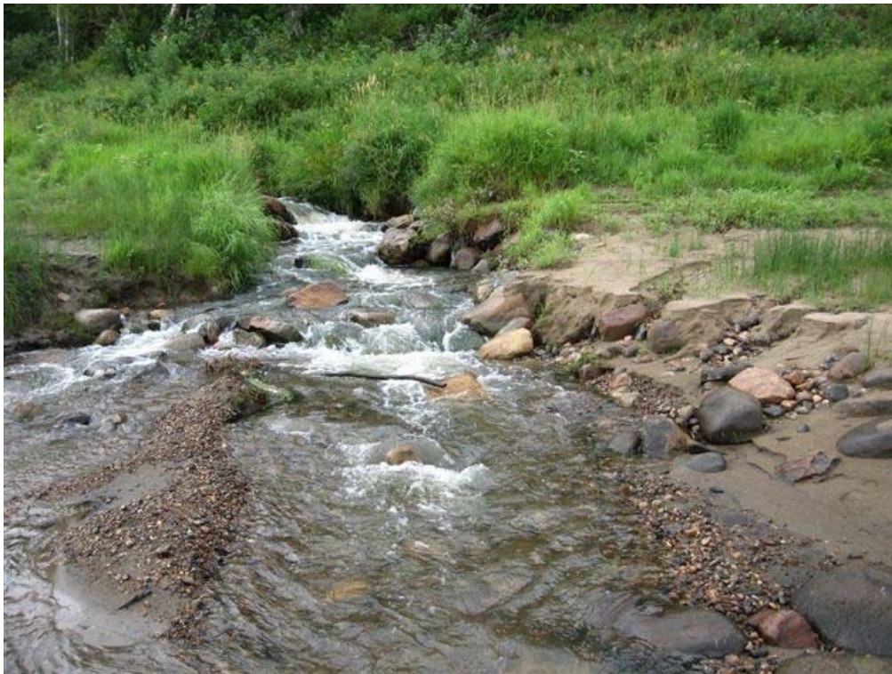
Photo 2. Mouth of Caution Creek.