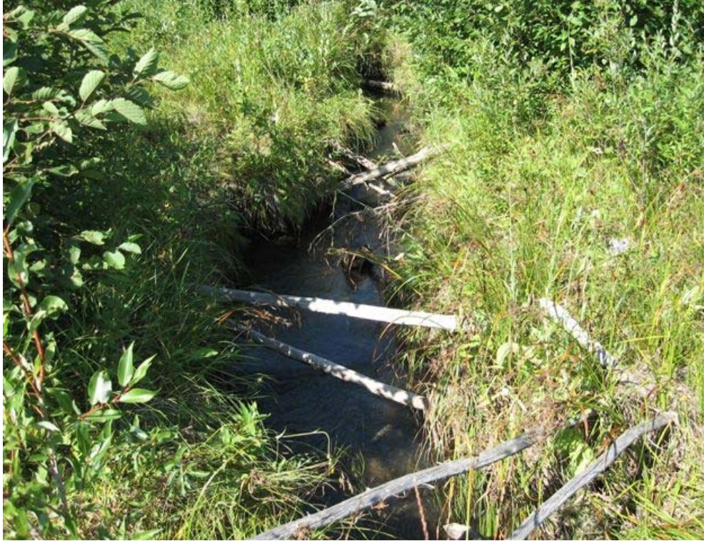
Photo 53. East Ravine within the Star Pit representative of HS8.