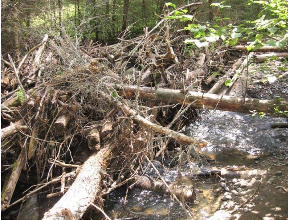
Photo 99. English Creek representative of HS8.