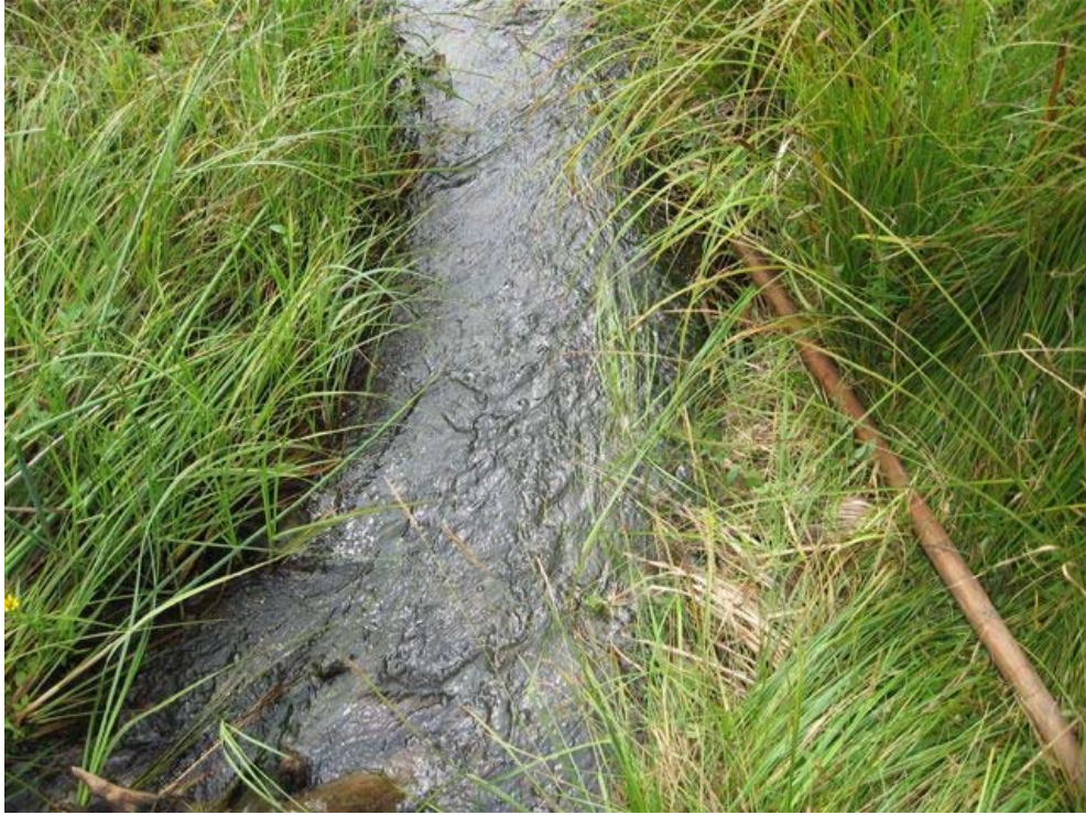
Photo 63. Upper Reaches of East Ravine representative of HS11.