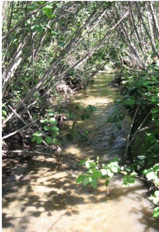
Photo 10. 101 Ravine representative of HS4.