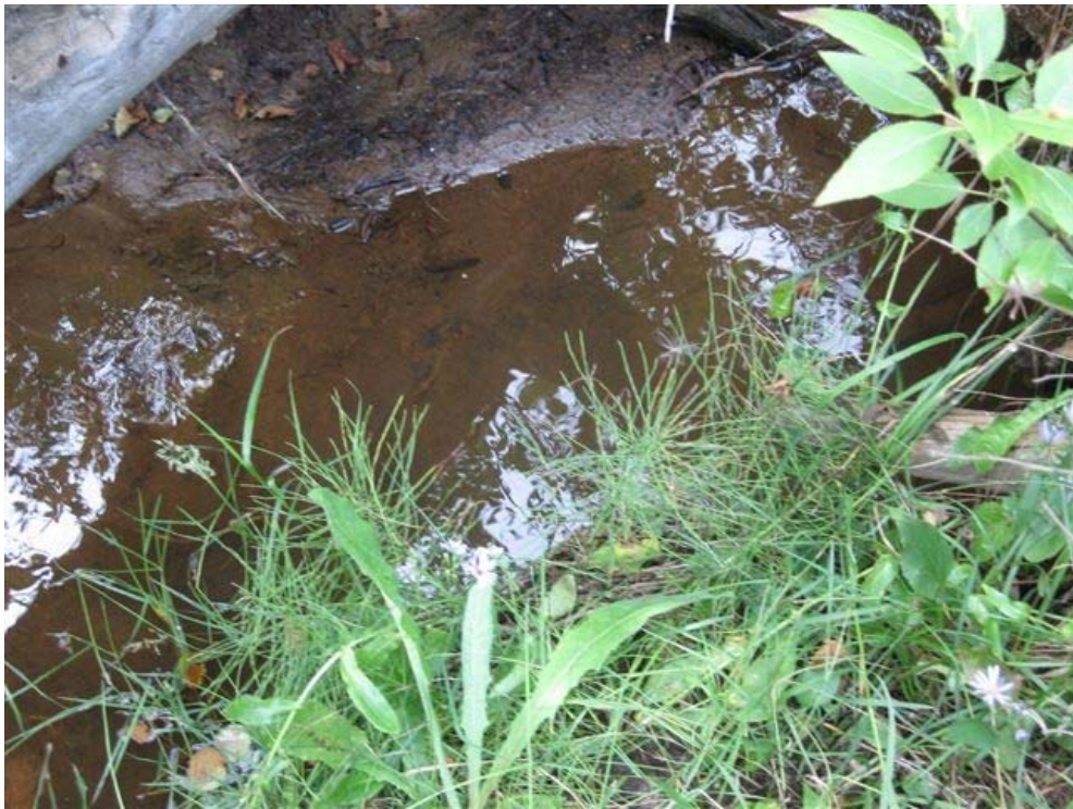
Photo 34. West Ravine within the Star Pit representative of HS3.