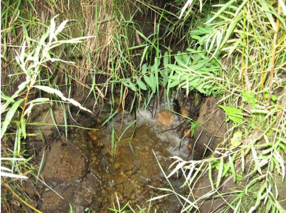
Photo 27. West Ravine representative of HS2.