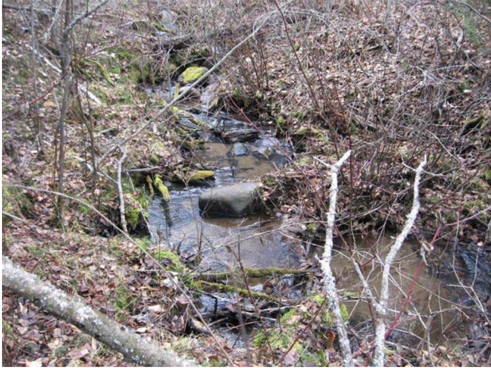
Photo 23. West Perimeter Ravine representative of HS4.