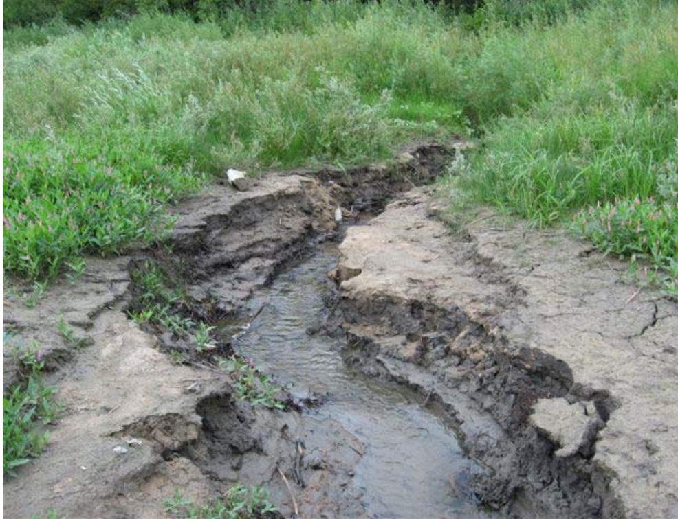
Photo 25. Mouth of West Ravine.