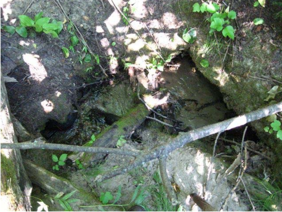
Photo 83. FALC Ravine representative of HS5.