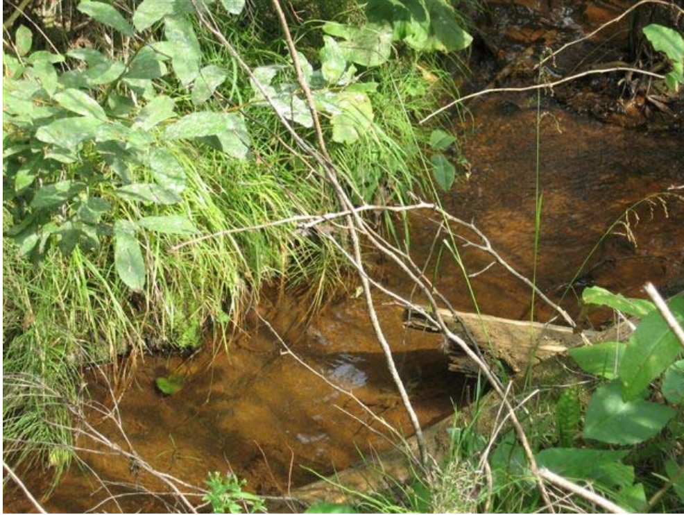
Photo 33. West Ravine within the Star PitStar Pit representative of HS1.