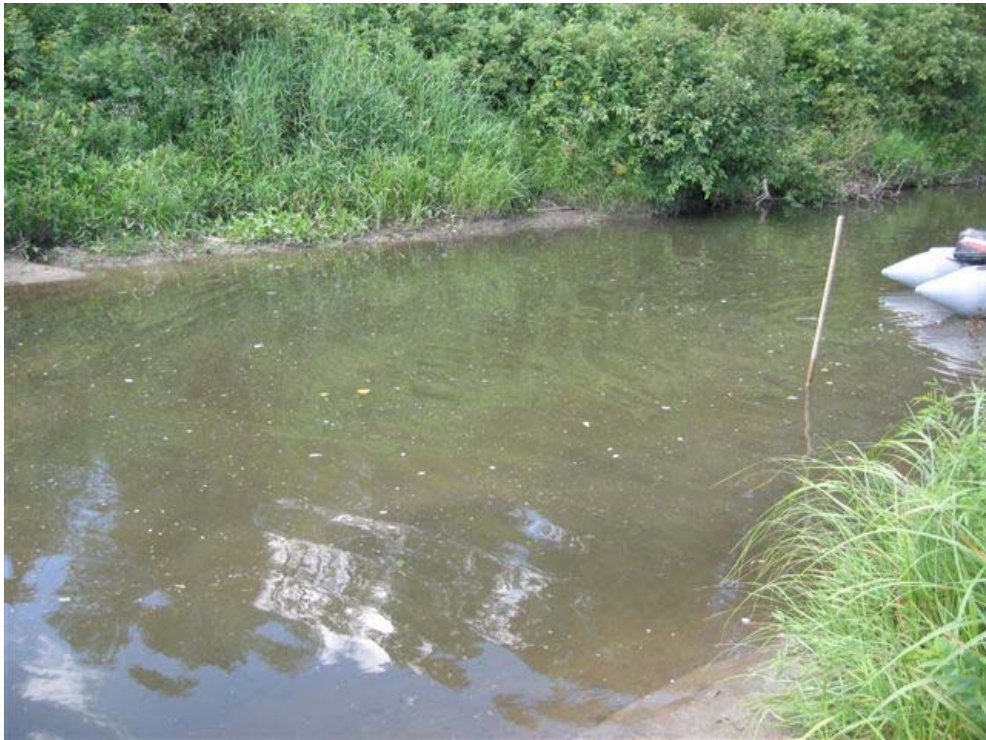
Photo 96. English Creek representative of HS1.