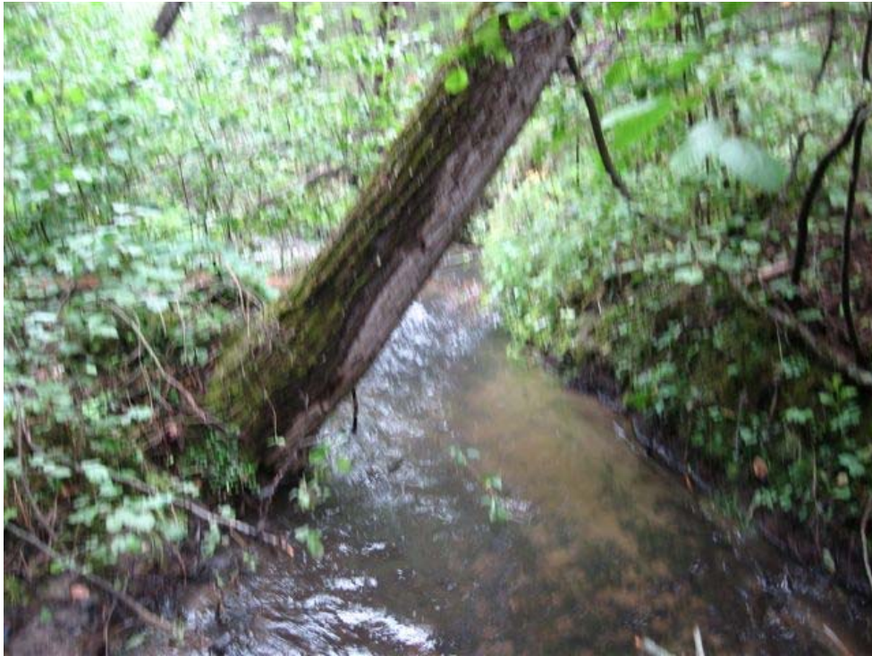
Photo 47. East Ravine representative of HS7.