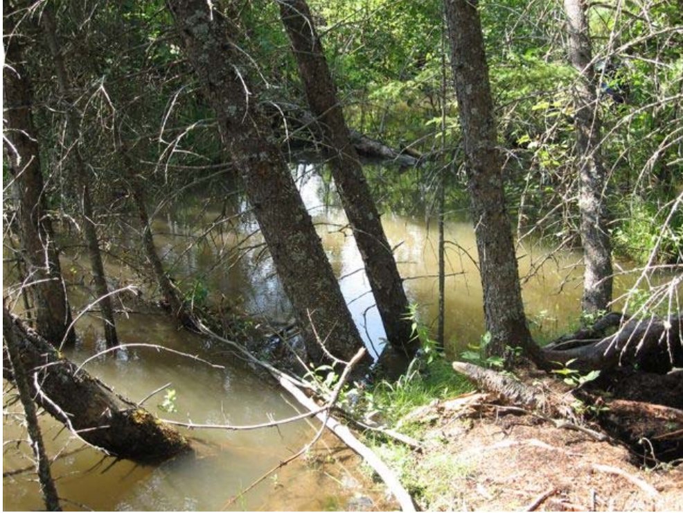
Photo 59. East Ravine within the Star Pit representative of HS24.