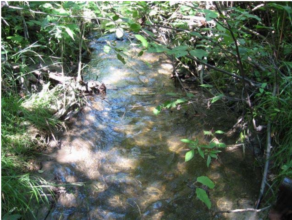
Photo 68. Duke Ravine representative of HS1.