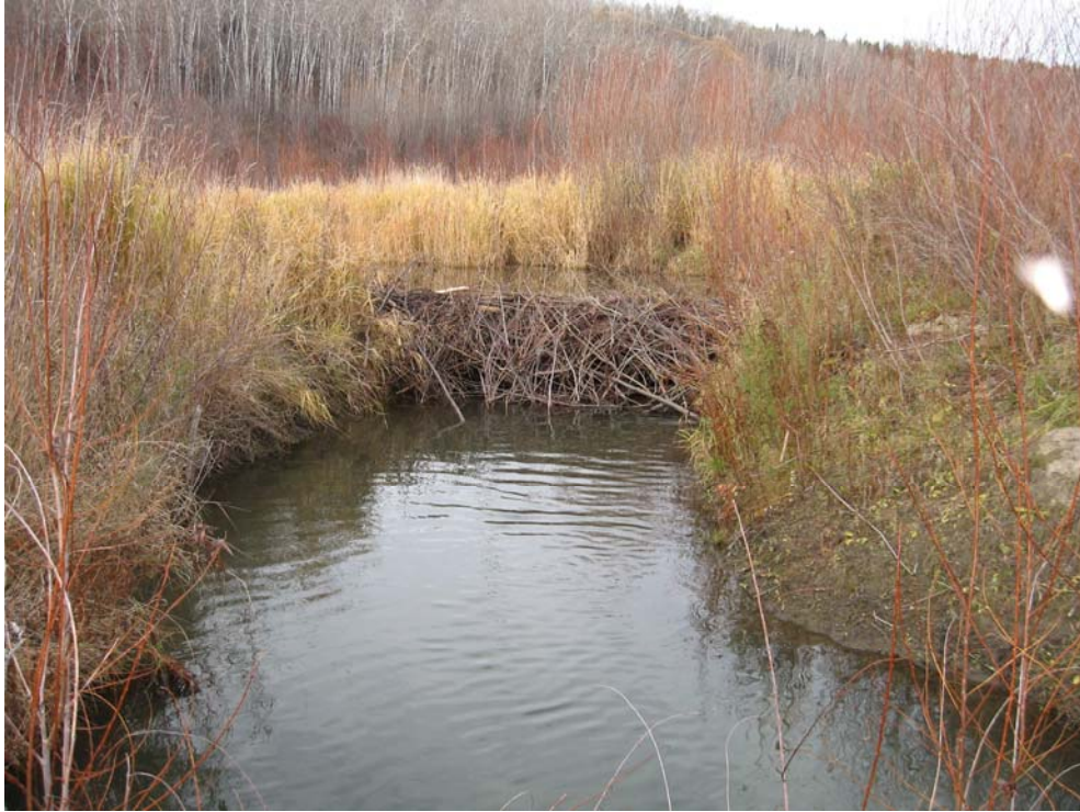
Photo 41. Mouth of East Ravine in October 2007.