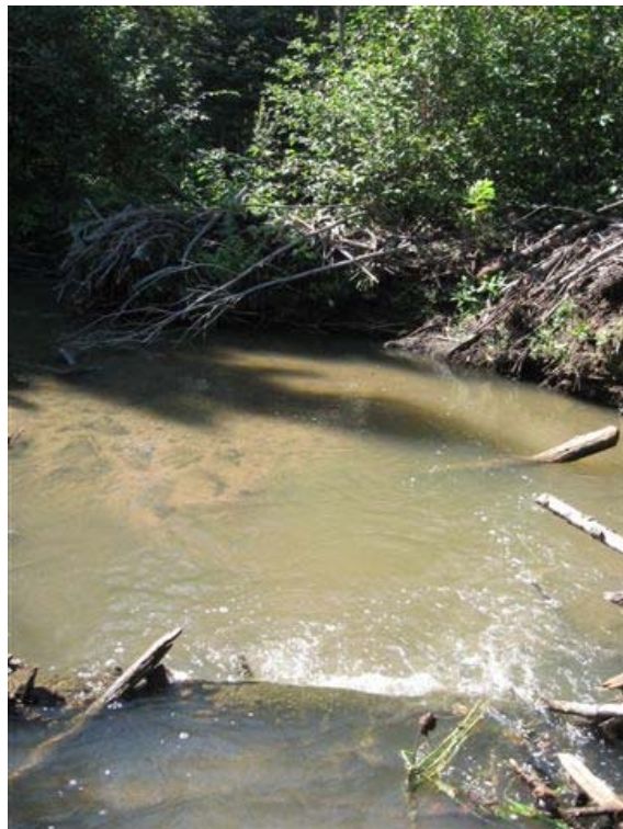
Photo 6. Caution Creek representative of HS6.