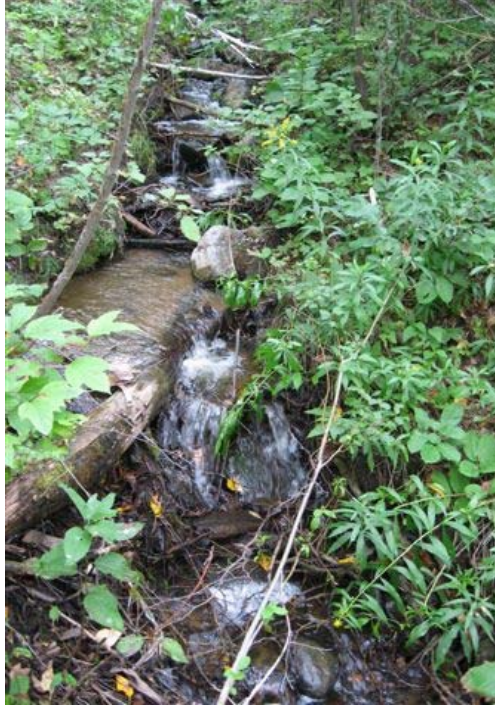
Photo 29. West Ravine representative of HS6.