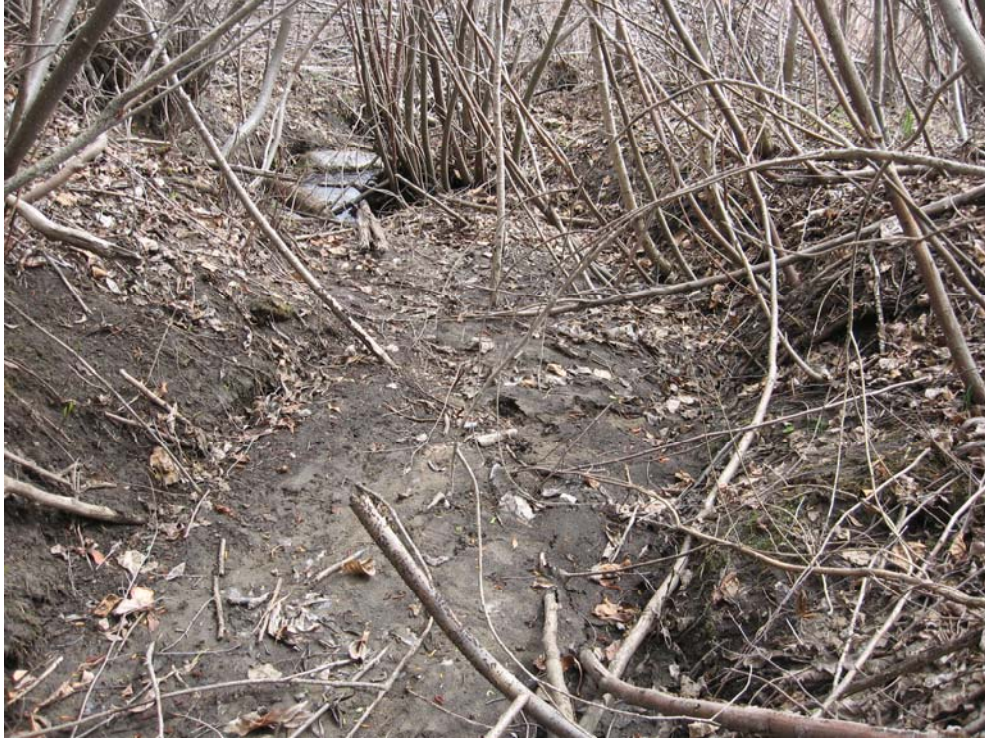
Photo 31. West Ravine representative of HS7, subsurface flow.