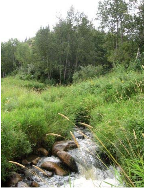
Photo 3. Caution Creek representative of HS1.