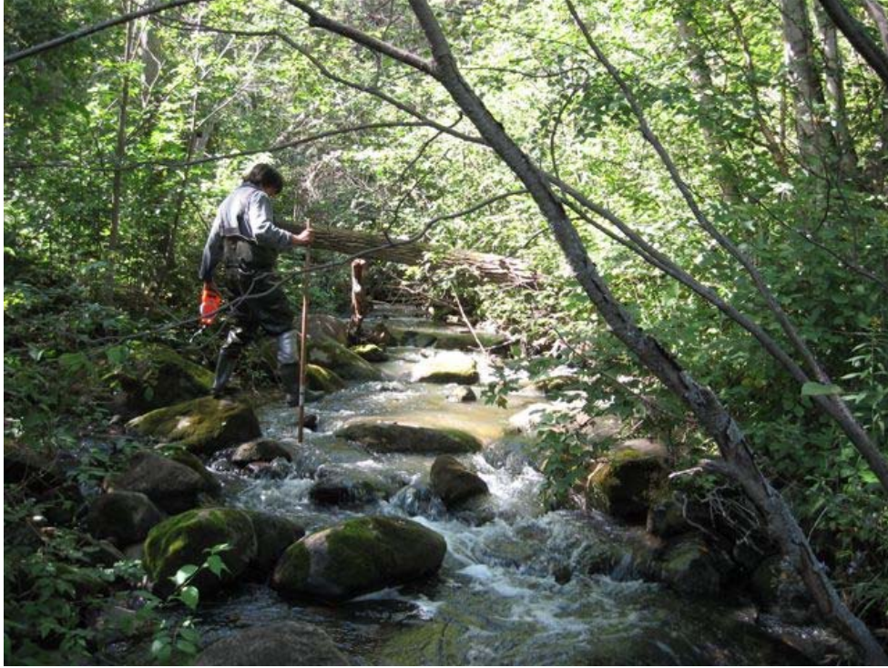
Photo 97. English Creek representative of HS3.