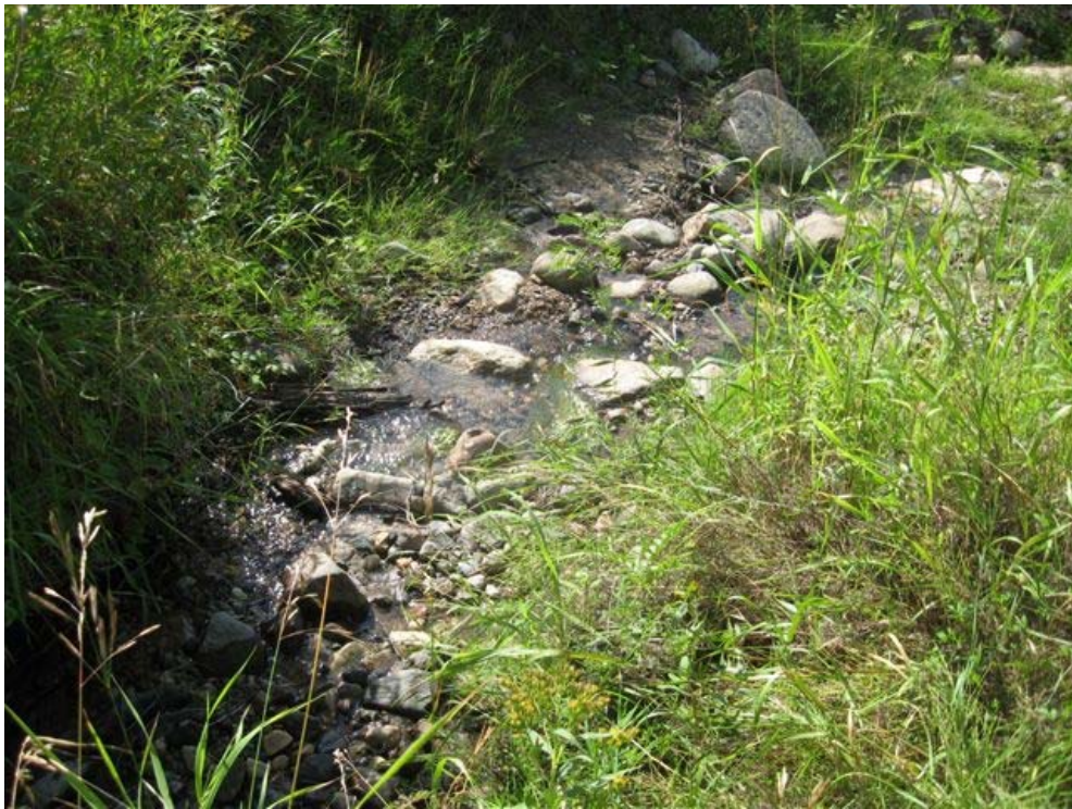
Photo 94. Wapiti Ravine representative of HS12.