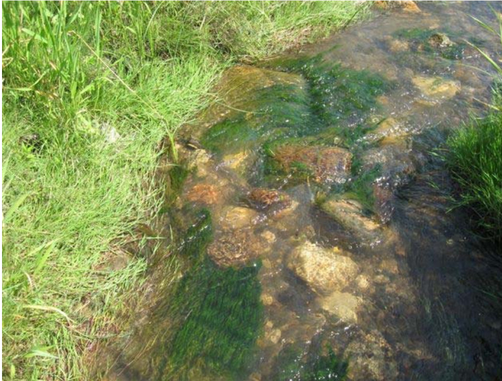
Photo 72. Duke Ravine representative of HS10.