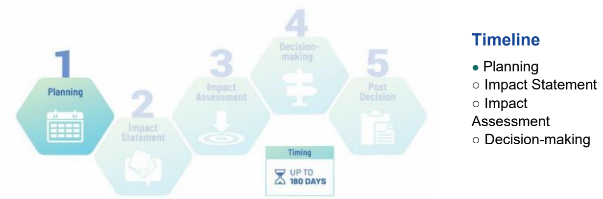
Figure 2: Planning phase within the impact assessment process

The Planning phase for the impact assessment of the project was completed on August 18, 2025. This phase is the first of five phases in the federal impact assessment process under the Impact Assessment Act (Figure 2). The Planning phase was used to identify key issues related to the project, decide whether an impact assessment was required, understand how Indigenous People and the public would like to participate in the impact assessment process, and plan the assessment.