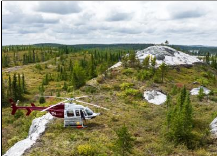
Figure 1: Open pit mining of spodumene pegmatite - Shaakichiuwaanaan

PMET Resources is proposing the construction, operation, decommissioning and closure of a new hybrid open-pit and underground lithium mine located about 250 kilometers east of Radisson, Quebec (Figure 1). As proposed, the Shaakichiuwaanaan Mining Project would include an ore processing plant, a water treatment plant, a workers' camp, and storage areas for waste rock, tailings and ore. The mine would produce 49,500 tonnes of ore per day over a mine-life of about 24 years.