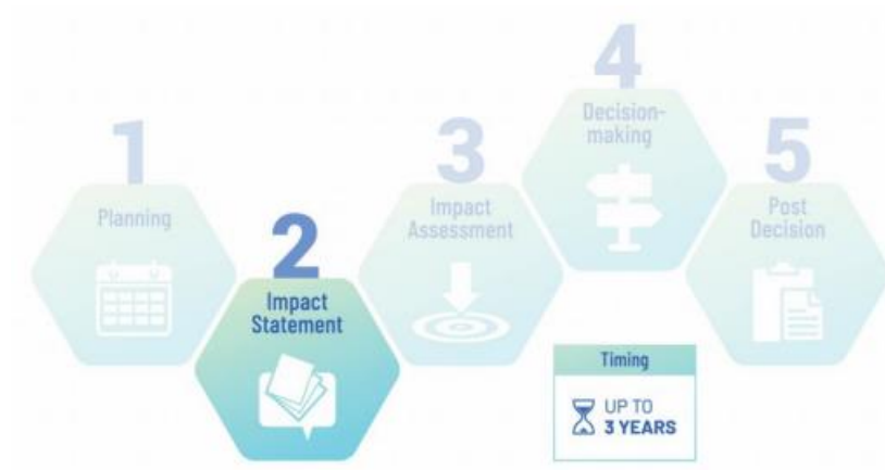
Figure 3: Impact Statement phase within the impact assessment process

On August 18, 2025, the Committee issued a Notice of Commencement of an Impact Assessment for the project and provided the proponent with the final Tailored Impact Statement Guidelines . The impact assessment of the project then entered the Impact Statement phase (Figure 3), during which the proponent collects information and conducts studies, as described in the Tailored Impact Statement Guidelines, to prepare the Impact Statement.