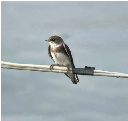
14 Aug 2022