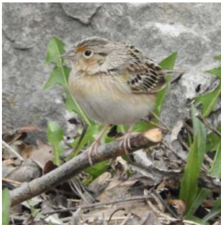
26 April 2022