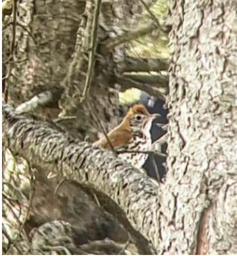
9 May 2022