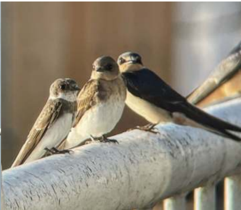
1 Aug 2022