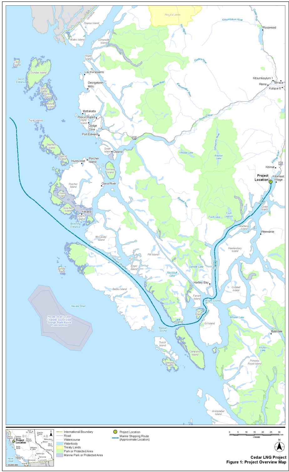
Figure 1 Designated Project Overview Map