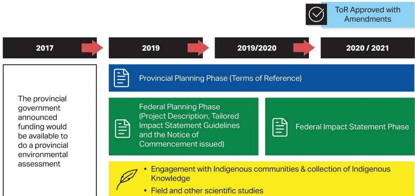
Figure 2-1: Provincial EA / Federal IA Progress to Date