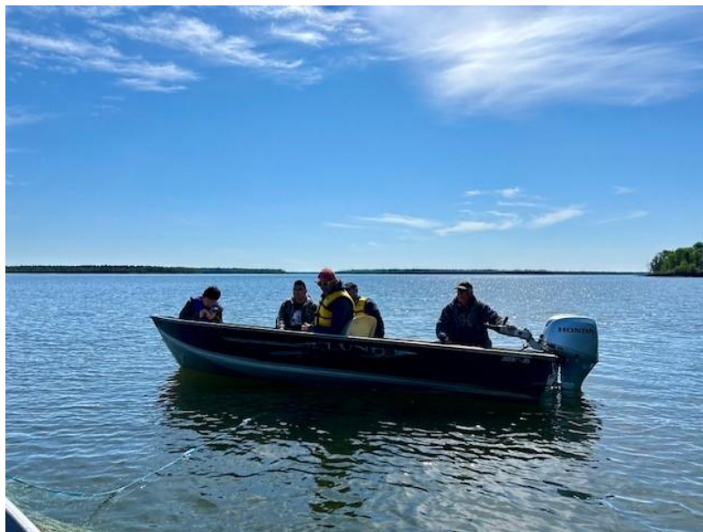
Photo 1: Photo from CNSC's 2024 outreach trip to Pinehouse, Saskatchewan.

Subscribe to the updated Canadian Impact Assessment Registry notifications service to receive updates on the Wheeler River EA process, and any other EA or Impact Assessment Processes that you are interested in. When you subscribe to this notification service, you will receive a email when new content is posted on the Canadian Impact Assessment Registry for the projects you are following. Head over to www.iaac-aeic.gc.ca to sign up!