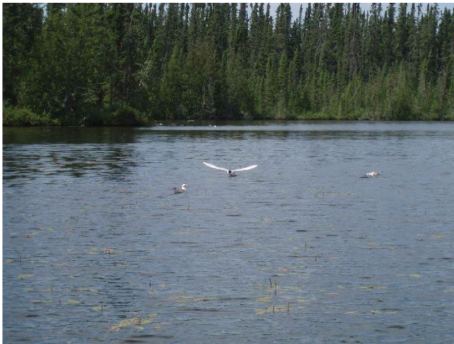
Photograph A-20: Unnamed Lake 3