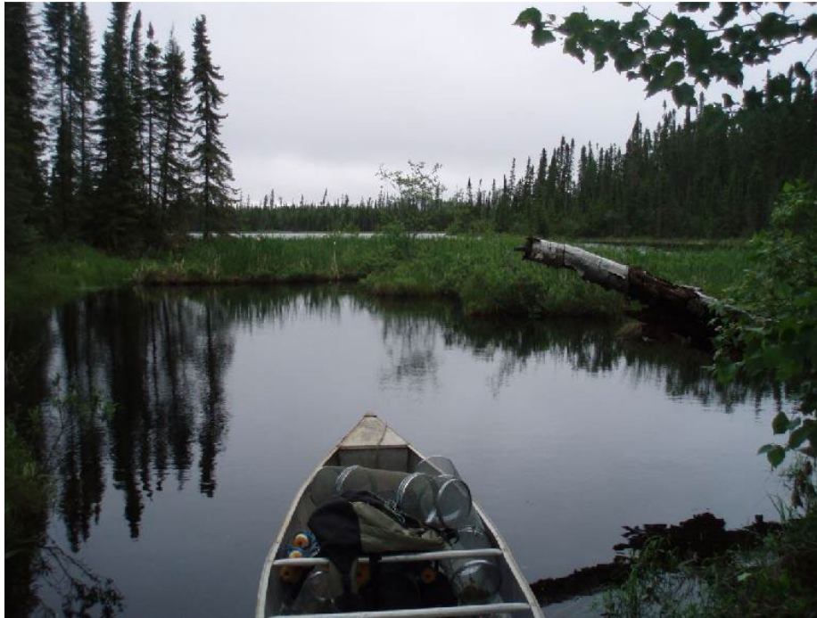
Photograph A-19: Unnamed Lake 2