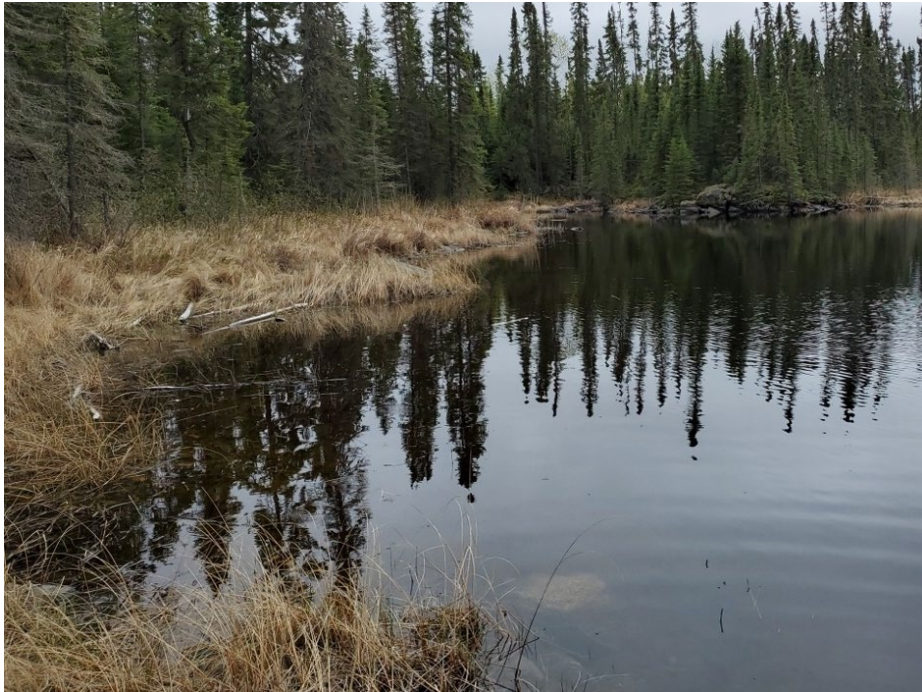
Photograph A-23: Unnamed Lake 16