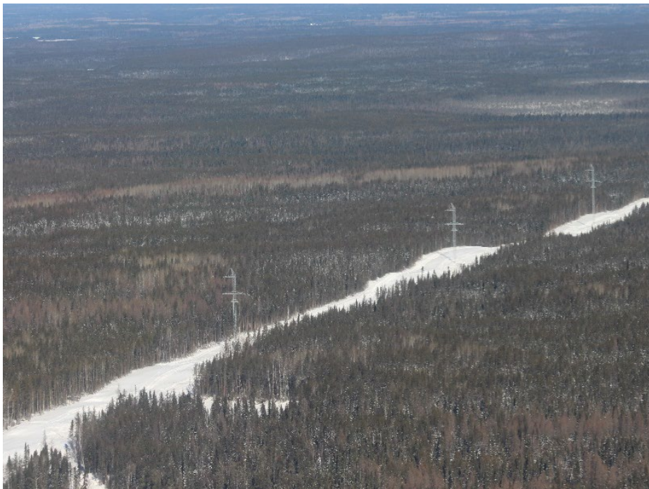
Photograph A-10: Transmission Line west of Slate Falls