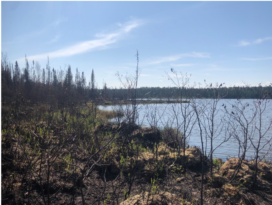
Photograph A-26: Unnamed Lake 19