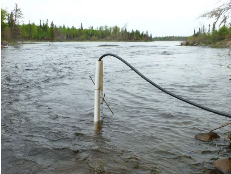
Photograph A-13: Cromarty Lake inlet into Springpole Lake