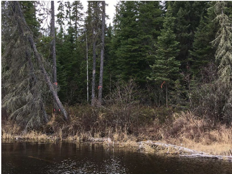
Photograph A-16: Shoreline of Birch Lake, north of the Project site