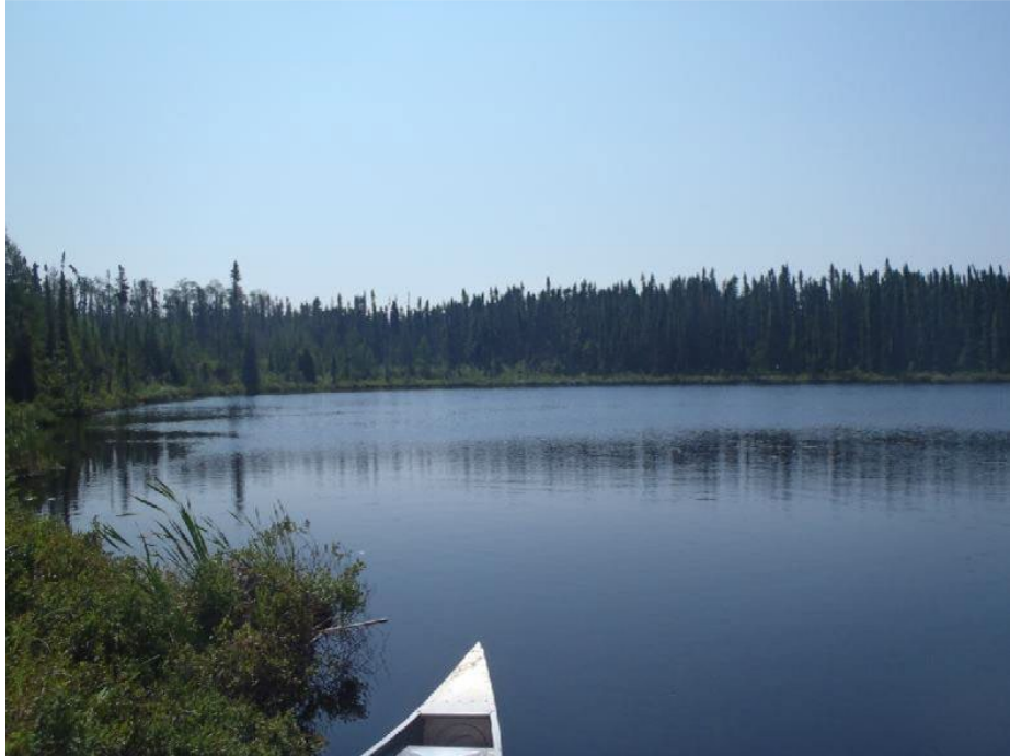
Photograph A-21: Unnamed Lake 4