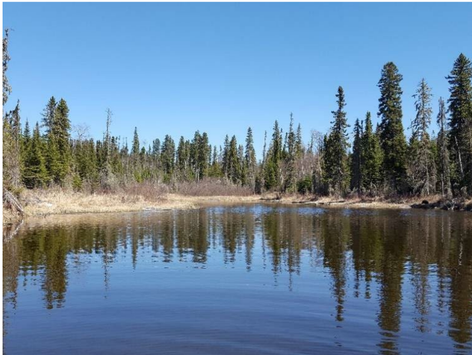
Photograph A-12: Springpole Lake, shoreline of the north basin of (May 2017)