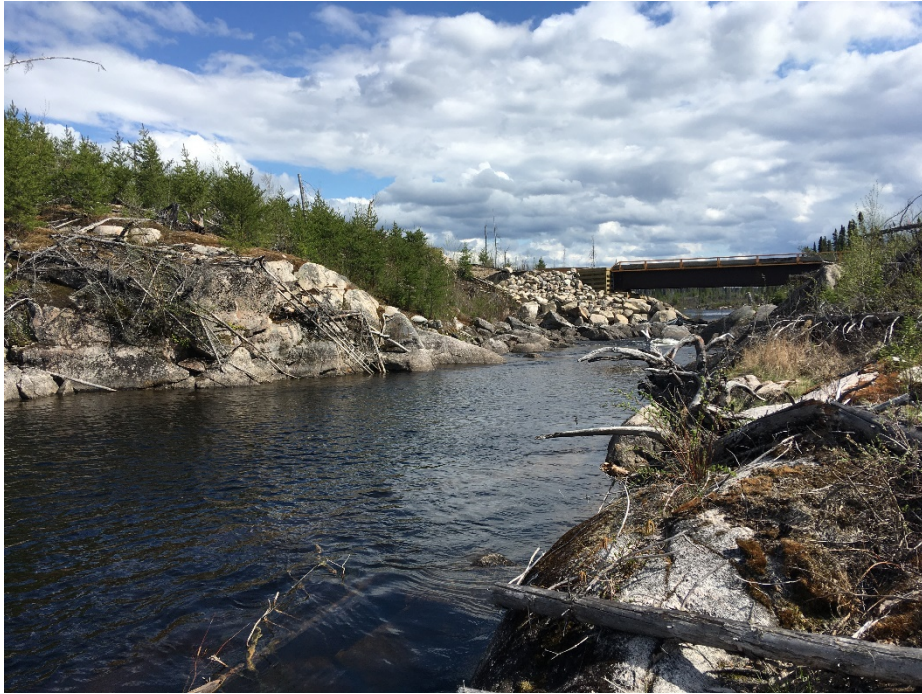
Photograph A-15: Birch River crossing at the Springpole Lake outlet