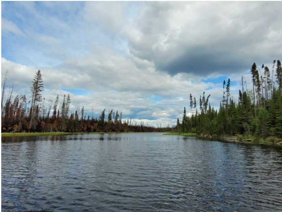
Photograph A-18: Unnamed Lake 1