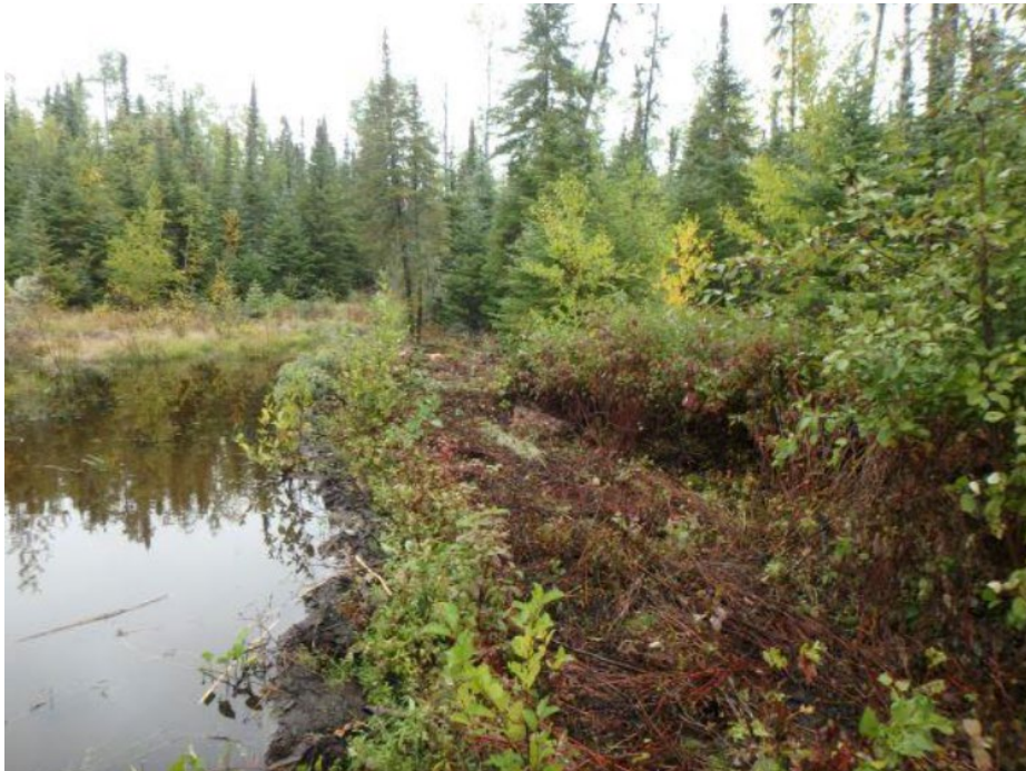
Photograph A-8: Proposed co-disposal facility area (West of Unnamed Lake 5)