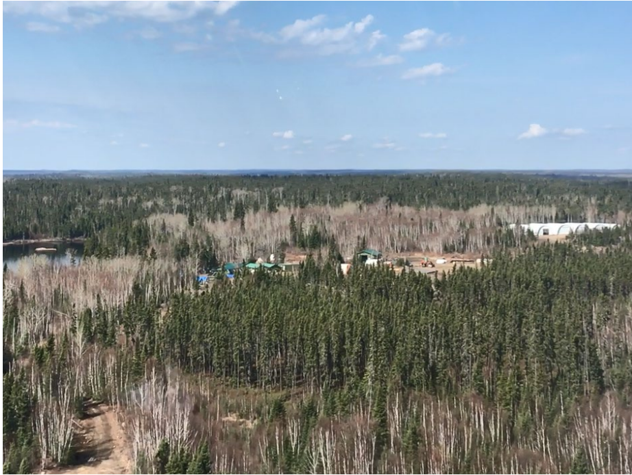
Photograph A-7: Proposed process plant area east of the camp site