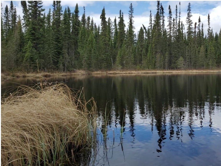
Photograph A-24: Unnamed Lake 17