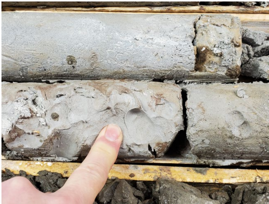
Photograph A-4: Drill core sample