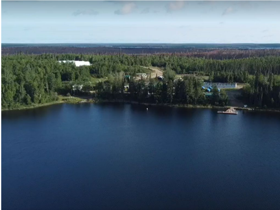
Photograph A-5: Proposed open pit area