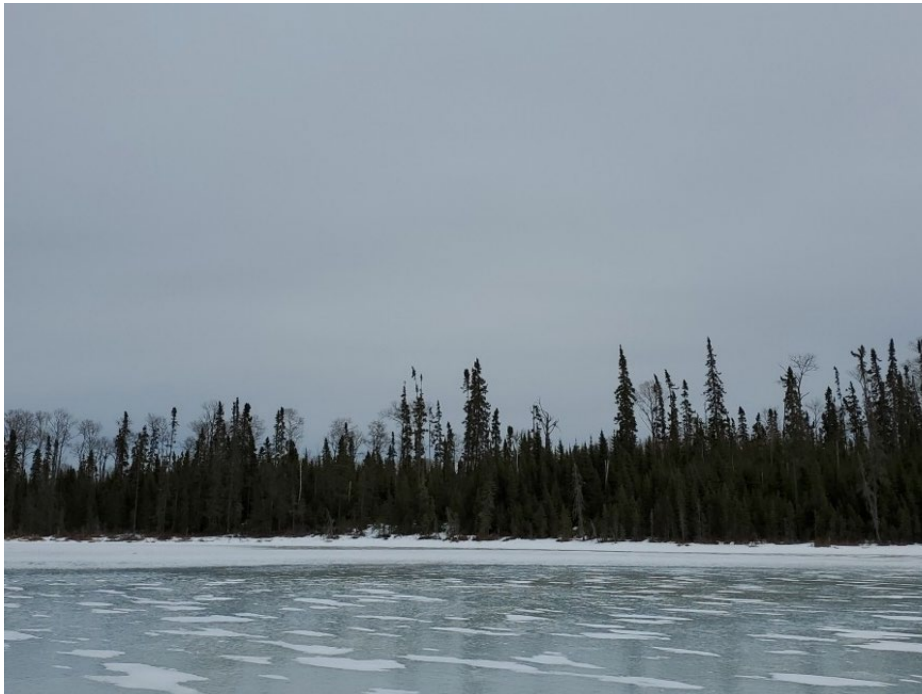
Photograph A-22: Unnamed Lake 5