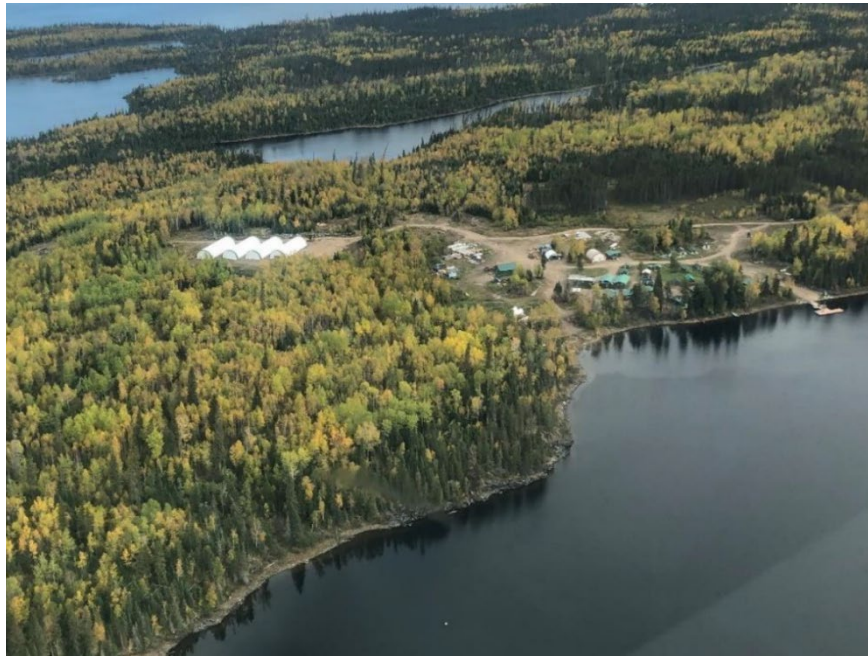
Photograph A-1: Springpole Gold Project - Existing exploration camp (fall)