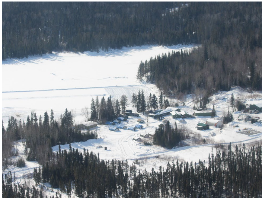
Photograph A-2: Springpole Gold Project – Existing exploration camp (winter)