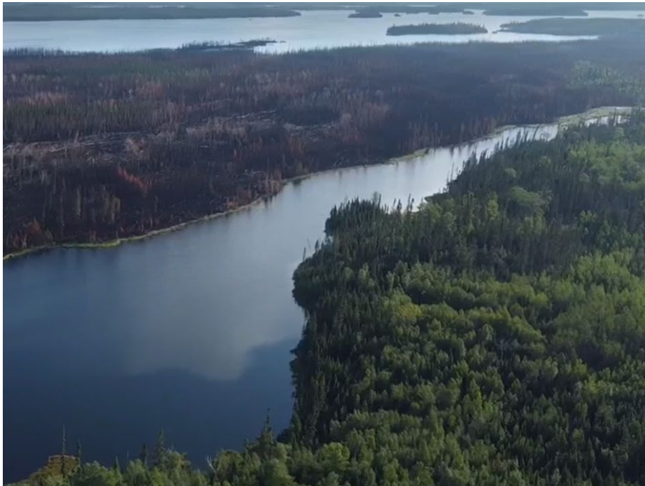
Photograph A-9: Proposed ore stockpile area, northeast of the camp