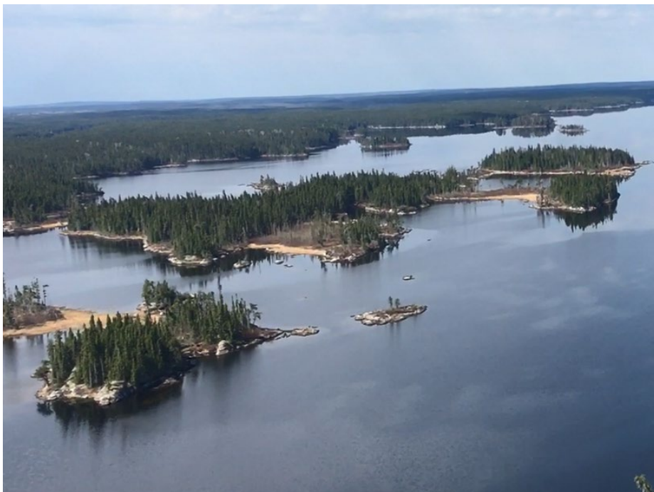
Photograph A-14: Springpole Lake, southeast arm, looking west