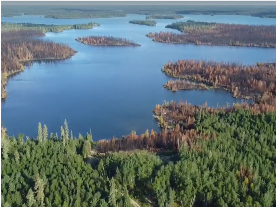
Photograph A-17: Birch Lake, looking north from the Project Site