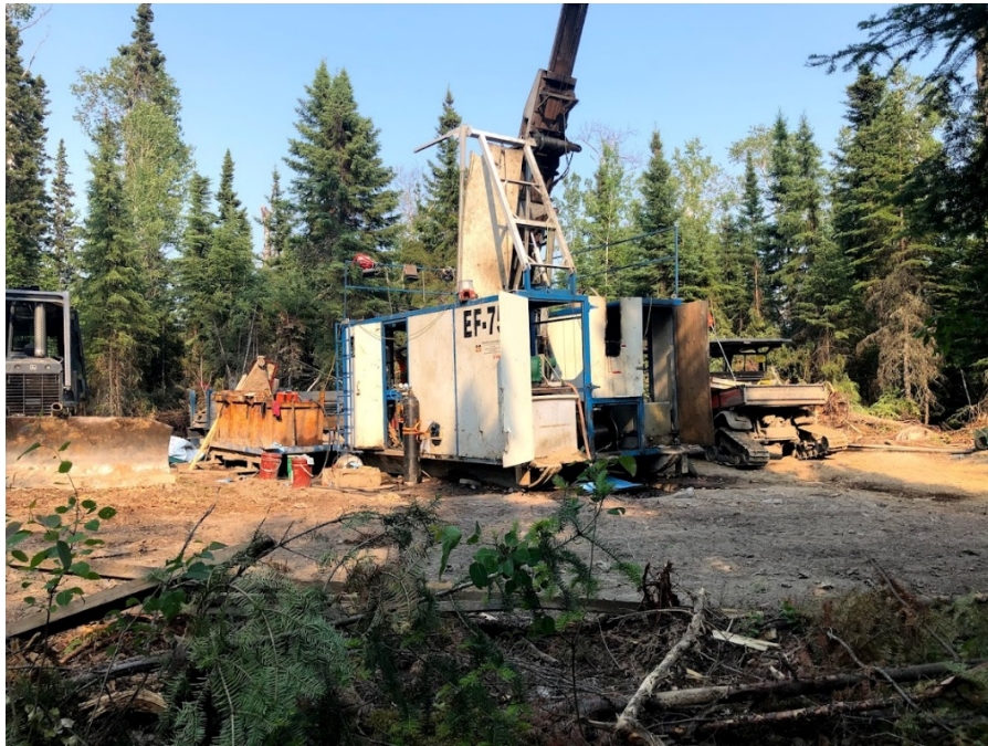
Photograph A-3: Typical Drilling Operation