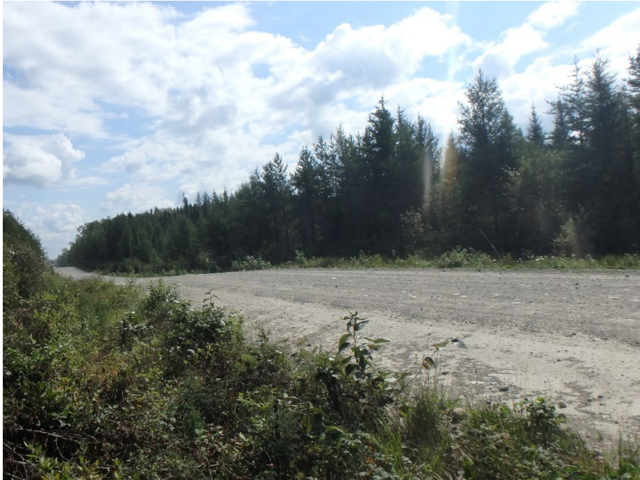
Photograph A-11: Wenesaga Road south of Springpole Gold Project near Cook Lake