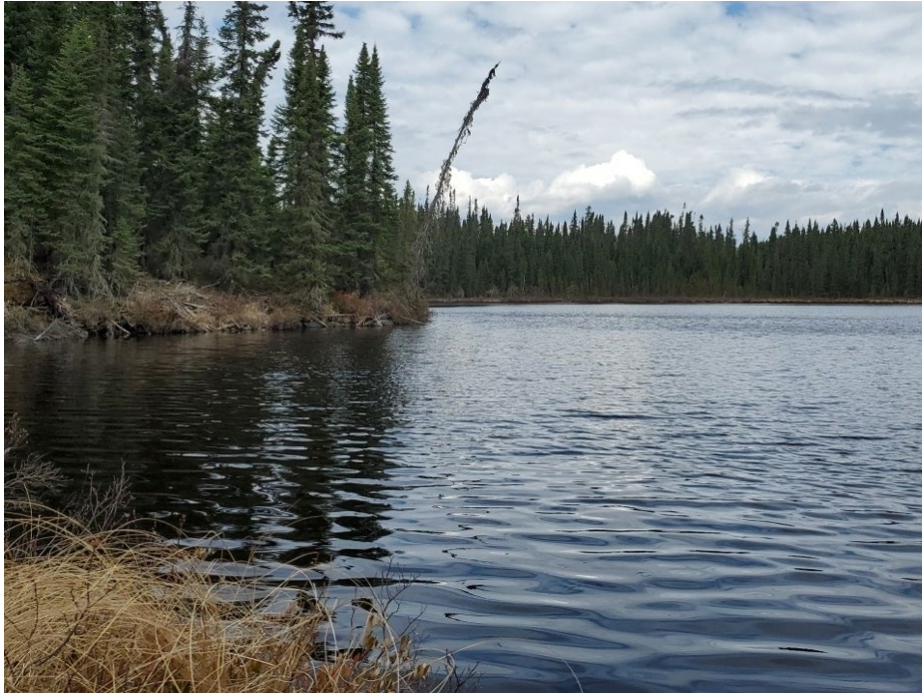
Photograph A-25: Unnamed Lake 18