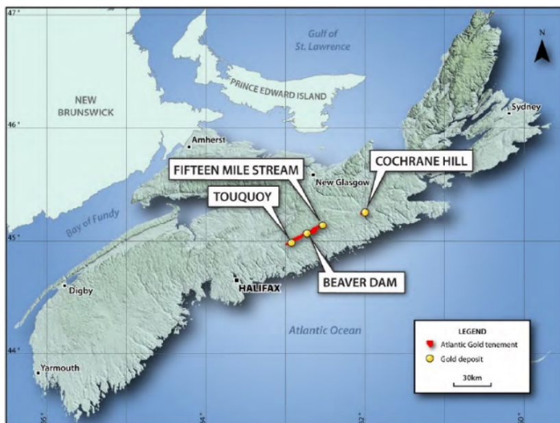
Figure 1 - Project Location Plan