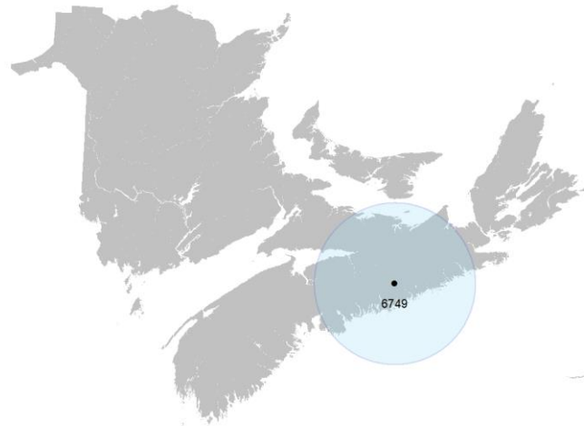
Map 1. A 100 km buffer around the study area