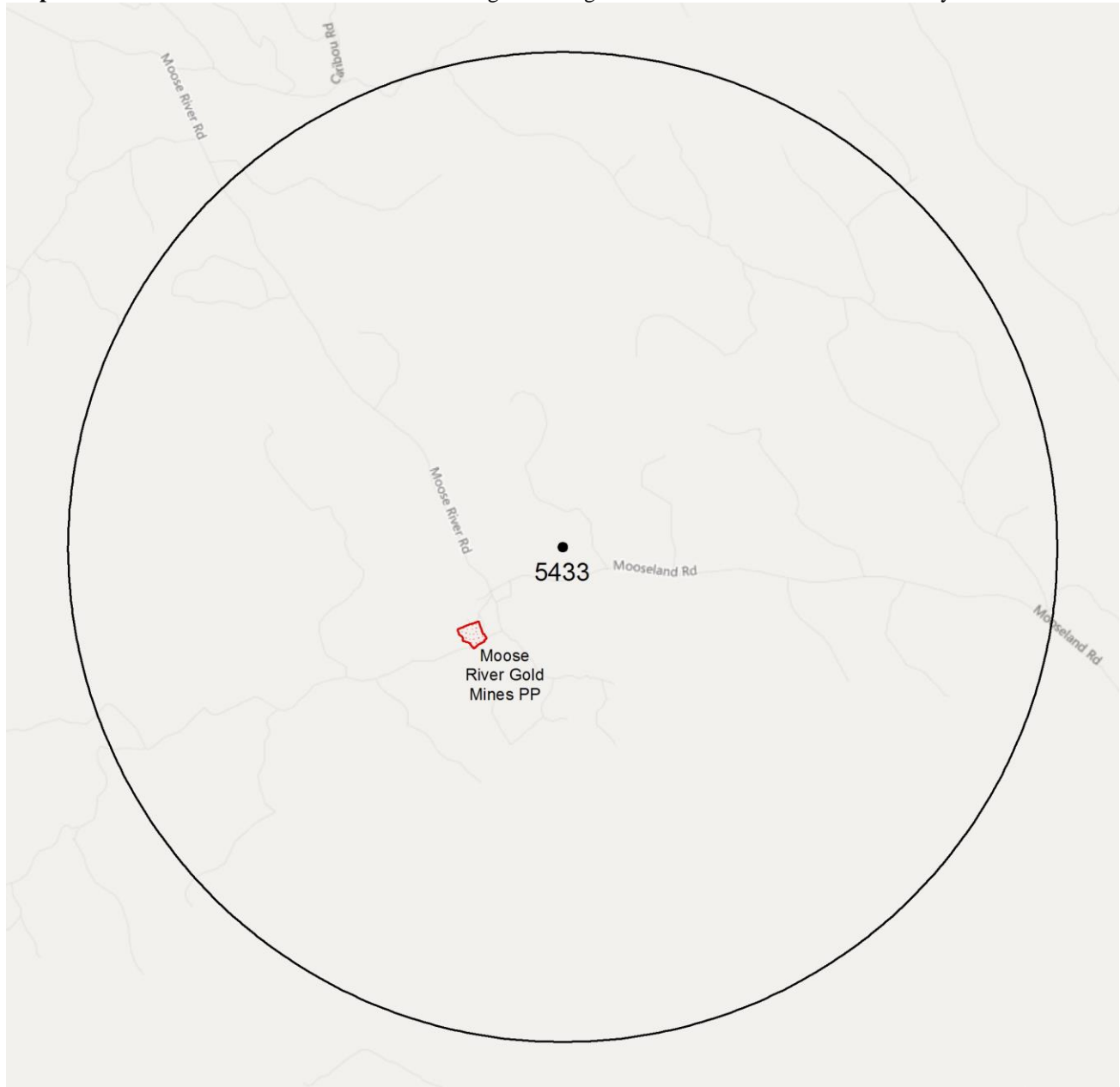
Map 3: Boundaries and/or locations of known Managed and Significant Areas within 5 km of the study area.

The GIS scan identified no biologically significant sites in the vicinity of the study area (Map 3)