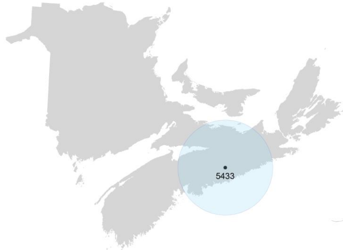
Map 1. A 100 km buffer around the study area