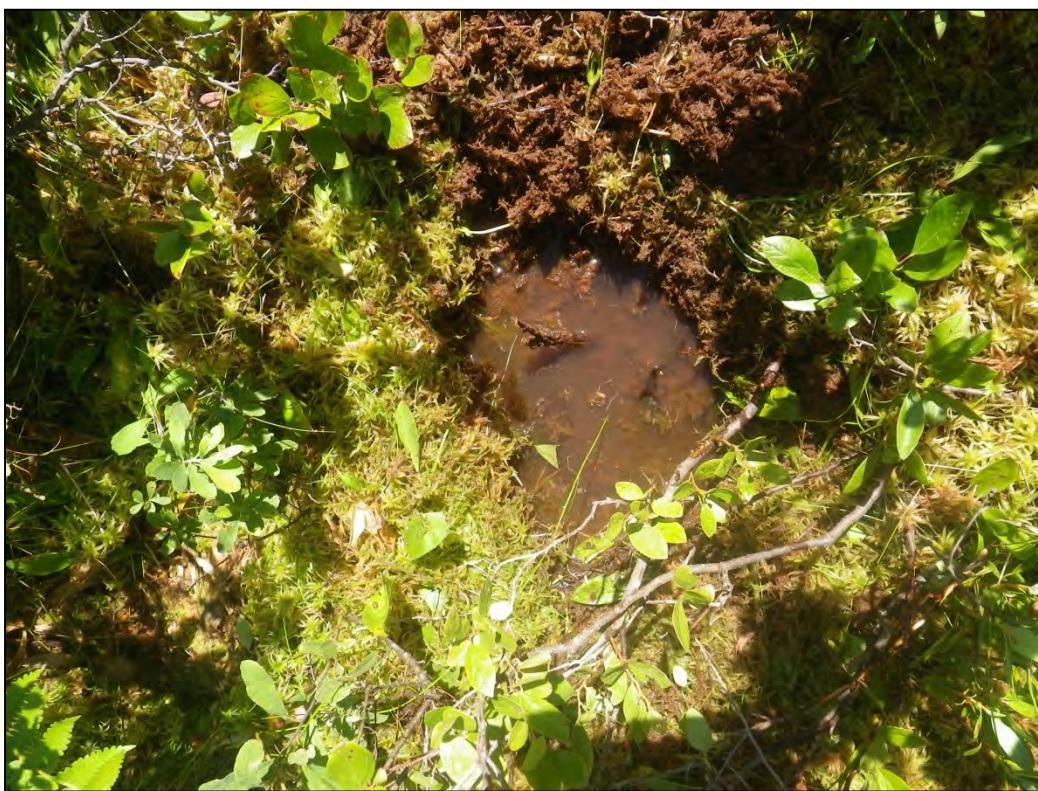
Photograph 55: Wetland 14 (WL14) – Wetland Test Pit