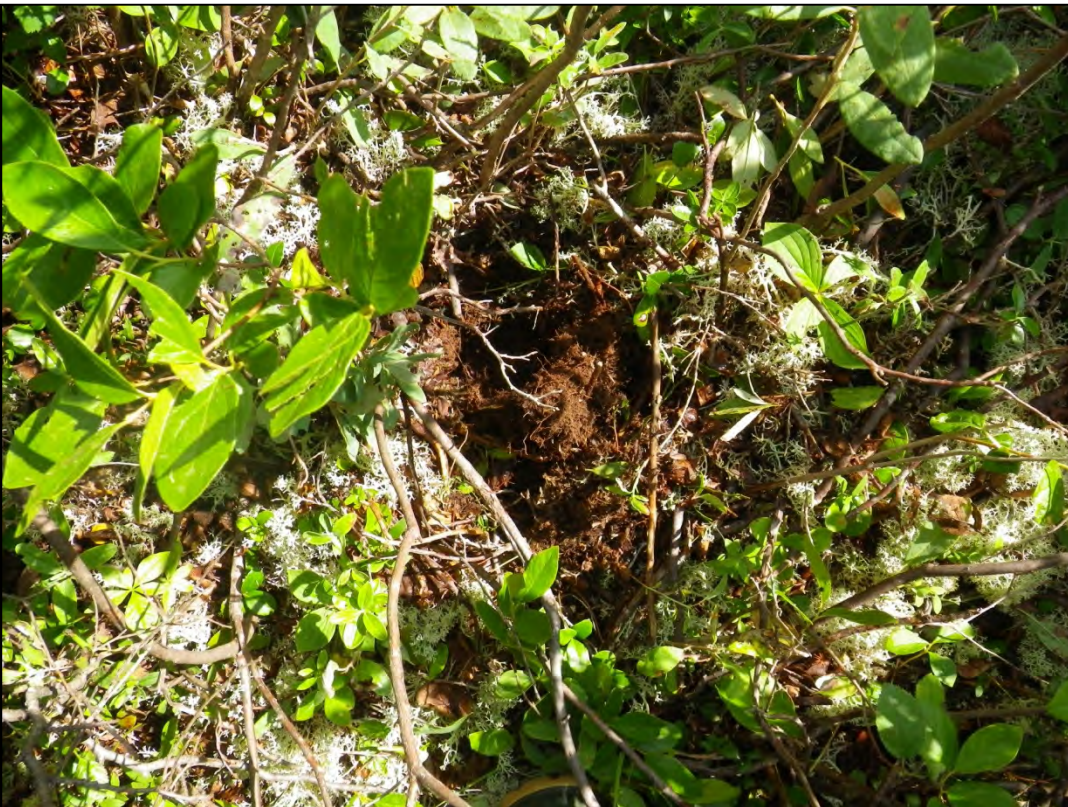
Photograph 81: Wetland 20 (WL20) – Upland Test Pit