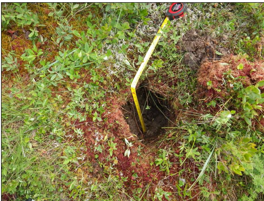
Photograph 79: Wetland 20 (WL20) – Wetland Test Pit