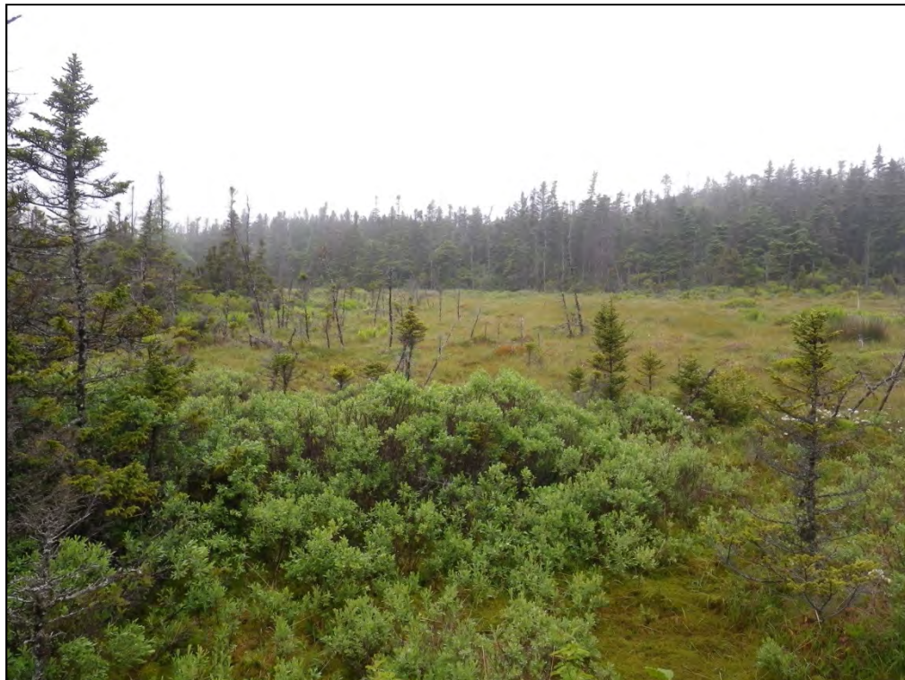
Photograph 54: Wetland 14 (WL14) – Wetland Habitat