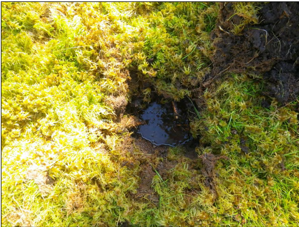
Photograph 59: Wetland 15 (WL15) – Wetland Test Pit