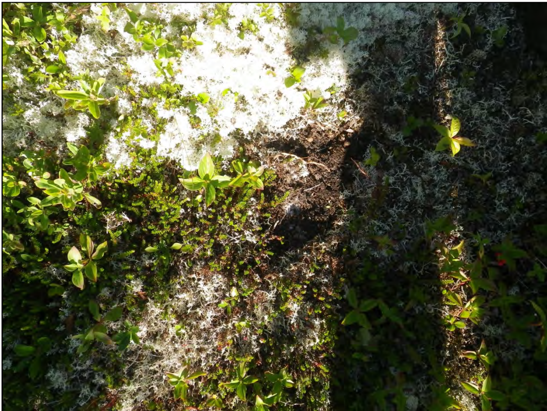
Photograph 53: Wetland 13 (WL13) – Upland Test Pit