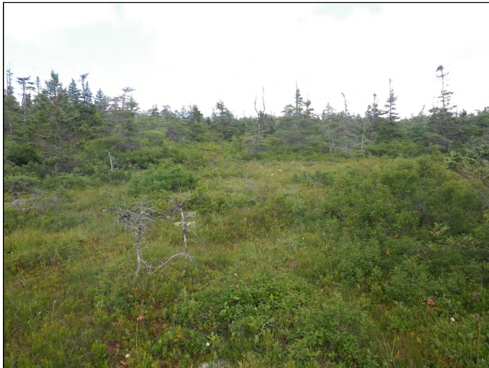
Photograph 78: Wetland 20 (WL20) – Wetland Habitat