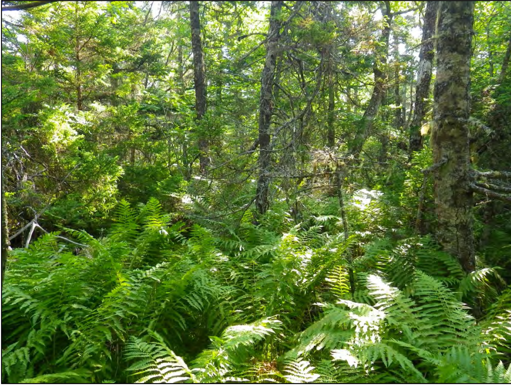
Photograph 29: Wetland 8 (WL8) – Wetland Habitat