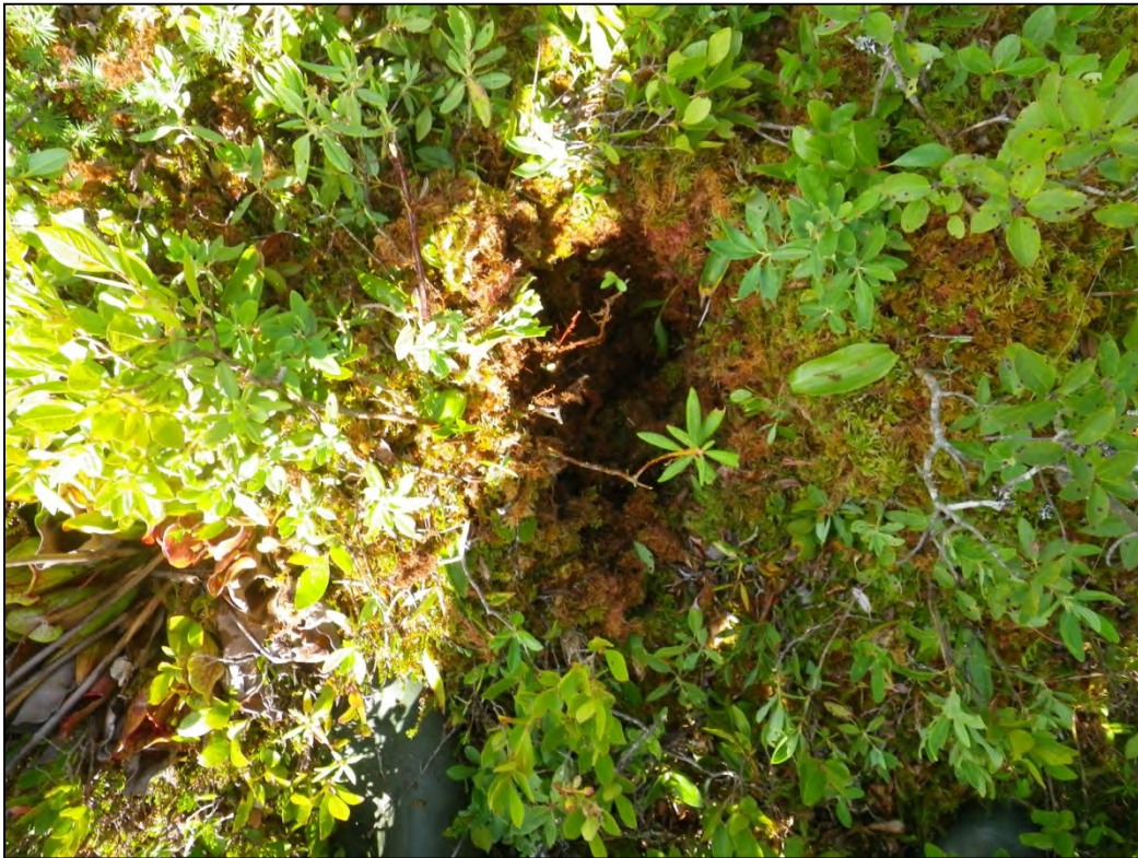
Photograph 75: Wetland 19 (WL19) – Wetland Test Pit