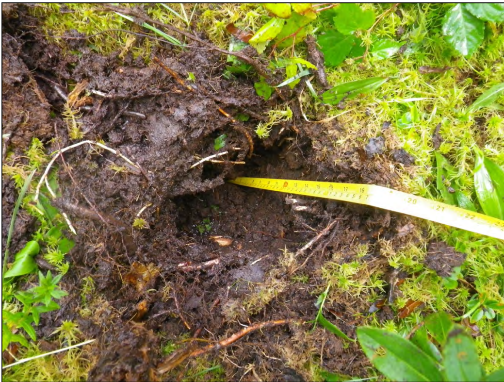
Photograph 67: Wetland 17 (WL17) – Wetland Test Pit