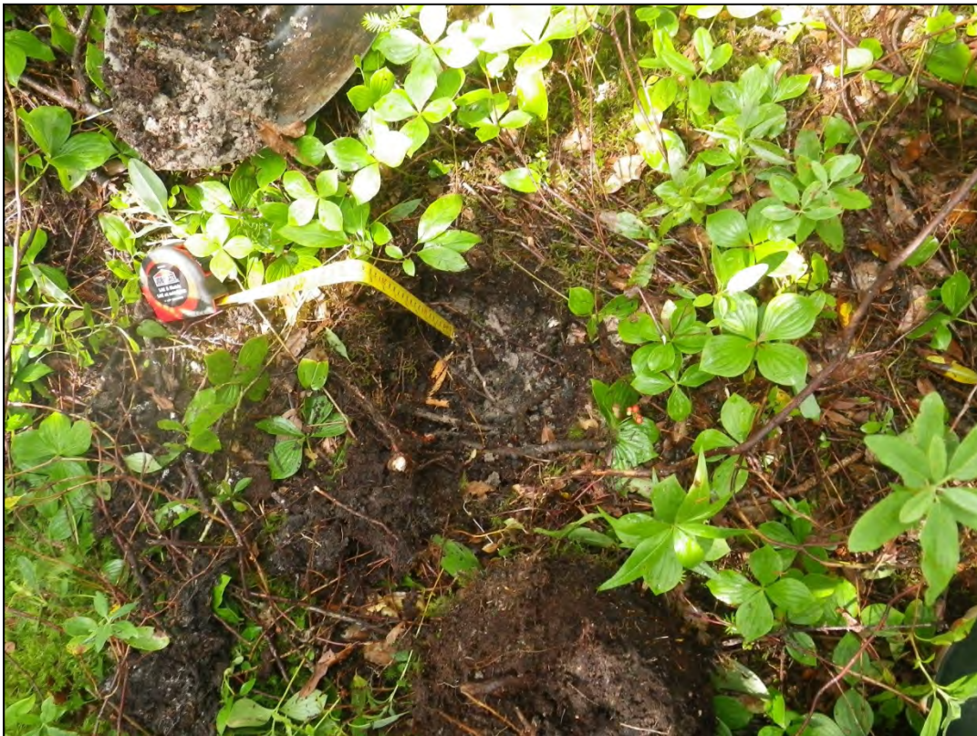
Photograph 73: Wetland 18 (WL18) – Upland Test Pit