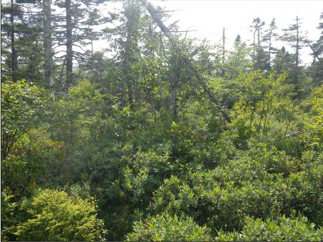
Photograph 80: Wetland 20 (WL20) – Upland Habitat