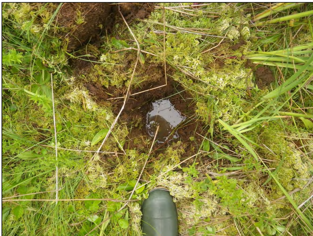
Photograph 10: Wetland 3 (WL3) – Wetland Test Pit