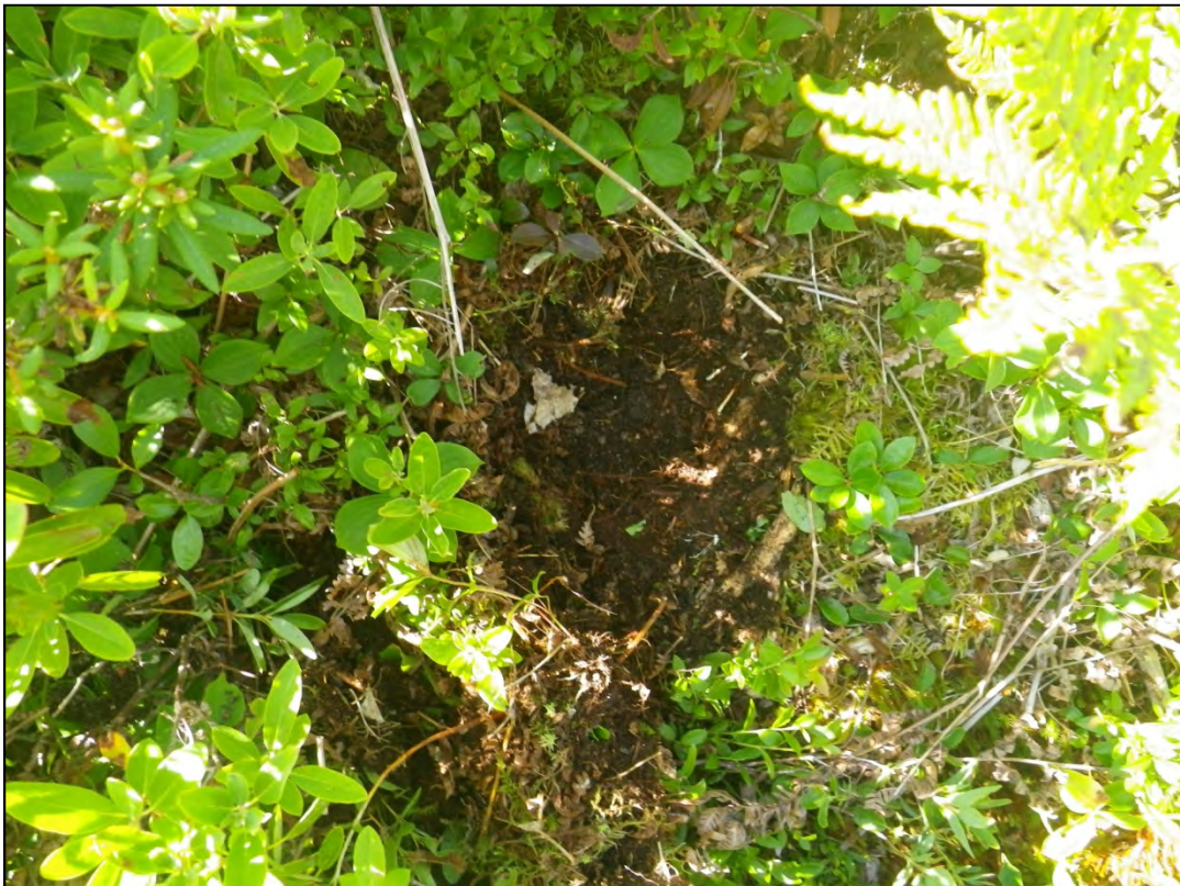
Photograph 61: Wetland 15 (WL15) – Upland Test Pit