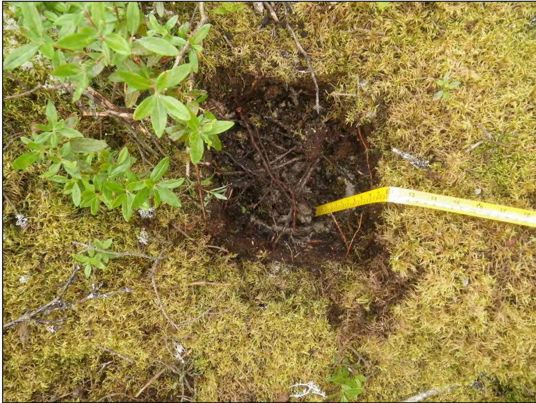
Photograph 16: Wetland 4 (WL4) – Upland Test Pit