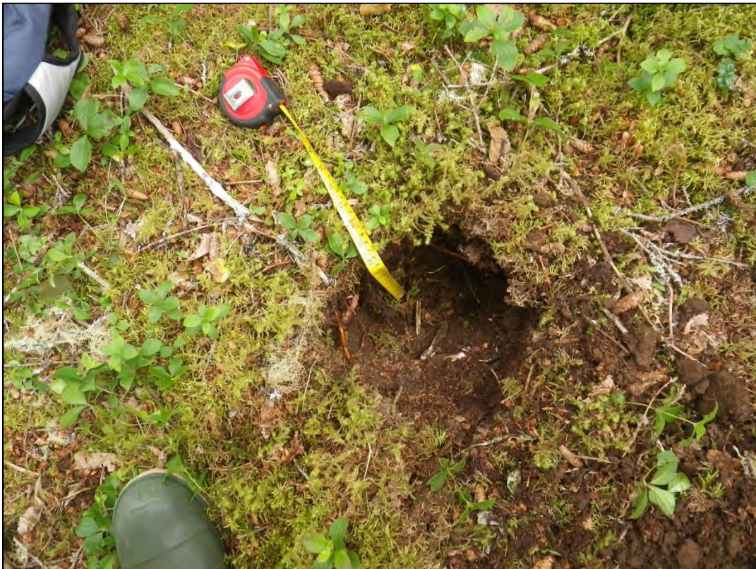
Photograph 89: Wetland 22 (WL22) – Upland Test Pit