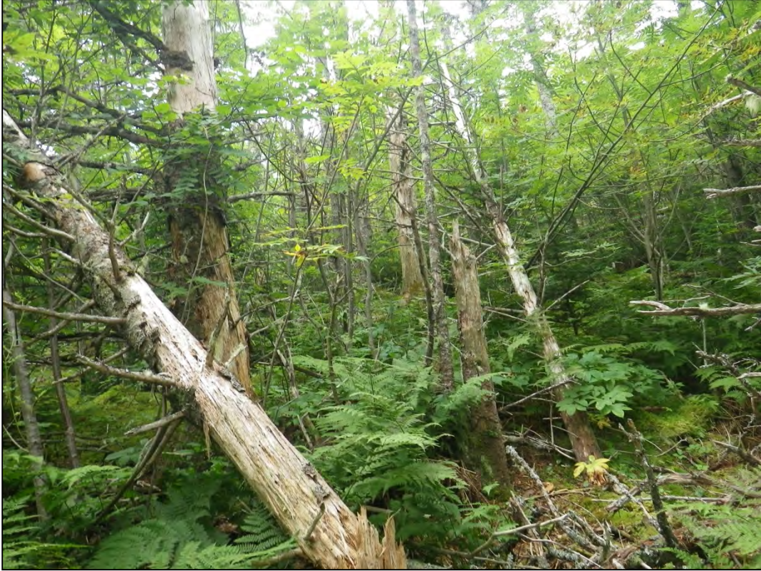
Photograph 88: Wetland 22 (WL22) – Upland Habitat