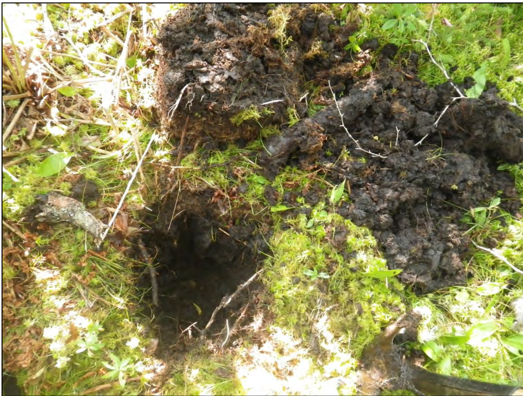
Photograph 51: Wetland 13 (WL13) – Wetland Test Pit