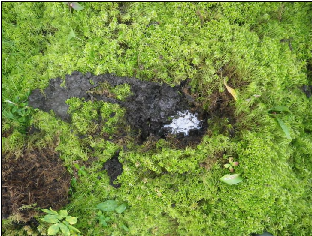
Photograph 71: Wetland 18 (WL18) – Wetland Test Pit