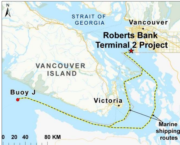
Figure 2: Marine Shipping Associated with the Roberts Bank Terminal 2 Project