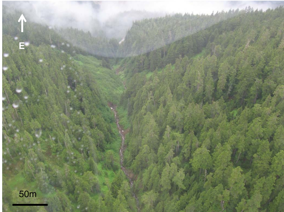
Photograph 2-1. Looking upslope at a debris flow gully at approximately 12.5 km, transmission line crosses below photo. Gullies of this type can be spanned. Locating towers above the gully side-slopes will avoid any marginally stable slopes on gully sidewalls.