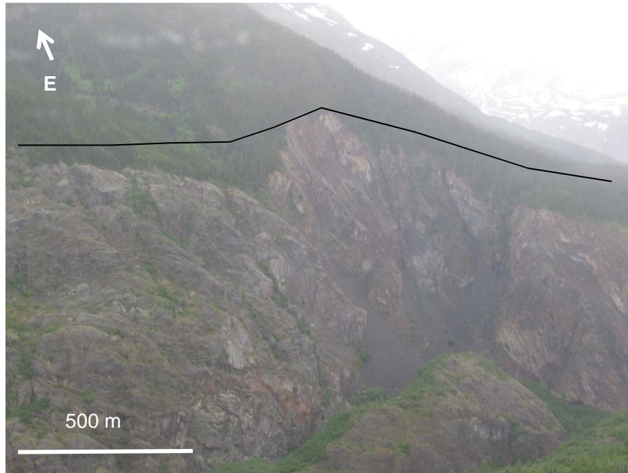
Photograph 2-3. Area of active rock fall at approximately 43 km, approximate route of proposed transmission line shown in black. Retrogression of the rock face is possible at this location through progressive rock fall.