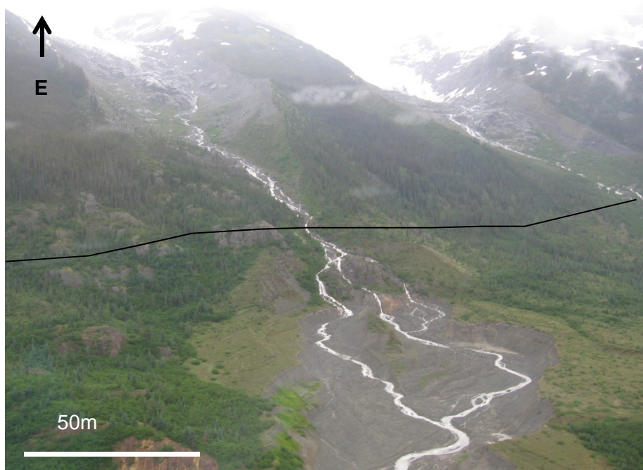
Photograph 2-2. Active channel draining a glacier at approximately 33.5 km, approximate route of transmission line shown by black line. Crossing above the fan eliminates certain fluvial hazards.