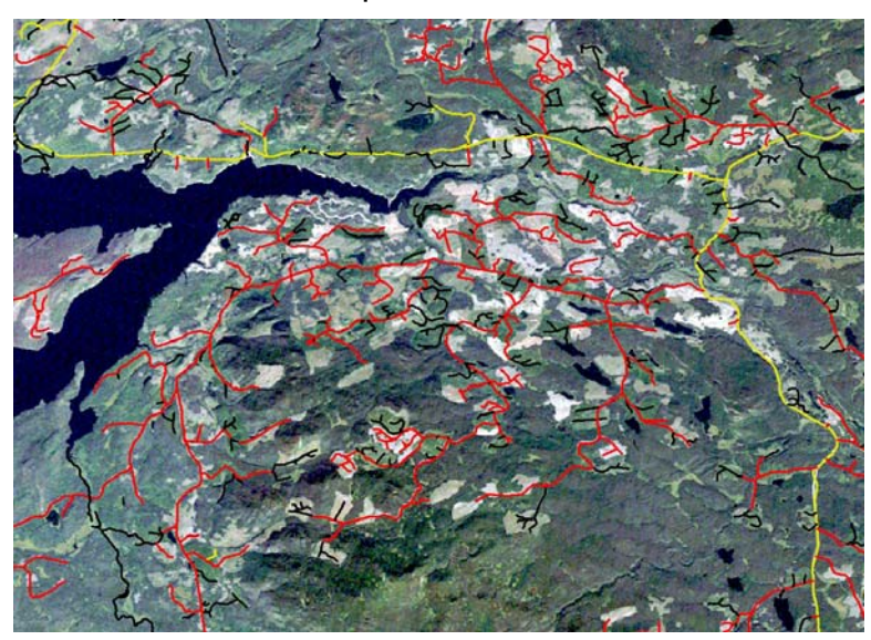
Figure 3: Example of road designations into cutblocks as a means to demonstrate how some in-block roads are included in the road density calculation.

The length of road included in the road density calculation is completely dependant on how much of the road is classified as a "permitted road" in the consolidated road inventory. In some cases, the road is permitted into the cutblock and in other cases it is not (Figure 3).