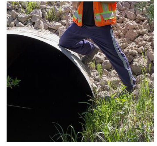
Figure 11 (bottom); Environmental Monitor Steve Jack conducting creek turbidity readings

suitable habitat for whip-poor-wills, which are a Species at Risk in the Rainy River District.