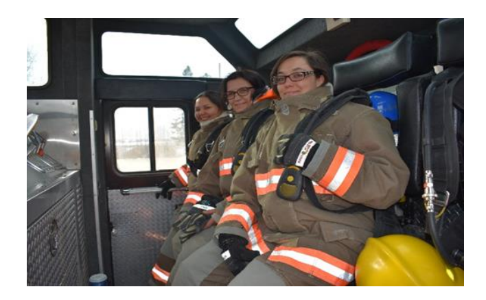
Figure 6: Emergency Response Team Training

In 2018, New Gold will continue to focus on hiring from local communities and developing our team members.