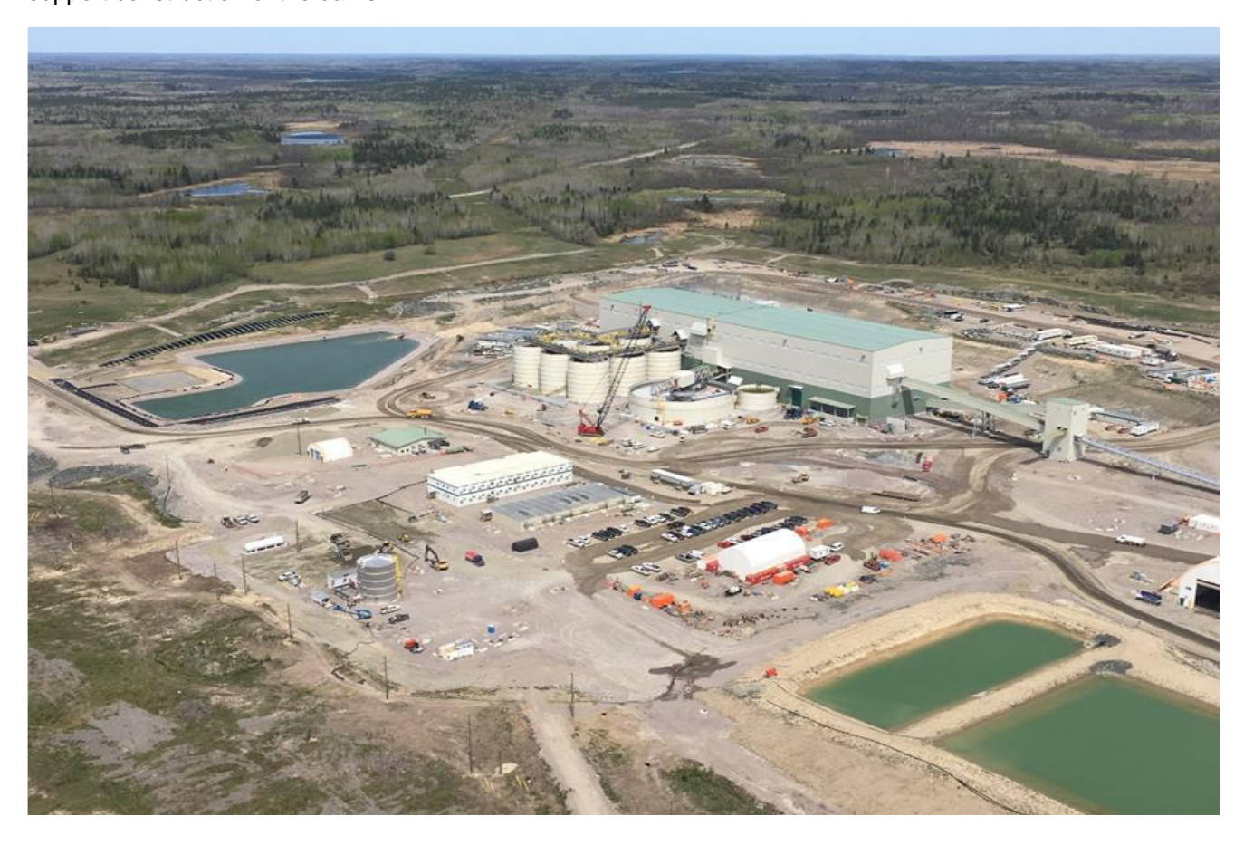
Figure 5: Plant Site Area May 2017

In addition to mining and stockpiling ore, the mine fleet was able to deliver material to the TMA and WMP to support construction of the dams.