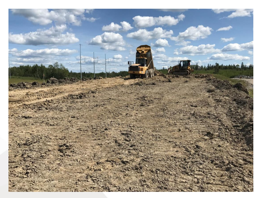
Figure 7: Hauling and blading cover system material on the plateau surface.