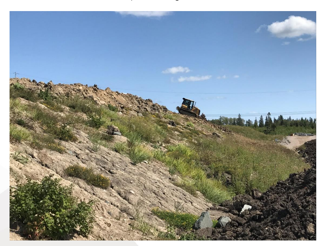
Figure 4: Construction of the south slope of the vegetation trial landform.