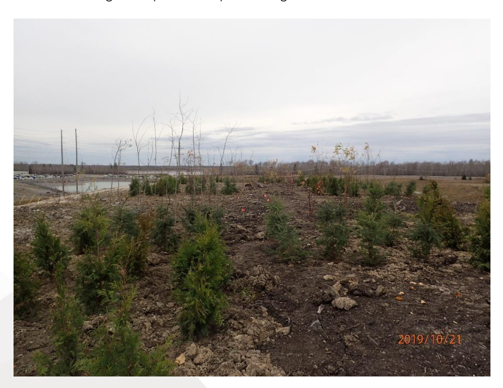
Figure 17: Tree seedlings on experimental plots looking west.