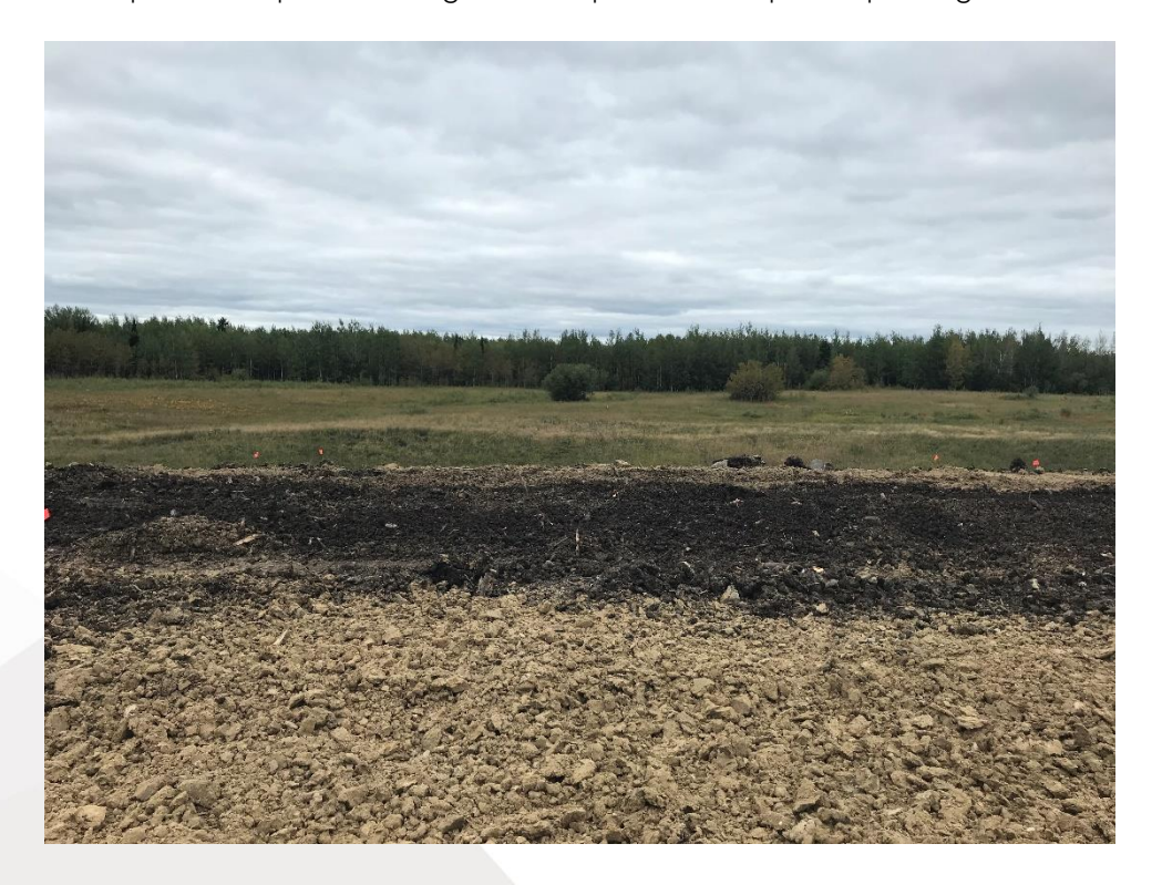
Figure 12: Experimental plots looking north.