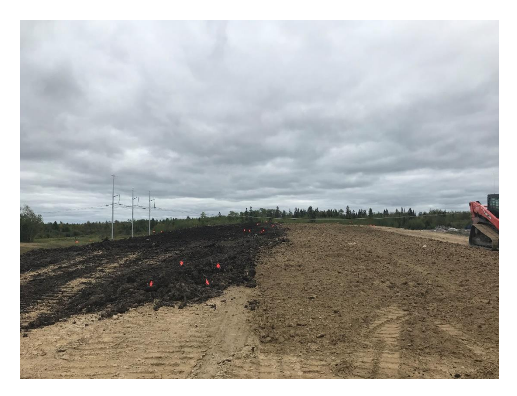
Figure 11: Experimental plots following final incorporation and prior to planting.