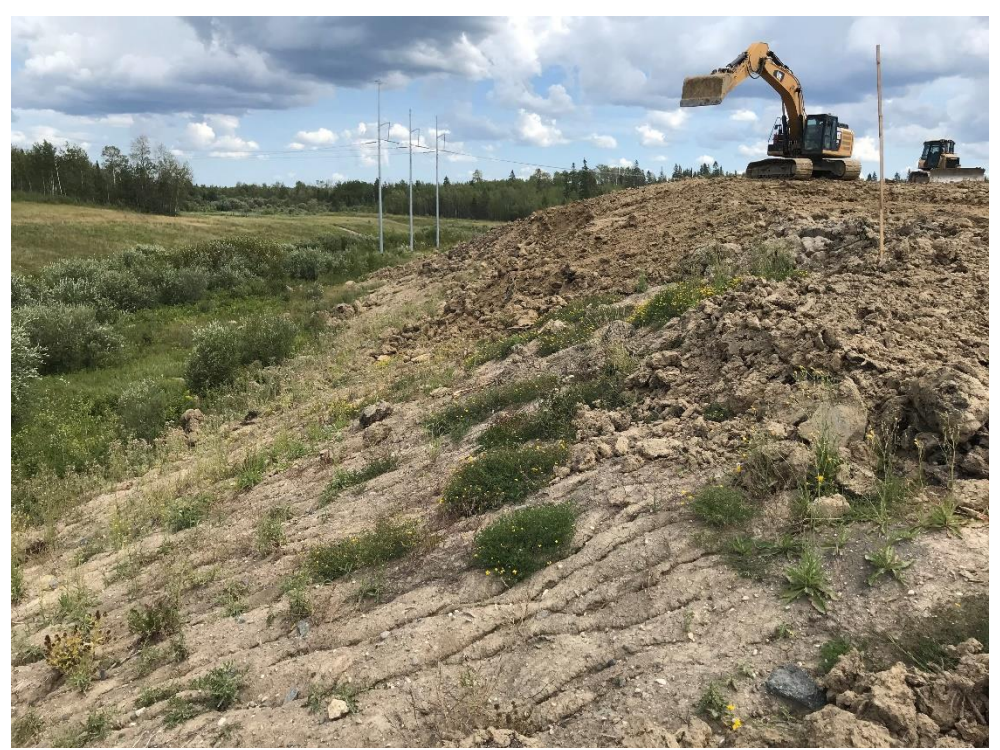
Figure 3: Construction of the north slope of the vegetation trial landform.