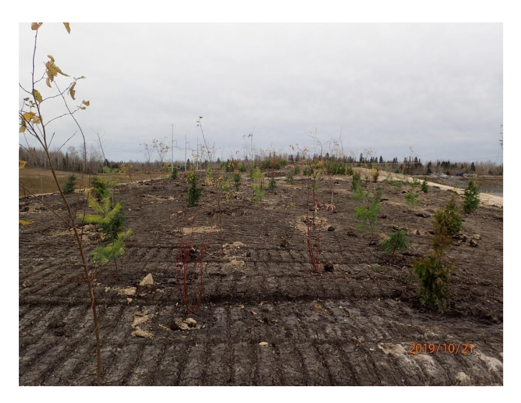
Figure 16: Tree seedlings on experimental plot looking east.