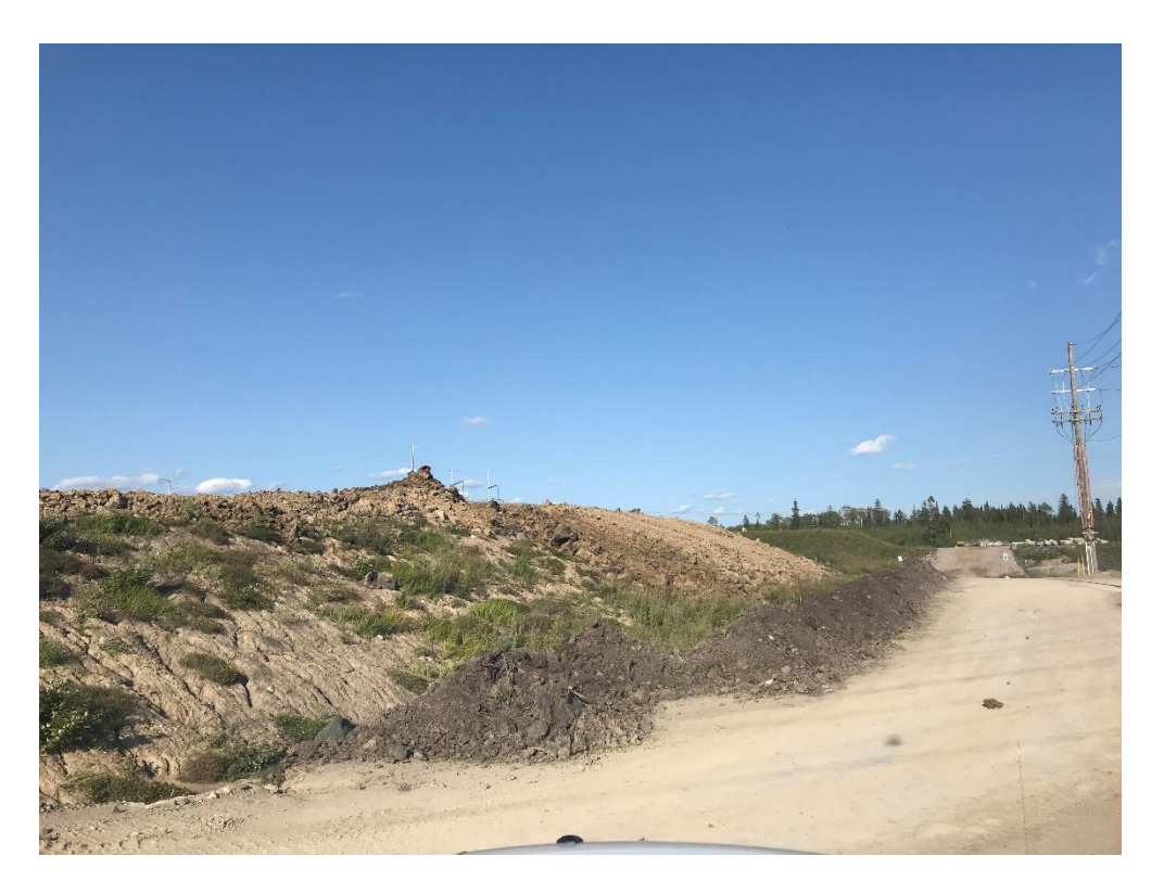
Figure 5: Construction in progress of the south slope of the vegetation trial landform.

Construction of the slopes progressed well despite periodic work disruptions due to heavy rain. Okane personnel were able to stake out the layout of the plateau area prior to construction on that area (Figure 6). Overburden was then hauled to the plateau surface and bladed to the specified depth (Figure 7) for subsequent compaction (Figure 8). Additional overburden was subsequently placed over the compacted overburden layer to the specified depth (Figure 9).