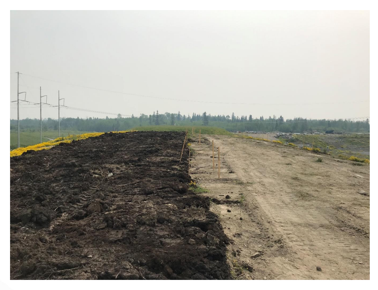
Figure 1: Initial plateau construction showing topsoil placement on the northern half of the plots (left side of figure).

Mobilization for cover system construction on the vegetation trial began on June 24, 2019. Initial layout of the cover system plots was completed on June 28, 2019, with topsoil being placed immediately afterward. Topsoil was placed on the north plots beginning around July 5 (Figure 1).