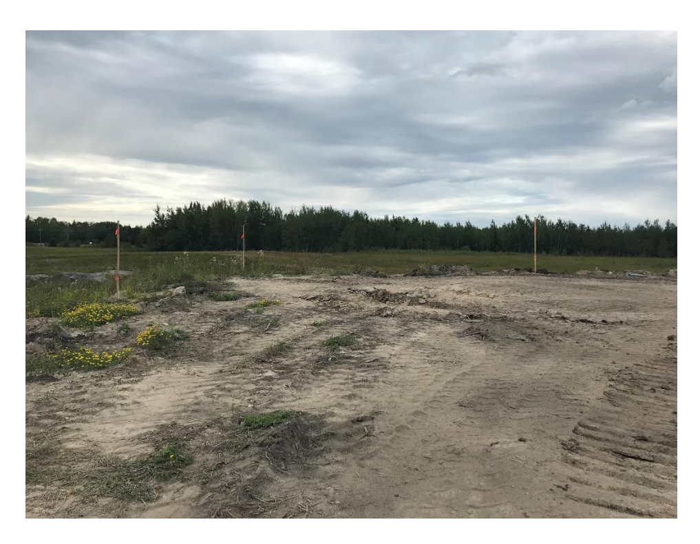
Figure 6: Layout of the plateau surface area prior to cover placement.