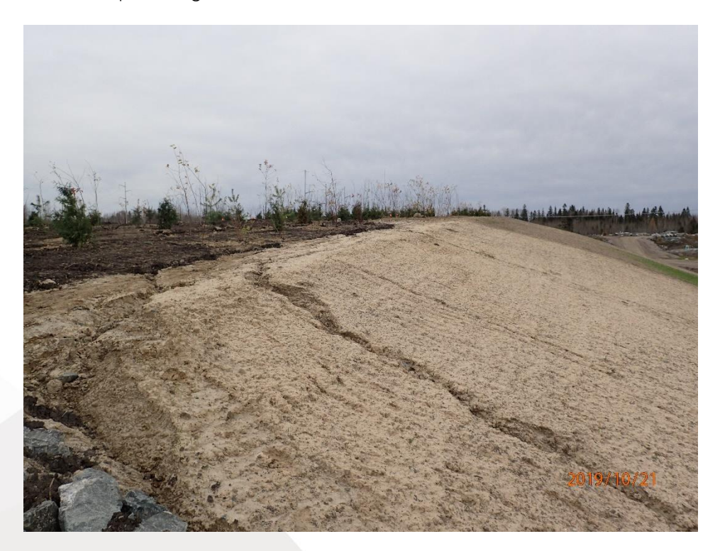
Figure 15: Rill erosion on unseeded control plot.