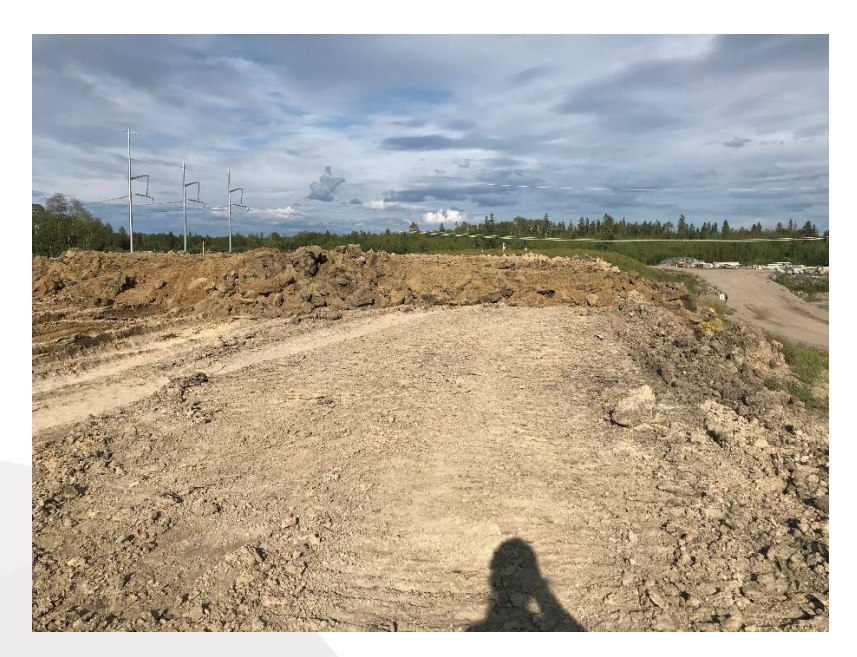
Figure 9: Placement of the overburden cover system on the plateau area.