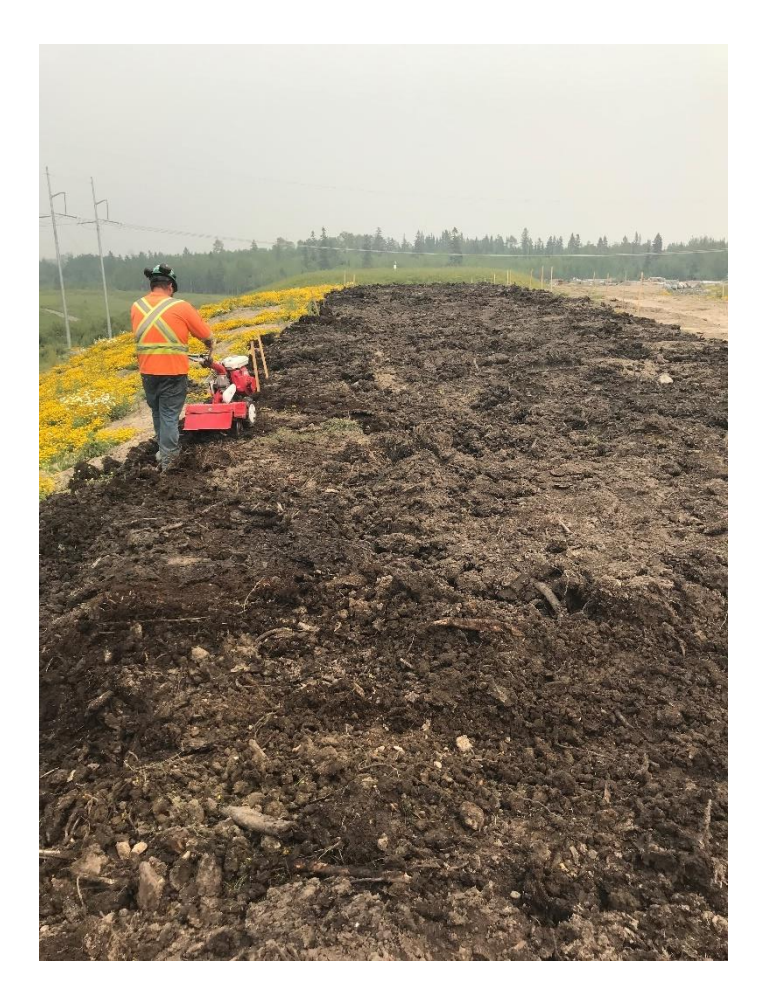
Figure 2: Initial effort at topsoil incorporation using a garden rototiller.

A cursory inspection of the cover system on July 7, 2019 found large boulders were protruding through what was assumed to be the final cover thickness. Closer inspection found that waste rock was visible in certain areas where the cover system was especially thin. The thickness of the cover system was then measured for quality control purposes. It was discovered that the cover system did not meet specifications in any locations across the landform. Work on plot construction was halted and Okane personnel left the site.