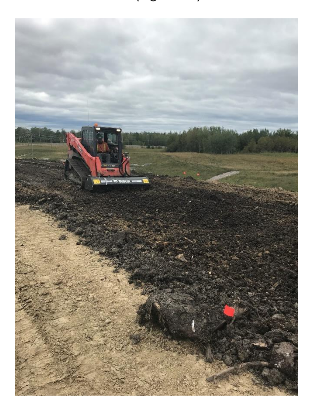
Figure 10: Topsoil incorporation into experimental plots using tiller attachment.

The final phase of construction for the 2019 field season concluded with construction of the plateau cover system and the destructive plots on the lower plateau. Final plot construction was conducted between September 3 and 8, 2019. Experimental plots were flagged, and topsoil was incorporated using a purpose-built tiller implement on a skid-steer (Figure 10). The same implement was then used to incorporate fertilizer and the southern half of the experimental plots was completed (Figure 11). Construction of the experimental plots took place between September 6 and 7, 2019 (Figure 12).