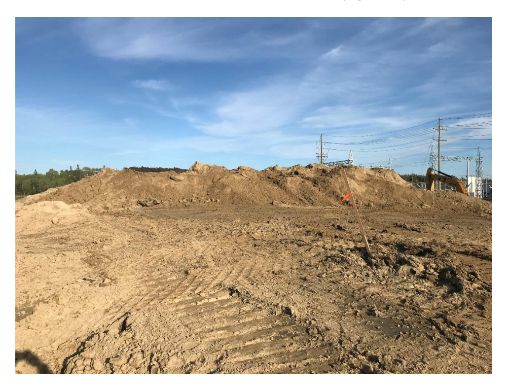
Figure 13: West slope plateau (destructive plot) area prior to grading material.

The western slope and associated plateau were constructed during the final phase of work for the year. The plateau on the western side of the vegetation landform is known as the Destructive Plot and is meant to serve as an area that can be destructively sampled at regular annual intervals throughout the life of the program. Material was spread and quality control indicated that the cover system met specifications (Figure 13).