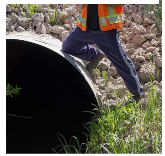
Figure 11 (bottom); Environmental Monitor Steve Jack conducting creek turbidity readings

suitable habitat for whip-poor-wills, which are a Species at Risk in the Rainy River District.