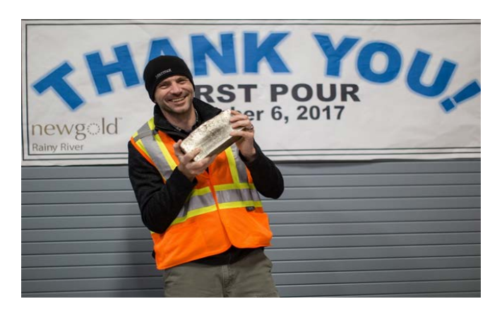
Figure 7: New Gold Employee at First Gold Pour