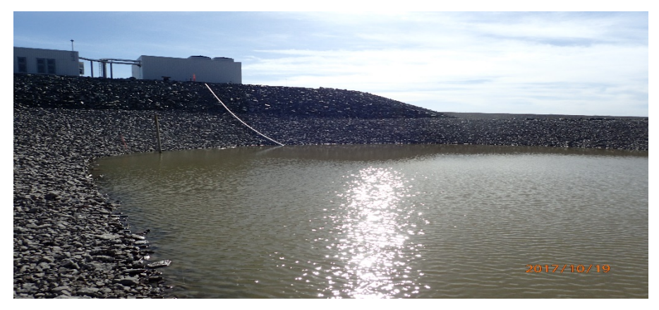
Figure 2: Water Management Pond Intake Structure, October 2017

The subsections that follow provide an overview of the activities conducted onsite during 2017.