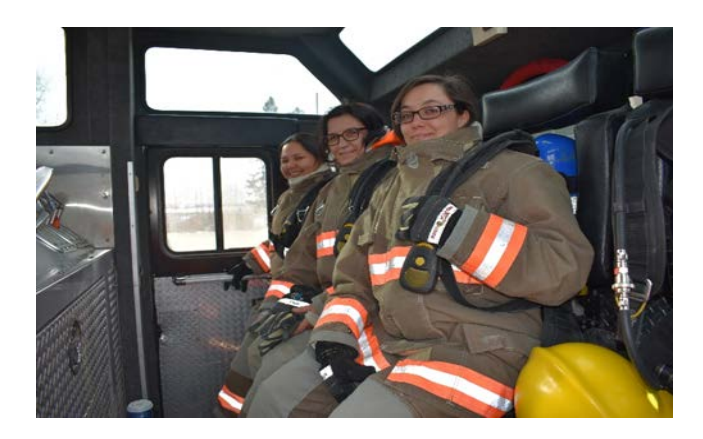
Figure 6: Emergency Response Team Training

In 2018, New Gold will continue to focus on hiring from local communities and developing our team members.