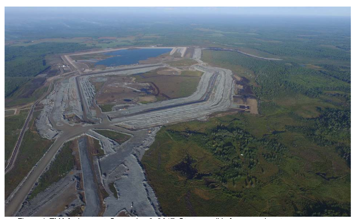
Figure 4: TMA facing west, September 2, 2017. Start up cell in foreground, water management pond in background

Construction activities in the TMA for 2018 will include the completion of cell 2 and cell 3, sediment ponds 1 and 2, water discharge pond, West Creek Diversion (tie in of Marr Creek) and temporary culvert removals