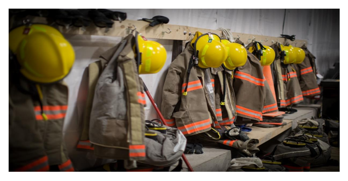
Figure 3: Emergency Response Team Safety Gear