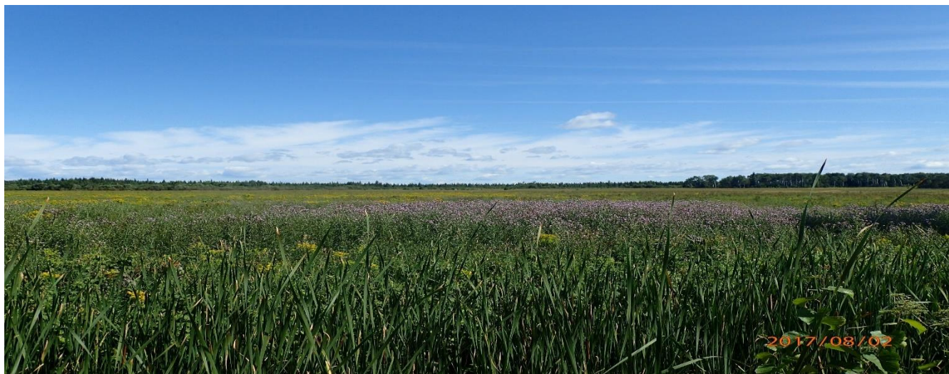
Figure 1: Offset Benefit Lands, North of Neilson Road August 2017

Key areas discussed in this report are; Aboriginal and community Consultation, project development, reclamation activities, protection of fish and wildlife, migratory birds, health of Aboriginal peoples, site archaeology, heritage and cultural resources. This document also contains a summary of monitoring and research activities associated with water and air quality as well as wildlife and aquatic monitoring.