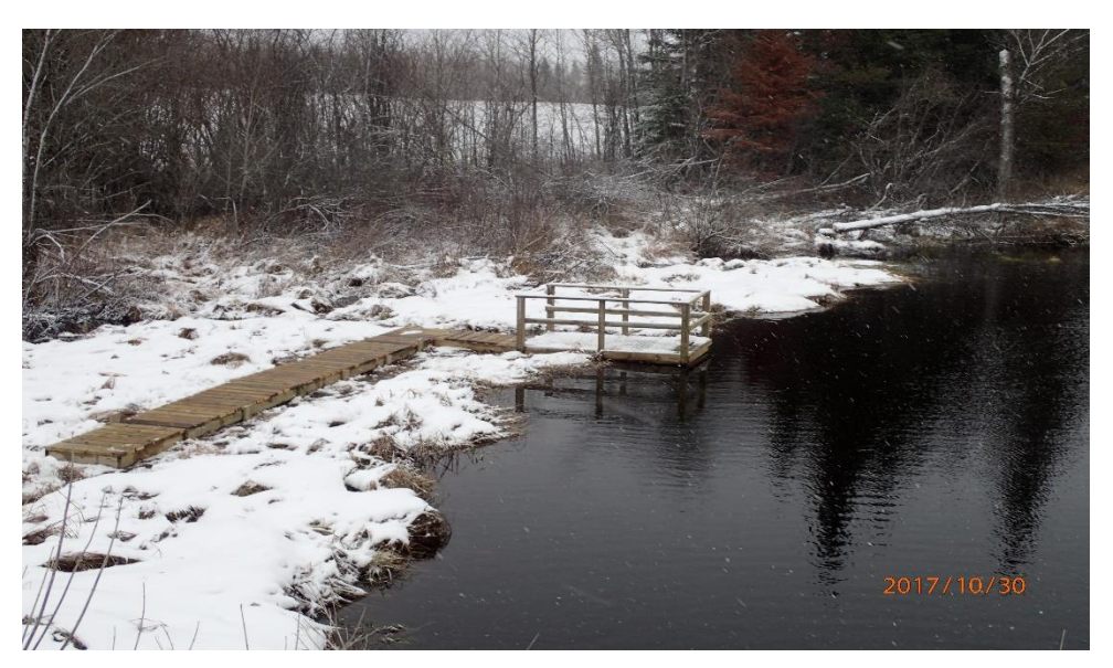
Figure 12: Water sampling platform installed on the Pinewood River

Information related to the environmental activities and monitoring that occurred in 2017 can be found in the following appendices of this report.