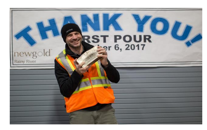
Figure 7: New Gold Employee at First Gold Pour