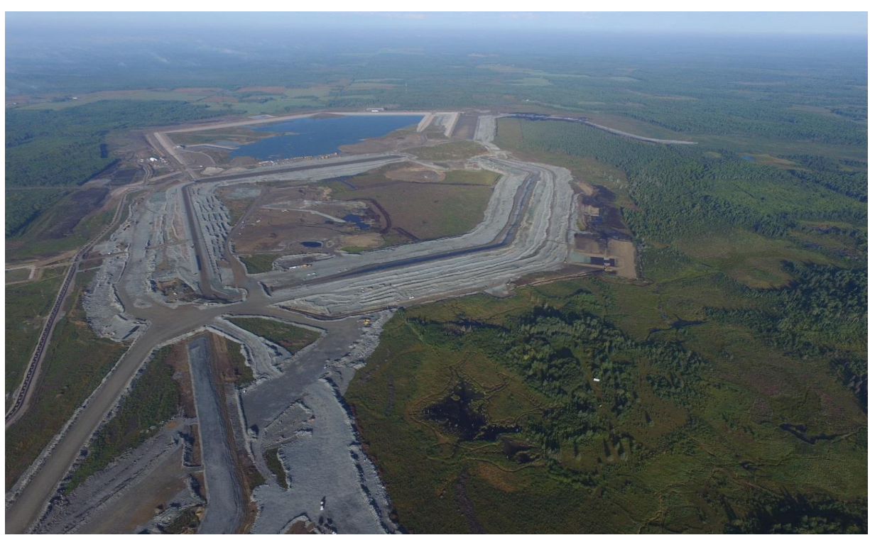
Figure 4: TMA facing west, September 2, 2017. Start up cell in foreground, water management pond in background

Construction activities in the TMA for 2018 will include the completion of cell 2 and cell 3, sediment ponds 1 and 2, water discharge pond, constructed wetland, West Creek Diversion (tie in of Marr Creek) and temporary culvert removals