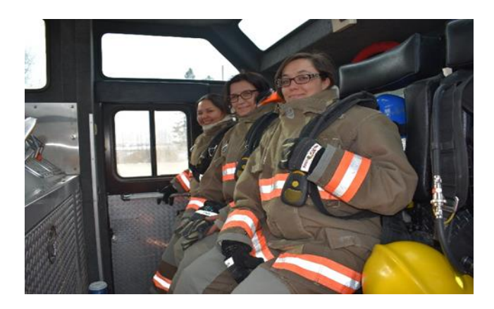
Figure 6: Emergency Response Team Training

In 2018, New Gold will continue to focus on hiring from local communities and developing our team members.