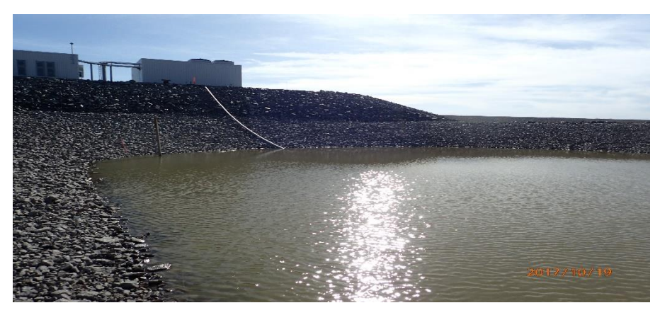
Figure 2: Water Management Pond Intake Structure, October 2017

The subsections that follow provide an overview of the activities conducted onsite during 2017.