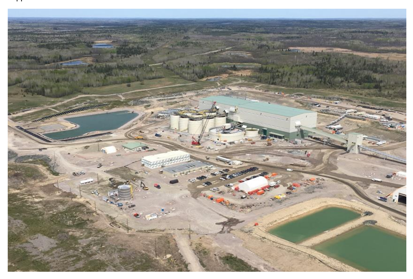
Figure 5: Plant Site Area May 2017

In addition to mining and stockpiling ore, the mine fleet was able to deliver material to the TMA and WMP to support construction of the dams.