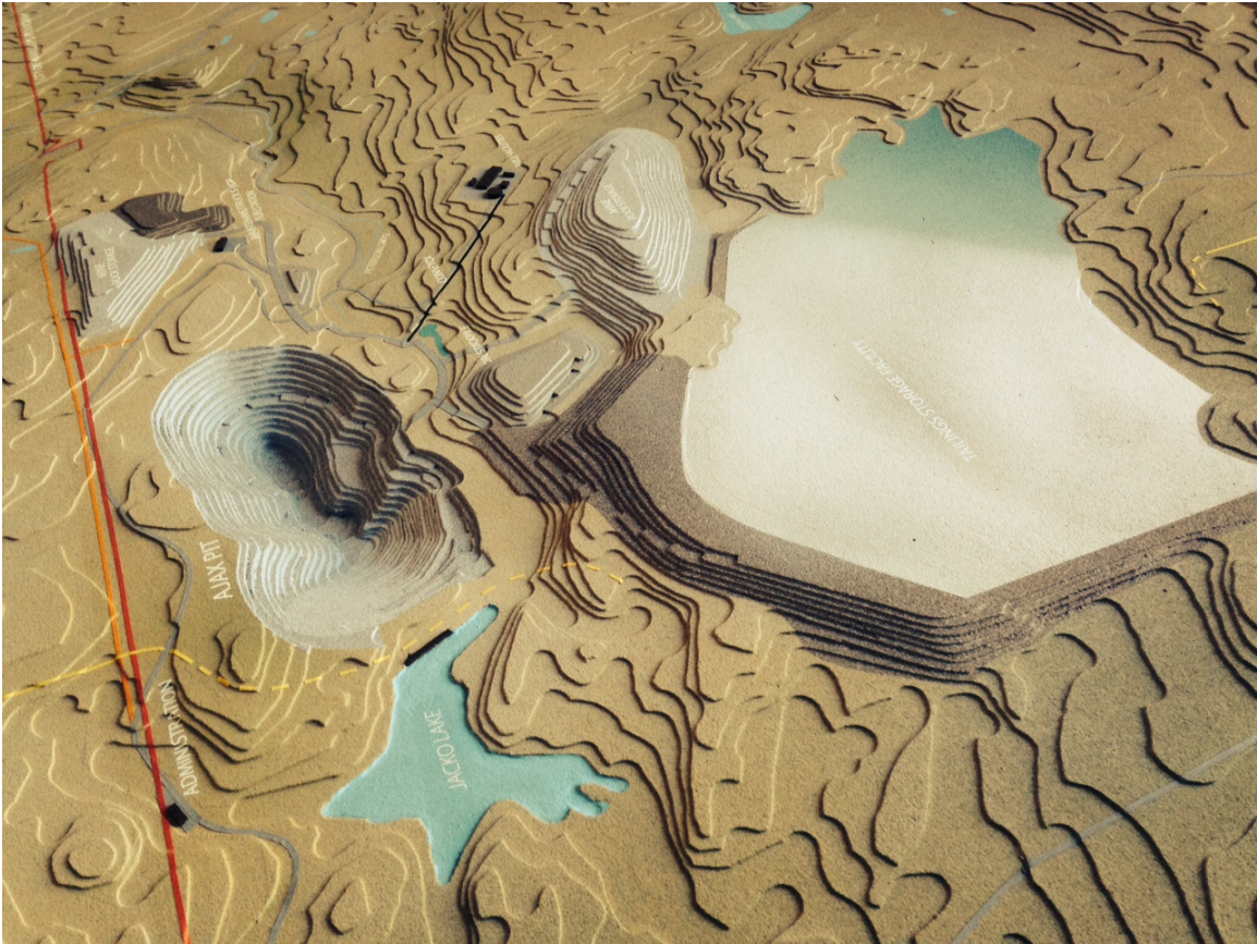
Photograph of a 3-D table top model used at open houses to show people the layout of the proposed Ajax Project.